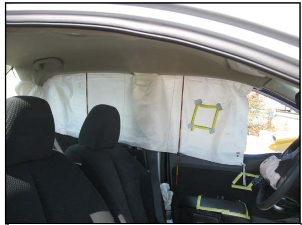
Figure 7: Inboard side of the left IC, including driver's head contact in the Nissan.

The deployed left IC measured 148 cm (58.3 in) in length. It measured 42 cm (16.5 in) in height at the front and rear seating positions and was tethered to the left A-pillar by a webbing strap that was 38 cm (15 in) in length. Vertically, the IC air bag extended below the belt line at the front and rear outboard seating positions. The left IC provided head protection from the left C-pillar forward to a location 38 cm (15 in) aft of the left A-pillar. The IC was labeled with the nomenclature "6105534D SI/PA 6.6". There was a scuff mark attributed to the driver's head on the inboard side of the left IC. This scuff mark was located 16-26 cm (6.3-10.2 in) rear of the front edge of the IC and 14-24 cm (5.5-9.4 in) above the lower edge