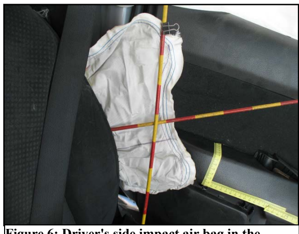
Figure 6: Driver's side impact air bag in the Nissan.

The deployed side impact air bag (Figure 6) measured 38 cm (15 in) in height. The forward edge of the bag had a curved shape and measured 16 cm (6.3 in) and 15 cm (5.9 in) in width at the upper and lower aspects, respectively, and 10 cm (3.9 in) in width at the center. The left side air bag deployed from a 32 cm (12.6 in) tear seam in the outboard aspect of the left seatback.