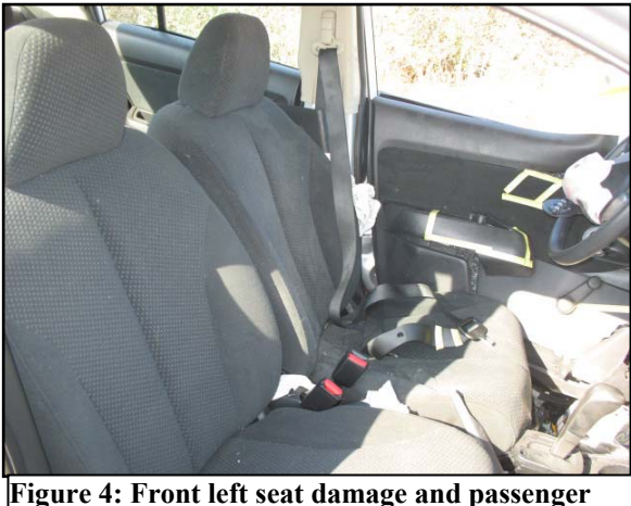
Figure 4: Front left seat damage and passenger compartment intrusion in the Nissan.

The A-pillar of the Nissan intruded laterally 2 cm (0.8 in). The maximum crush to the Nissan was located aft of the A-pillar, and the greatest extent of interior lateral intrusion was to the forward lower quadrant of the