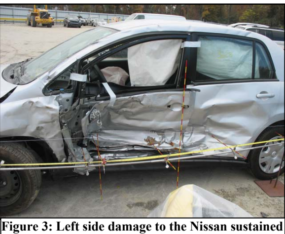
in the initial impact event.

The left side of the Nissan sustained moderate severity damage from the initial impact with the Toyota (Figure 3). The left front door of the Nissan was repositioned to the vehicle for the damage measurements. The direct contact damage began 55 cm (21.7 in) forward of the left rear axle and extended forward 174 cm (68.5 in). The maximum crush was 40 cm (15.7 in), located at the forward aspect of the left front door, 182 cm (71.7 in) forward of the left rear axle. The combined direct and induced damage (Field L) began 7 cm (2.8 in) forward of the left rear axle and extended 312 cm (122.8 in) forward. The residual crush profile was measured at the lower door level and was as follows: C1 = 0 cm, C2 = 17 cm (6.7