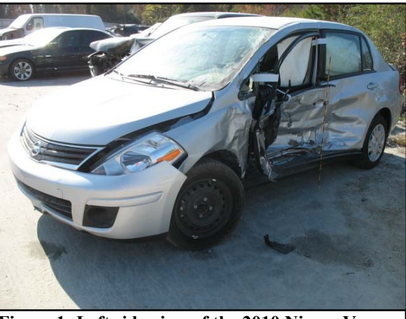
Figure 1: Left side view of the 2010 Nissan Versa.

This on-site investigation focused on the side impact inflatable occupant protection system for this side impact crash of a 2010 Nissan Versa sedan (Figure 1). The Nissan was involved in a driveway intersection crash with a 2005 Toyota Tacoma pickup truck. The Nissan was equipped with a Certified Advanced 208-Compliant (CAC) frontal air bag system, side impact Inflatable Curtain (IC) air bags, and front seatbackmounted side impact air bags. The manufacturer of the Nissan has certified that the vehicle was compliant with the advanced air bag portion of Federal Motor Vehicle Safety Standard (FMVSS) No. 208. The CAC system included dual-stage frontal air bags for the driver and