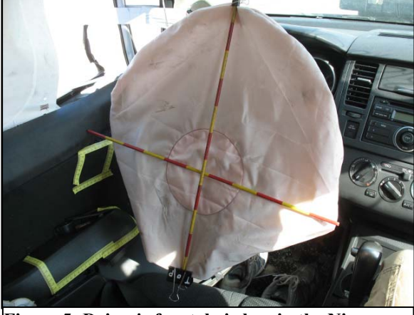
Figure 5: Driver's frontal air bag in the Nissan.