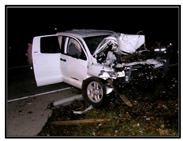
Figure 1 . 2007 Toyota Tundra

Photographs, a police report, and a variety of materials were forwarded to the National Highway Traffic Safety Administration (NHTSA) Office of Defects Investigation (ODI). ODI forwarded the