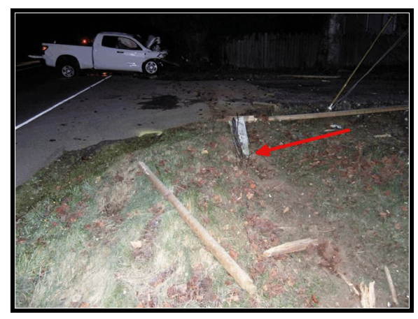
Figure 4 . Impact with phone/cable box (Event 2)

The police arrived on scene at 0209 hours. One of the officers gained access into the passenger compartment by breaking the driver's side window; the other gained access by breaking the passenger window. The officers observed the driver in the driver's seat. He was slumped over