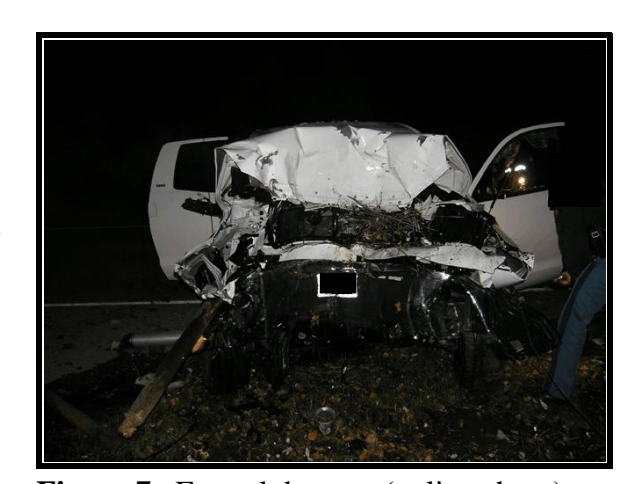
Figure 7 . Frontal damage

The Toyota sustained major front end damage from the impacts with the wooden fence posts, phone/cable box, and tree ( Figure 7 ). The damage from the fence posts and phone/cable box was masked by the damage from the tree. There was a wooden fence rail embedded into the front right of the vehicle under the headlight casing into the fender. The drive shaft was displaced from the vehicle and was laying on the ground to the right of the vehicle at final rest. The spare tire was displaced from the vehicle and came to rest on the north side of the roadway. Based on the final appearance of the damage the estimated Collision Deformation Classification (CDC) for all three impacts was 12FDEW5. Six crush measurements