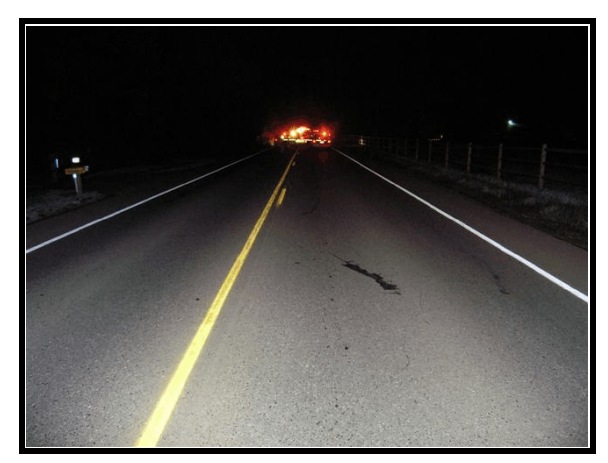
Figure 2 . Approach to area of roadway departure, eastbound view

This single-vehicle crash occurred in October