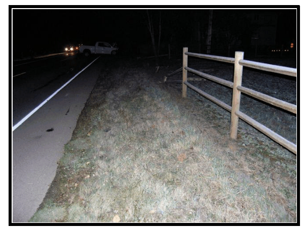
Figure 3 . Area of impact with fence (Event 1)

Based on the EDR-reported speed and roadway departure point, the Toyota traveled for 1.3 seconds off the road before impacting and