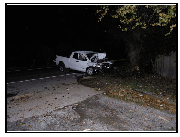
Figure 6 . Final rest (looking northeast)

the center console. He was unconscious, his breathing was labored, and he had an apparent serious head injury with heavy bleeding. Rescue personnel arrived just as the officer had gained access to