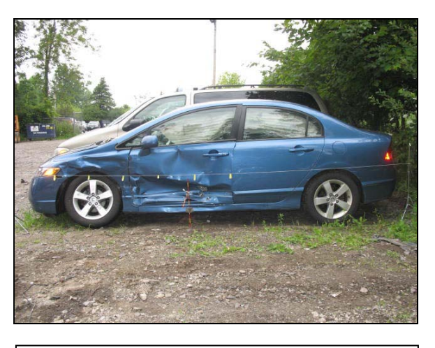
Figure 1: Left side view of the Honda Civic.

This investigation focused on the side impact inflatable occupant protection system in a 2007 Honda Civic 4-door sedan ( Figure 1 ). The Honda was equipped with side impact Inflatable Curtain (IC) air bags, front row seat-mounted side impact air bags, Certified Advanced 208-Compliant (CAC) frontal air bags and front row safety belt pretensioners. The crash occurred when the front plane of the Toyota impacted the left plane of the Honda, as the Honda was in the process of turning left at a 4-leg intersection. The direction of force was in the 11 o'clock sector for the Honda. During the crash sequence