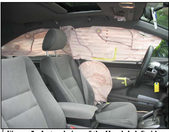
Figure 5: Lateral view of the Honda's left side interior.

Interior component damage was identified in three separate areas in the driver seat position ( Figure 5 ). Each damaged area exhibited characteristics of occupant contact. The first area of damage was located on the interior driver door panel. Multiple scuff marks were identified