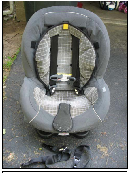
Figure 9: Front view of the Evenflo Triumph.

This CRS was designed with an internal 5-point harness system. There were three harness slots in the back of the shell. The harness was found to be routed through the top positioning slots. The lower base was designed with a 5-