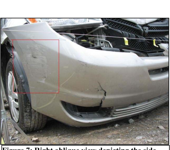
Figure 7: Right oblique view depicting the sideswipe damage from Event 2.

As the Toyota rotated CCW its right plane sustained direct contact damage (Figure 7) that started 47 cm (18.5 in) aft of the right front bumper corner and extended forward 19 cm (7.5 in) as a result of the secondary side-swipe type impact (Event 2). This damaged region consisted of linear abrasions to the right side of the plastic bumper fascia. Due to the overlapping induced possible damage, deformation from this event could not be identified. The CDC for this damage pattern was 05RFES1.