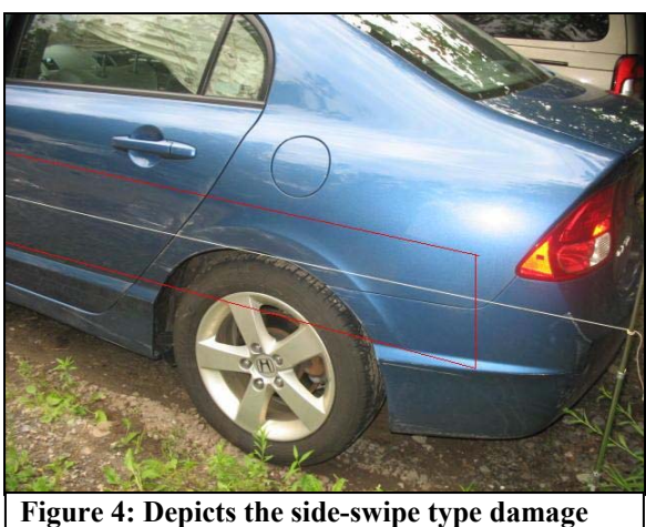
Figure 4: Depicts the side-swipe type damage from event 2

The Honda rotated CW as a result of the initial impact (event 1). The left side of the Honda then contacted the right side of the Toyota in a secondary side-swipe type impact (Event 2). The direct contact damage began 75 cm (38.2 in) aft of the left rear axle and extended 176 cm (50 in) forward. Direct contact damage ( Figure 4 ) consisting of longitudinal surface scratches without sheet metal deformation was noted to the left rear door, adjacent fender and quarter panel areas. The residual crush profile yielded 0 cm for lateral deformation at all six "C" measurement locations. The CDC for this damage pattern was 12LZES1.