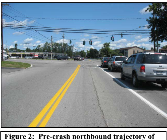
Figure 2: Pre-crash northbound trajectory of Honda.

The pre-crash roadway environments for both respective vehicles included a dedicated left turn lane but contained no shoulders that were boarded by a raised concrete curb. The posted speed limit was 64 km/h (40 mph) for all roadways. The east edge of the west curb was used as the reference line (RL) and a wooden utility pole, located 8.6 m (28.2 ft) west of the RL was used as the reference point (RP) during the SCI inspection. Figure 2 is a northbound view of the intersection which depicts the precrash trajectory of the Honda. A schematic of the crash is included at the end of this report as Figure 11 .