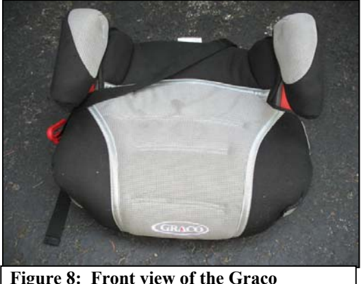
Figure 8: Front view of the Graco TurboBooster.

A backless booster CRS and a convertible CRS were installed in the Toyota at the time of the crash and were inspected at the Toyota driver's residence. The backless booster CRS ( Figure 8 ) was a Graco TurboBooster model number 8E17MQE. The date of manufacture was September 27, 2008. In the backless mode, the CRS was designed for use by a child with a 101 to 145 cm (40 to 57 in) height and an 18 to 45 kg (40 to 100 lb) weight. The manufacturer's label indicated that its use was for children approximately 4 to 10 years of age. The CRS was purchased new by the driver approximately 6 months prior to the crash.