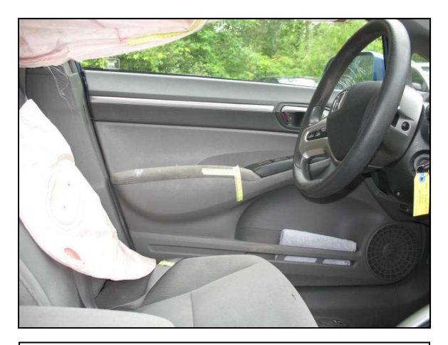
Figure 10: Right interior view of the contact evidence to Honda's armrest.

on the left side of the thoracic cage. Corresponding scuff marks were identified on the driver door armrest. The driver's right knee contacted the knee bolster, which bent and displaced this vehicle component without producing injury to the driver. After maximum engagement the driver rebounded into his seatback where he received a 10 cm (4 in) diameter contusion to the dermis covering his left scapula. No discernable contact points were identified to the front aspect of the driver seatback as a result of this driver reported injury. The driver came to final rest within his original seating position.