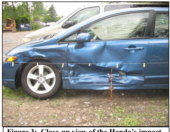
Figure 3: Close-up view of the Honda's impact damage.

The exterior of the Honda sustained two separate areas of direct contact damage during the vehicle-to-vehicle crash sequence. Figure 3 is a view of the damage to the forward aspect of the left plane (Event 1) of the Honda. The direct contact damage began 106 cm (41.7 in) forward of the left rear axle and extended 190 cm (74.8 in) forward. The impact resulted in a mostly lateral deformation to the left side front fender, door panel and sill areas. The Honda's left wheelbase was reduced by 5 cm (2.0 in) when