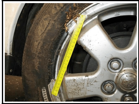
Figure 4. Rim fracture (Event 3)

For Event 2 the direct damage began 34.0 cm (13.4 in) aft of the front axle, extended forward 92.0 cm (36.2 in), and ended 58.0 cm (22.8 in) forward of the front axle. The Field L measurement was identical to the direct damage measurement. Six crush measurements were taken at mid-door level as follows: C_1 = 0 , C_2 = 1.0 cm (0.4 in), C_3 = 2.0 cm (0.8 in), C_4 = 3.0 cm (1.2 in), C_5 = 1.0 cm (0.4 in), C_6 = 0 . Maximum crush was located 18.0 cm (7.1 in) forward of the front axle between C_3 and C_4 and measured 4.0 cm (1.6 in). The CDC for Event 2 was 09LFMW1.