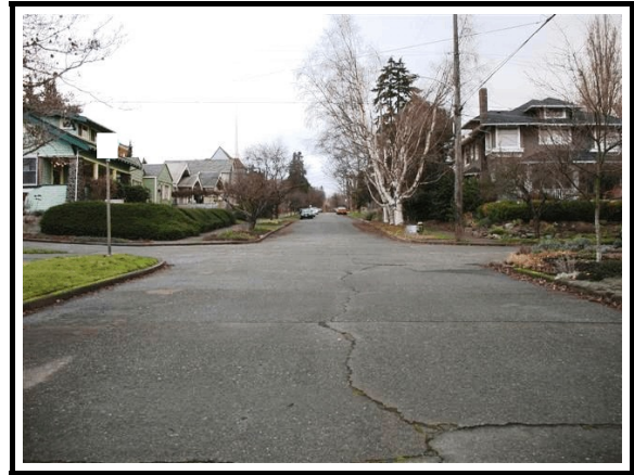
Figure 2. Crash site, northbound approach to intersection

2). It was raining intermittently and the concrete roadways were wet at the time of the crash. The north/south roadway was configured with two undivided lanes. The lanes were not delineated and the roadway measured 7.6 m (25.0 ft) in total width. Approaching the intersection, the northbound roadway was straight with a positive uphill profile. At 61.0 m (200.0 ft) south of the intersection the slope was 2.2 percent and 30.5 m (100.0 ft) the slope was 2.8 percent. At the estimated point of impact in the intersection the slope was 2.3 percent.