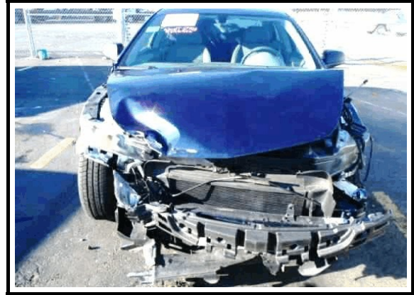
Figure 8. Other vehicle, 2008 Chevrolet Malibu LS (auction facility photo)

The Chevrolet sustained direct and induced damage to the frontal plane ( Figure 8 ), and induced damage to the top and side planes. The front bumper fascia was displaced and the grille and front fender panels were missing. Based on the photographs the damage to the front end was distributed from bumper corner to bumper corner encompassing the vehicle's undeformed end with of 148.0 cm (58.3 in). For Event 1, the estimated CDC for the Chevrolet was 01FDEW2. For Event 2, the estimated CDC was 10FL9999.