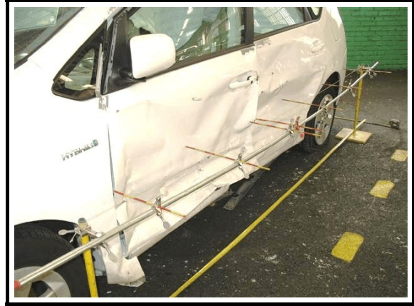
Figure 3. Left side crush profile

measurement was identical to the direct damage measurement. Six crush measurements were taken at mid-door level ( Figure 3 ) as follows: C_1 = 0 , C_2 = 1.0 cm (0.4 in), C_3 = 9.0 cm (3.5 in), C_4 = 11.0 cm (4.3 in), C_5 = 8.0 cm (3.1 in), C_6 = 0 . Maximum crush was located 118.0 cm (46.5 in) forward of the rear axle between C_3 and C_4 at the left B-pillar and measured 14.0 cm (5.5 in). The CDC for Event 1 was 10LZEW2.