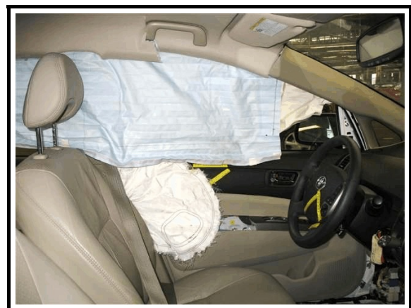
Figure 5. Deployed IC air bag and seat-mounted side air bag

The left seat-mounted side air bag deployed from the outboard aspect of the left seat-back. The air bag was oval in shape with a rectangular tab at the leading edge. It measured 34.0 cm (13.4 in) in