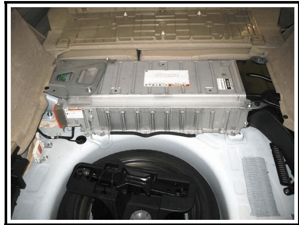
Figure 6. NiMH Propulsion battery pack encased in aluminum cover

The other vehicle was a 2008 Chevrolet Malibu LS identified by the VIN: 1G1ZG57B784xxxxxx. The vehicle was manufactured in May 2008. Standard equipment for this model included a 2.4-liter, 4-cylinder engine, automatic transmission, power steering, front wheel drive, 4-wheel anti-lock brakes, traction control, and daytime lights.