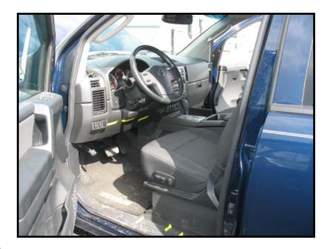
Figure 7: Left interior view.

The driver seat was located in a mid-track position 9 cm (3.5 in) forward of full-rear. The total seat track travel was 25 cm (10 in). The seat back was reclined 25 degrees aft of vertical. The horizontal distance from the seat back to the driver air bag module measured 61 cm (24 in). There was no deformation to the three-spoke steering wheel rim. There was no shear capsule separation. Three minor occupant contact points to the left knee bolster were identified. A 3 cm