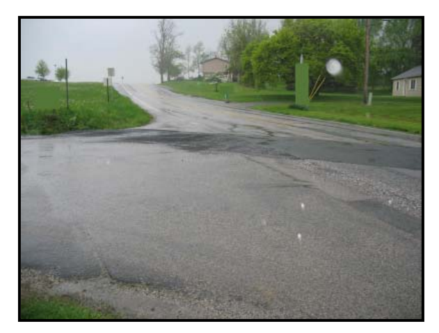
Figure 3: Southward view from the intersection; the perspective of the Chrysler to northbound traffic.