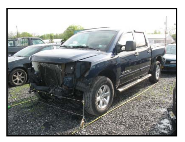
Figure 1: Front right view of the Nissan.

This on-site investigation focused on the crash dynamics, crash severity, injury and injury sources surrounding the intersection crash of a 2008 Nissan Titan pickup truck and a 2002 Chrysler Voyager. The Nissan was equipped with a Certified Advanced 208-Compliant (CAC) frontal air bag system that did not deploy as a result of the crash. The CAC system in the Nissan was comprised of advanced dual-stage frontal air bags, a seat track position sensor, front safety belt buckle switches, front safety belt pretensioners, and a front right occupant detection sensor. The frontal air bags in the Nissan were certified by the manufacturer to be