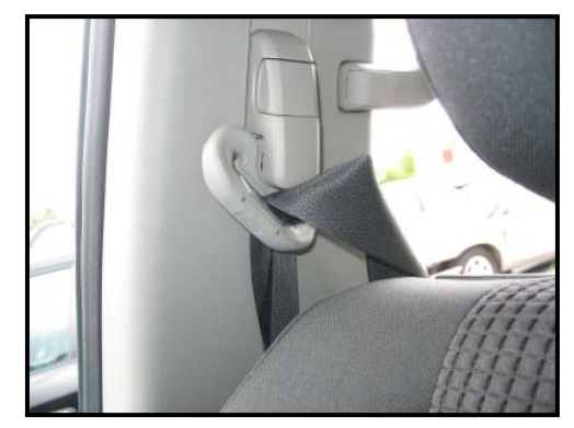
Figure 8: Front right D-ring and gathered webbing.

The front right passenger's restraint consisted of a continuous loop webbing, sliding latch plate, a switchable Automatic Locking Retractor/ELR (ALR/ELR) and an adjustable D-ring. This restraint was not buckled (not in use) at the time of the crash. The front right retractor pretensioner actuated during the crash with the webbing in the stowed position. The webbing was gathered in the D-ring and the retractor was not operational. The webbing on the back side of the D-ring was abraded from contact with the D-ring surface as the pretensioner actuated. The diagnostic routine of the vehicle's Air bag Control Module (ACM) stored a Diagnostic Trouble Code (DTC) that confirmed