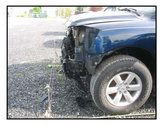
Figure 5: Left lateral view at the front plane.