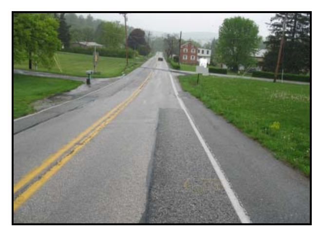
Figure 2: Northbound trajectory view of the Nissan.