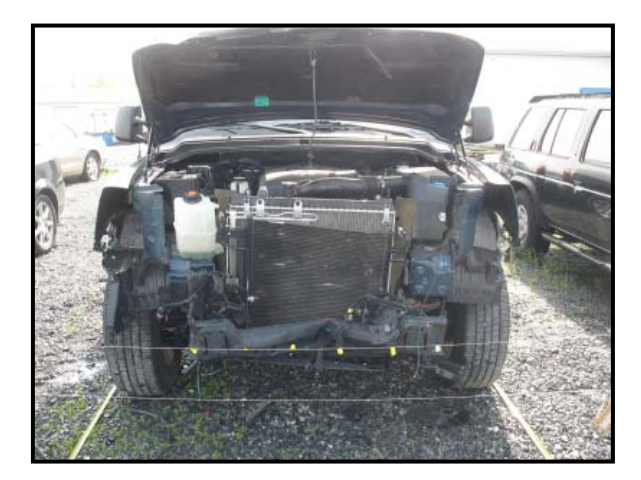
Figure 4: Frontal view of the damaged Nissan.

The Nissan Titan sustained damage across the full frontal plane as a result of the impact ( Figures 4 and 5 ). At the time of the SCI inspection, the Nissan had been partially disassembled to facilitate an insurance damage estimate. The damaged components included: the front bumper, bumper reinforcement, the head lamp assemblies, the center grille, the upper radiator support, radiator, condenser and associated components. These components had been discarded prior the SCI inspection. The left fender was shifted rearward. The residual crush measured along the bumper reinforcement bar was as follows: C1 = 5 cm (2 in), C2 = 15 cm (5.9 in), C3 = 24 cm (9.4 in), C4 = 19 cm (7.5 in), C5 = 15 cm (5.9 in), C6 = 8 cm (3.1 in). The maximum residual crush was located 9 cm (3.7 in) left of center and measured 24 cm (9.4 in). The dynamic crush of the frontal components resulted in contact between the back side of the radiator and the cooling fan. This contact was evidenced by damage to the radiators fins and a fractured fan blade. There was no change in the wheelbase dimensions. All the doors remained closed during the crash and were operational at the time of the SCI inspection. There was no damage to the windshield and all the window glazing was intact.