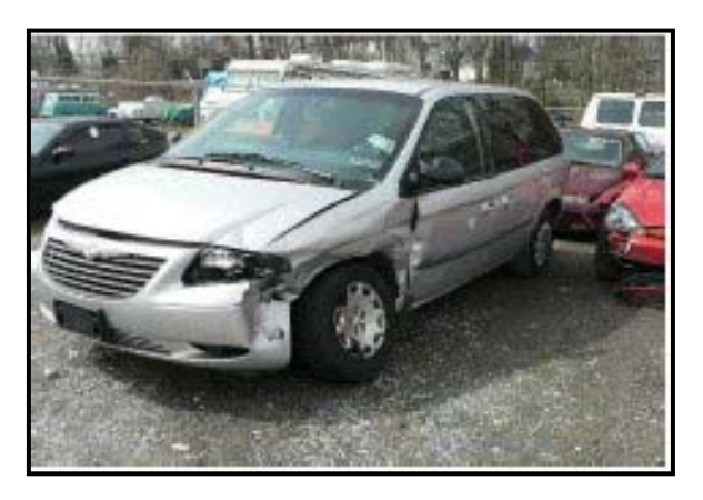
Figure 6: Left front oblique view of the Chrysler.

Insurance carrier photographs of the Chrysler were obtained and used to assess the damage to the Chrysler. Figure 6 is a left front view of the Chrysler. The direct contact damage to the Chrysler began at the left corner and extended an estimated 127 cm (50 in) along the left side plane to the forward aspect of the left front door. The lateral crush at the left corner was an estimated 38 cm (15 in). The force of the impact deformed the left front suspension inboard and damaged the wheel assembly. The redesigned frontal air bags in the Voyager deployed. The estimated CDC was 10-LYAW3.