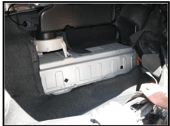
Figure 7. Traction battery

The battery system was a 244-volt Nickel Metal-Hydride (NiMH) battery that was mounted in the rear cargo floor, aft of the second row seat ( Figure 7 ). This high-voltage (HV) battery system was mounted laterally in the vehicle and was concealed and protected by an aluminum cover that was bolted to the rear floor of the vehicle. An air intake vent was located on the right side of rear deck for the purpose of cooling the traction battery. Orange colored power cables carry high voltage direct current between the HV battery pack and the inverter/converter. The cables extended along the center of the vehicle, under the vehicle floor pan, from the cargo area to the engine compartment.