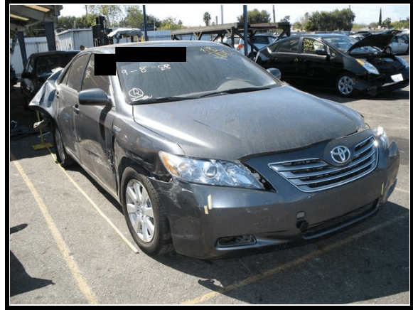
Figure 5. Front right damage (Impact 3)

The third impact was between the front of the Toyota and the left side of the Saab ( Figure 5 ). The direct damage began at the right front bumper corner and extended 3 cm (1.2 in) to the left and 246 cm (96.8 in) longitudinally down the right side. The CDC for the third event was 12FRES9.