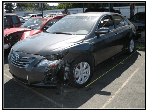
Figure 3. Left front damage (Impact 1)

The Toyota sustained damage to the front, right, and rear planes. There were five impacts documented. The first was a frontal impact between the Toyota and the right side of the Ford ( Figure 3 ). The direct damage began 35 cm (13.7 in) left of the centerline and extended 46 cm (18.1 in) to the left front bumper corner. The plastic fascia at the left bumper corner was broken away. The damage extended 119 cm (46.8 in) longitudinally along the left fender and vertically onto the left side of the hood. The damage height was 91 cm (35.8 in) above the ground. The Collision Deformation Classification (CDC) for the first event was 12FLEW1.