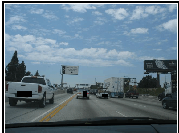
Figure 2. Westbound approach

The crash occurred in September 2008 in the westbound lanes of a 6-lane divided state highway ( Figure 2 ). The roadway was bordered on the left by a concrete median barrier. The sixth lane from the right was a High Occupancy Vehicle (HOV) lane that was bordered on the right by two solid double yellow lines. The remaining lanes were separated by dashed white lines and raised pavement markers. The straight asphalt roadway was dry and the weather was clear. The posted