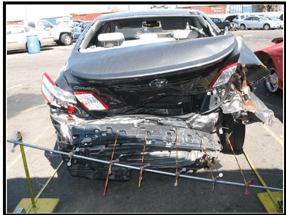
Figure 4. Rear damage (Impact 2)

The second impact was between the rear of the Toyota and the front of the BMW ( Figure 4 ). The direct damage began 11 cm (4.3 in) left of the centerline and extended 80 cm (31.5 in) to the right rear bumper corner. The right rear tire was damaged and restricted during this impact. There was a 36 cm (14.2 in) tear in the sidewall located 5 cm (1.9 in) from the bead, a 20 cm (7.9 in) tear at the area of restriction, and a 53 cm (20.9 in) tear to the inner sidewall. Six crush measurements were documented along the bumper as follows: C1 = 0 cm, C2 = 7 cm (2.8 in), C3 = 24 cm (9.4 in), C4 = 37 cm (14.6 in), C5 = 43 cm (16.9 in), C6 = 45 cm (17.7 in). The maximum crush was located at C6 and the CDC for the second event was 06BZEW4.