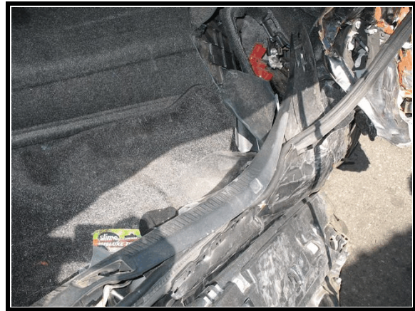
Figure 6. Trunk and service battery damage

There was damage to the cargo area aft of the rear seat and the traction battery ( Figure 6 ). The rear portion of the cargo area was deformed forward. The longitudinal distance from the traction battery to the rear portion of the cargo area measured 44 cm (17.3 in) on the left and 26 cm (10.2 in) on the right. Since the left was largely undamaged, the depth of crush was 18 cm (7.0 in). The vehicle's lead-acid service battery was located in the right rear of the cargo compartment. It was fractured during the crash and the battery had leaked the acid/water solution.