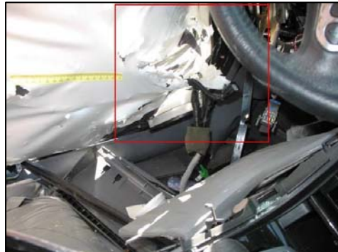
Figure 9: Depicts the speaker and metal speaker housing located in the forward lower door quadrant

The left front door panel and adjacent B-pillar intruded against the left aspect of the front left seatback and the driver's left flank. He sustained multiple left side injuries including a non-displaced left sacral ala fracture and a left acetabular hip fracture. The driver also sustained a left tibia fracture of the proximal shaft, a non-displaced and comminuted left fibula neck fracture and a contusion over the left tibia and fibula area, associated to the forward lower quadrant of the left front door that housed a 17 cm (6.5 in) diameter speaker and metal speaker housing, identified within the red bordered areas of Figure 9 . The driver's right lower leg contacted the knee bolster causing a contusion over the right tibia and fibula area without producing any contact point evidence.