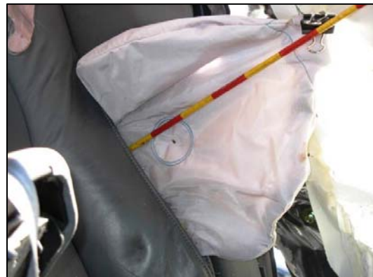
Figure 6: Depicts the inboard aspect of the deployed seat-mounted side impact air bag.

The Acura was equipped with a side impact air bag system that consisted of front seatback-mounted side impact air bags and roof side rail-mounted IC air bags. The left seatback-mounted air bag and the left IC air bag deployed in this side impact crash. The seatback air bag deployed from the forward stitch seam of the seat back that measured 22 cm (8.7 in) in height. The deployed air bag, in its deflated state, measured 30 cm x 25 cm (12 in x 9.75 in) height x width. The air bag was vented by a 1 cm (.25 in) vent port located