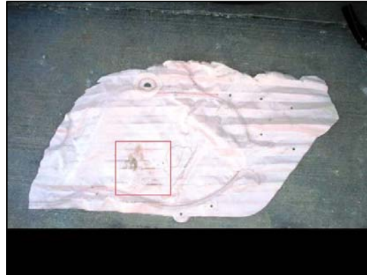
Figure 8: Depicts the on-scene cut and removed section of the front row portion of the left IC air bag.

The IC air bags were mounted within both roof side rails. The IC air bag system provided coverage for the outer seating positions of both rows. The left side IC air bag deployed as a result of the impact with the Ford. The IC measured 132 cm x 41 cm (52 in x 16 in) length x height in overall dimensions and provided coverage from the upper aspect of the A-pillar to the C-pillar area. A section from the forward most aspect of this air bag ( Figure 8 ), measuring 57 cm x 35 cm (22.5 in x 13.75 in) length x height, was cut from the vehicle during the extrication of the driver. This section was realigned with the IC air bag's core section ( Figure 9 ). A 30 cm (12 in) void in coverage was measured between the beltline region of the A-pillar and the forward edge of the IC. The deployed IC did not contain a sail panel or tethers within its construction. The vertical coverage of the IC extended 13 cm (5 in) below the beltline for both seating rows. Frictional abrasions and body fluids are highlighted within the red bordered areas of Figure 8 and 9 , were recognized on the inboard surface of this air bag 28 cm (11 in) longitudinally rearward of the lower front corner and 12 cm (4.7 in) above the bottom edge of the curtain.