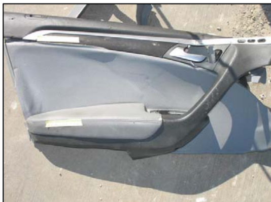
Figure 4: Depicts occupant contact damage to the left front door panel and armrest.