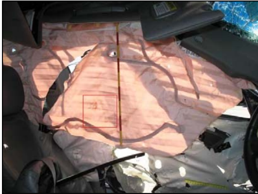
Figure 7: Depicts the front row aspect of the left IC airbag after the removed section was reattached.

6 cm (2.4 in) forward of the tear seam on the inboard aspect of the air bag. There was no occupant contact evidence or damage to the deployed seatback air bag. Figure 7 is a view of the deployed air bag.