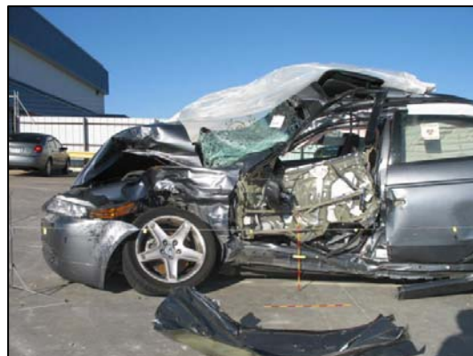
Figure 3: View of the Acura's left side impact damage.

The combined induced and direct contact damage began at the left C-pillar and extended 323 cm (127.25 in) forward to the front