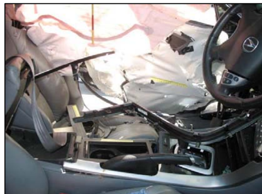
Figure 5: Depicts occupant contact damage to the center console.