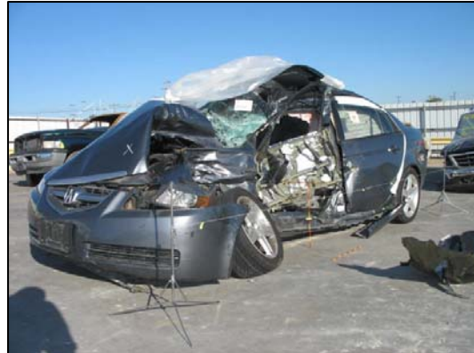
Figure 1: Left front oblique view of the Acura TL.

This investigation focused on the inflatable side impact protection system that deployed in a 2005 Acura TL 4-door sedan ( Figure 1 ) during its intersection crash with a 2003 Ford F250 pickup truck. The Acura was equipped with side impact Inflatable Curtain (IC) air bags, front row seatback-mounted side impact air bags, Certified Advanced 208-Compliant (CAC) frontal air bags and front row safety belt pretensioners. The manufacturer of this vehicle has certified that the Acura is compliant to the advanced air