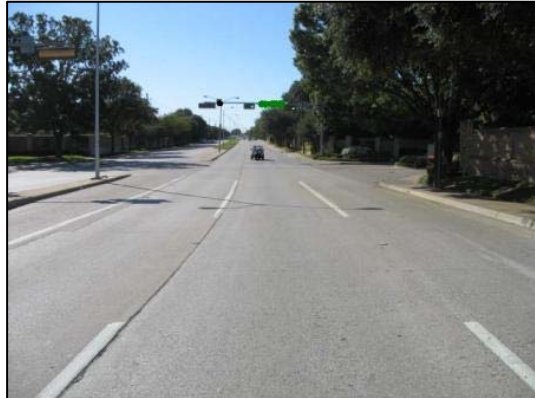
Figure 2: Overall view of the intersection in the westbound direction of travel.

This crash occurred during the daylight hours at a controlled 4-leg intersection during clear and dry conditions. The Acura was exiting a residential community from a divided four-lane north/south residential street onto a seven-lane divided east/west roadway. The seven-lane roadway consisted of three lanes in each direction with opposing designated left turn lanes. The Ford was exiting a left curve onto a straight segment of road prior to the intersection. Both roadways were boarded by a concrete curbs. The posted speed limit was 64 km/h (40 mph) for the east/west roadway and 48 km/h (30 mph) for the north/south intersecting street. Figure 2 is a westbound view of the intersection which depicts the pre-crash trajectory of the Ford. A schematic of the crash is included at the end of this report as Figure 11 .