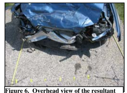
rigure 6. Overnead view of the resultant crush to the Subaru.

All four doors remained closed during the crash. Post-crash, the left front and right side doors were jammed shut and the left rear door remained operational. The windshield was fractured and the left and right front door glazing was disintegrated. The remaining side, rear, and roof glazing were intact.