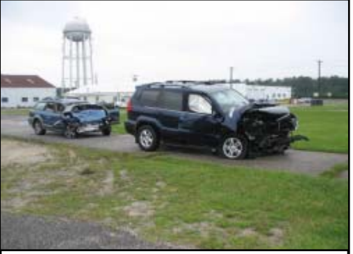
Figure 2. Overall view of the Subaru and the Lexus.

The interior of the Lexus was configured for eight-passenger seating. The first row consisted of bucket seats with height adjustable head restraints that were adjusted to the full-down positions. Mounted to the rear aspects of the front head restraints were DVD monitors. The second row seating was a 60/40 split bench with height adjustable head restraints for all three positions. These head restraints were adjusted to the full-down position. The Lexus was also equipped with a third row designed for use of up to three passengers. The seat type was a split bench 60/40 left side wide. These seats could