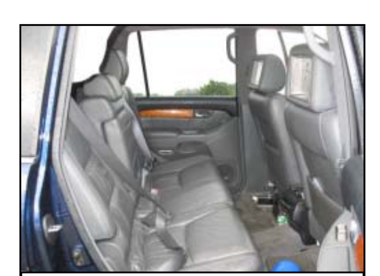
Figure 11. Overall view of the second row of the Lexus.