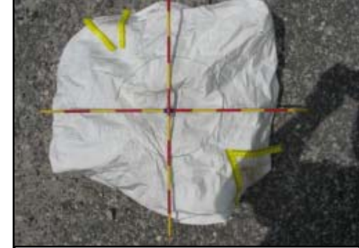
Figure 12. Body fluid transfers on the driver's air bag membrane.

The driver's air bag was concealed within the center hub of the three-spoke steering wheel by asymmetrical cover flaps. The top flap was 12 cm (4.7") in width at the horizontal tear seam and 9 cm (3.5") in height. The two lower flaps were 7 cm (2.8") in width and height. The air bag membrane was 59 cm (23.2") in diameter in its deflated state and was tethered internally by two straps at the 11 and 1 o'clock positions. The air bag was vented by two ports. The maximum excursion of the air bag (deflated) was 26 cm (10.2").