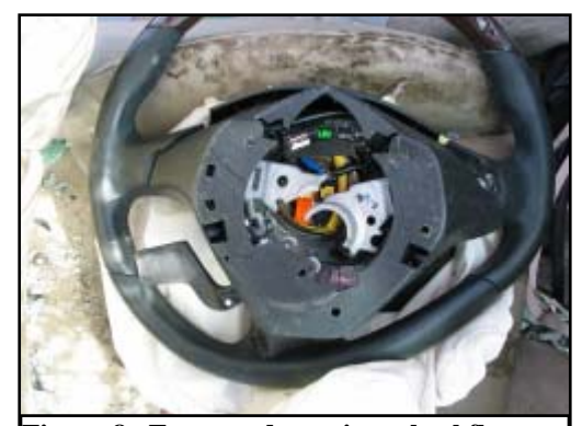
Figure 8. Fractured steering wheel flange.

The passenger compartment intrusions are listed in the table below: