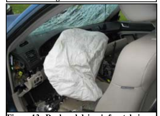
Figure 13. Deployed driver's frontal air bag.

cuts and body fluid transfers. The largest area of body fluid was located on the rear panel at the 6 o'clock position and measured 31 x 22 cm (12.2 x 8.7"), height x width. Dirt was also present within this body fluid transfer. A second area of body fluid was located at the 11 o'clock sector and measured 12 cm (4.7") in height and 8 cm (3.2") in width. Body fluid was noted at the 5 o'clock position. This transfer measured 10 cm (3.9") in height and 11 cm (4.3") in width. Numerous small cuts that were approximately 0.8 cm (0.3") in size were present on the face of the membrane. These small cuts appeared to have occurred from shattered glass. Two larger cuts were noted on the membrane at the 12 and 1 o'clock positions. These cuts measured 3 cm (1.2") and 4 cm (1.6"), respectively. A 2 cm (0.8") cut was noted along the sewn perimeter seam at the 5 o'clock sector. Figure 12 depicts the body fluid transfers and Figure 13 shows the deployed air bag.