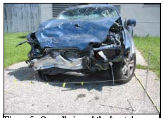
Figure 5. Overall view of the frontal damage to the Subaru.

The 2007 Subaru sustained severe frontal damage as a result of the impact with the Lexus ( Figures 5 and 6 ). The damaged components included but were not limited to the bumper fascia, bumper beam, hood, fenders, right front door, and the front wheels and suspension components. Additionally, the left and right wheelbases were reduced 7 cm (2.8") and 32 cm (12.6"), respectively. The impact was slightly off-set to the right; therefore, the maximum damage occurred to the right aspect of the frontal plane. The direct contact damage measured 140 cm (55") and extended from the left bumper corner to the right bumper corner. The maximum crush measured 85 cm (33.5") and was located 41 cm (16") inboard of the right bumper beam corner. A crush profile was documented along the 102 cm (40.2") bumper beam and was as follows: C1 = 51 cm (20"), C2 = 62 cm (24.4"), C3 = 68 cm (26.7"), C4 = 85 cm (33.5"), C5 = 84 cm (33"), C6 = 75 cm (29.5"). The Collision Deformation Classification (CDC) for this impact was 12-FDEW-4.