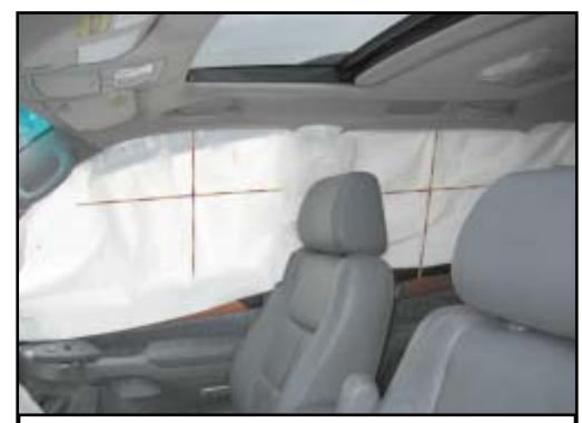
Figure 15. Deployed right curtain air bag.

Vertically, the curtain air bag extended below the beltline at the first and second rows. At the third row, the curtain air bag did not span the complete vertical and longitudinal area of the third row glazing. A triangular shaped void was present at the third row glazing area ( Figure 16 ). This void measured 37 cm (14.6") in height and 48 cm (18.9") in width. The curtain air bag was free of occupant contact points and damage.