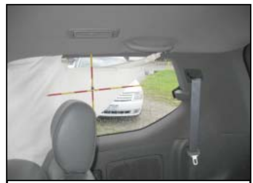
Figure 16. Right curtain air bag at the third row position.