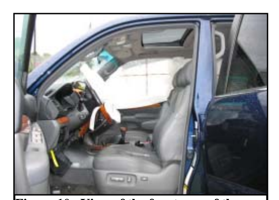
Figure 10. View of the front row of the Lexus.

The interior of the Lexus sustained moderate severity damage from a combination of passenger compartment intrusion and occupant contact points. The occupant contact points consisted of deformation to the left knee bolster by the driver's knees, fractured windshield from contact with the driver's right hand, displaced rearview mirror by the driver's right hand, and compression of the steering column. The steering column compression resulted in approximately 1 cm (0.4") of sheer capsule displacement. Occupant contact points from the rear passengers were not evident. Figures 10 and 11 are overall views of the first and second rows. Safety belt loading evidence was present on the belt webbings for the three occupied positions. This loading is discussed the Manual Restraints section of this report.