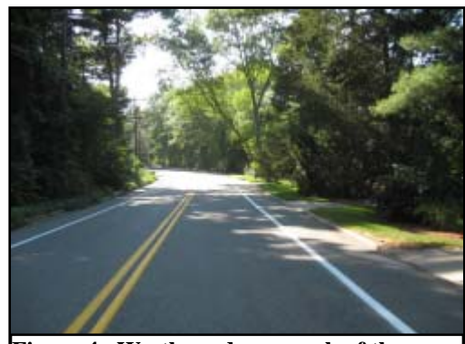
Figure 4. Westbound approach of the Lexus.