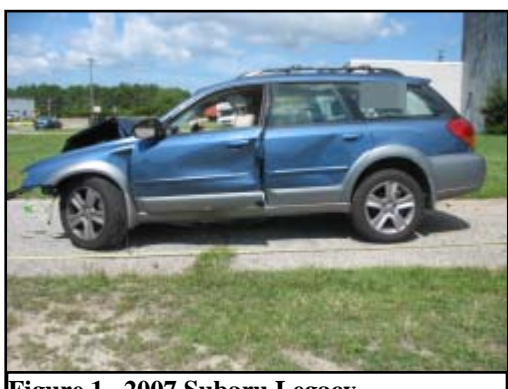
Figure 1. 2007 Subaru Legacy.

This on-site investigation focused on the Certified Advanced 208-Compliant (CAC) safety system in 2007 Subaru Legacy (Figure 1) and the resultant injuries to an unrestrained 55-year-old female driver. The manufacturer of this vehicle has certified that the Legacy is compliant to the Advanced Air Bag portion of Federal Motor Vehicle Safety Standard No. 208. The Subaru's CAC system consisted of dual stage frontal air bags, seat track position sensors, safety belt buckle switch sensors, retractor mounted safety belt pretensioners for