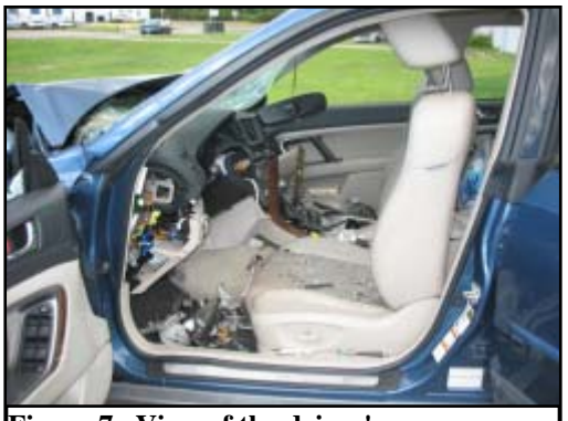
Figure 7. View of the driver's area.

The interior of the Subaru sustained severe damage due to a combination of passenger compartment intrusion and driver contact. Figure 7 is a view of the driver's area. The driver's contact points consisted of loading of the steering wheel, knee bolster, windshield, and sun visor. During this loading, the steering wheel flange fractured (Figure 8) separating the steering wheel from the column. The steering rim was displaced forward resulting in a 1 cm (0.4") gap at the 3 and 9 o'clock spokes and 3 cm (1.2") at the 6 o'clock spoke. Additionally, the steering wheel rim was deformed upward 4 cm (1.6") at the 7 o'clock location. There was 2 cm (0.8") of compression to the left and right sheer capsules. The knee bolster exhibited deformation from contact with both of the driver's knees. The left contact occurred to the left end of the knee bolster on the fuse box access door. The right knee contact was located on the right end of the bolster at the junction with the center console. A contact point was noted to the windshield forward and below the steering wheel rim. This contact was attributed to the driver's right hand and was evidenced by the fractured glass and tissue transfers. The driver's head contacted the sun visor which resulted fractured the mirror mounted within the sun visor. Also noted was that the rear view mirror was displaced from its windshield mount and the glass was fractured. This contact was attributed to the driver's right hand.