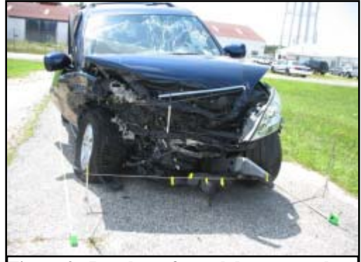
Figure 9. Resultant frontal damage to the Lexus.

The 2006 Lexus GX 470 sustained severe damage to the front and right planes as a result of the impact with the Subaru ( Figure 9 ). The damage consisted of longitudinal crush to the frontal plane. The direct contact damage from this off-set right impact began 24 cm (9.5") left of the centerline and extended 76 cm (29.9") to the right bumper corner. The maximum crush occurred at the right corner of the bumper beam and measured 72 cm (28.3"). A crush profile was documented along the bumper beam which was as follows: C1 = 0 cm, C2 = 0 cm, C3 = 59 cm (23.2"), C4 = 59 cm (23.2"), C5 = 56 cm