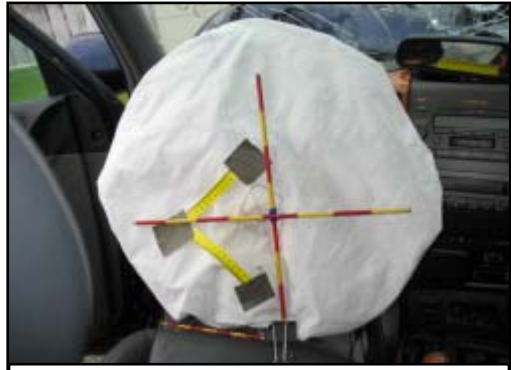
Figure 14. Driver's frontal air bag.

During the frontal crash, the driver's frontal air bag deployed ( Figure 14 ). The driver's air bag was conventionally mounted in the center hub of the four-spoke steering wheel. The air bag module contained two symmetrical cover flaps that measured 8 cm (3.2") in height and 13 cm (5.1") in width. The air bag membrane was 57 cm (22.4") in diameter in its deflated state and was tethered internally by two straps. The air bag was vented by two ports located at the 11 and 1 o'clock positions. The maximum excursion of the air bag was 33 cm (13").