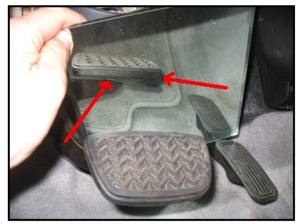
Figure 7: Displaced brake pedal pad.

An OEM carpeted floor mat was installed in the left position and clipped into place. On top of the carpeted mat, an OEM rubber all-weather mat was also in use. It should be noted that this mat, an additional rubber mat for the front right position and a mat for the rear right position were found within the bed of the pickup. Refer to Figure 8 . The OEM rubber mat was contoured to fit within the left floor pan ( Figure 9 ) and was flexible. There were cut-outs on the forward left and forward right sides of the mat for the dead pedal and accelerator, respectively. There were no abrasions or damage to the floor mat. It was not possible to bunch-up the mat and