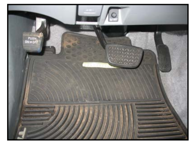
Figure 10: Rubber Mat displaced to its most forward position.