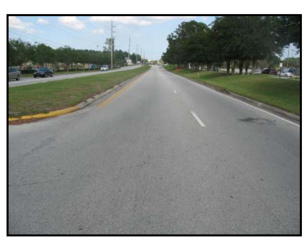
Figure 2: Eastbound trajectory view at the crash site.

This single vehicle rollover crash occurred during the daylight hours in December 2007. At the time of the crash, the weather was clear. The asphalt road surface was dry. The crash occurred on a divided two-lane, straight, level, east/west roadway in a commercial setting. The east/west traffic flow was separated by a 6.6 m (21.7 ft) raised grass median. The median was bordered by a 0.5 m (1.7 ft) wide concrete gutter and 10 cm (4 in) curb. There was a three-leg intersection immediately west of the median that was controlled by overhead traffic signals. The intersection was the entrance/exit into/out of the parking lot of commercial businesses located on