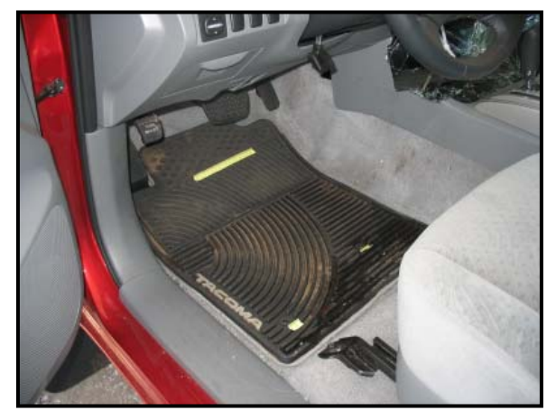
Figure 9: Interior view with the OEM rubber floor mat in place.

clear of the accelerator. The mat could not be shifted laterally due to the vertical side wall of the console. There was a warning molded into the mat stating: "Do Not Place On Top Of Existing Floor Mats". Figure 11 is a close-up view of the forward right corner of the mat and the molded warning.