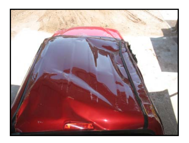
Figure 4: Top view of the Tacoma.

The maximum lateral deformation was located at the right A-pillar and measured 4 cm (1.5 in). The maximum vertical deformation was located within the right B-pillar roof area, 16 cm (6.2 in) inboard of the right roof rail and 24 cm (9.5 in) forward of the right B-pillar. The maximum deformation measured 11 cm (4.3 in). The Collision Deformation Classification (CDC) was 00-TPDO3