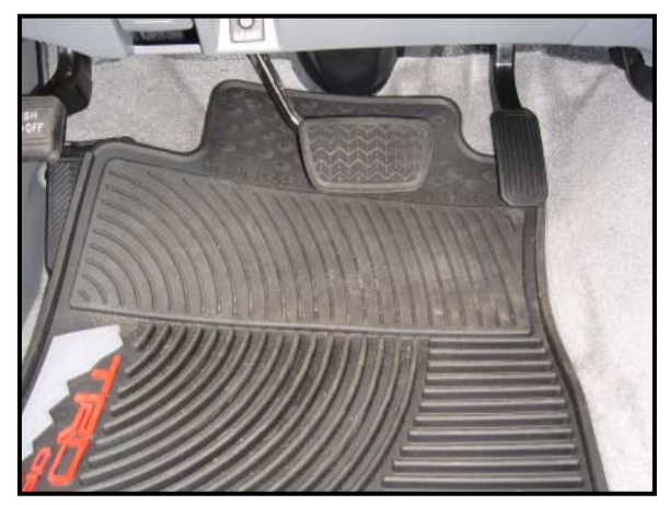
Figure 12: View of the displaced floor mat obtained from ODI.

The Office of Defects Investigation (ODI) of the NHTSA has identified a condition where an unsecured OEM rubber all-weather floor mat may become displaced forward and entrap the accelerator in an open position. Although this condition could not be replicated during the SCI inspection of the Florida Toyota Tacoma, exemplar vehicle testing has shown the possibility does exist that the accelerator may become entrapped by the raised molding of the displaced mat. Figures 12 and 13 are interior views of a Toyota Tacoma obtained from ODI that depict the displaced mat and accelerator pedal entrapment.