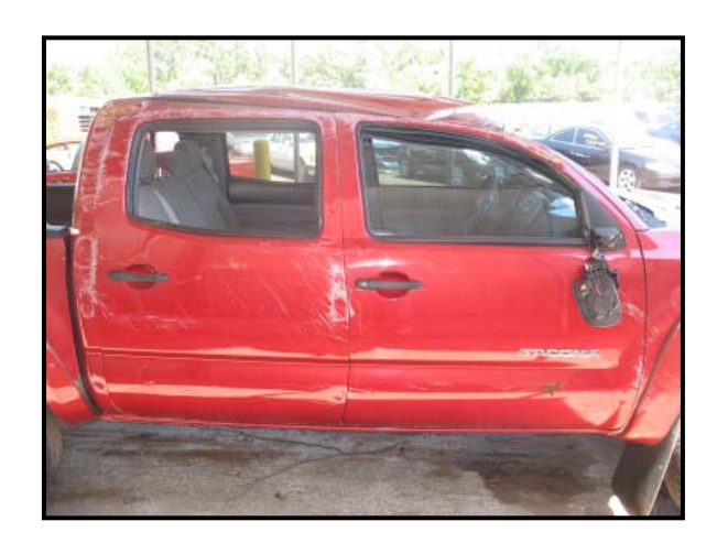
Figure 3: Right side view.

Figures 3 through 5 are exterior views of the Toyota Tacoma. The Tacoma sustained damage to the right, top and left planes consistent with a right side leading five-quarter turn rollover event. The right side plane exhibited body panel abrasions that were oriented in two different directions indicative of ground contact at two different points in time. The top and left planes exhibited body panel abrasions that were oriented in a single direction. The exterior mirrors on both side planes fractured and separated from their respective doors. There was