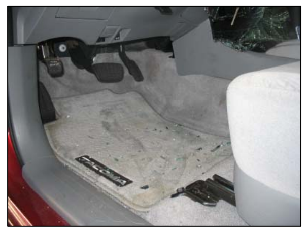
Figure 6: Interior view with the OEM carpet mat.

Figure 6 is an interior view of the driver position as it was first observed. The foot controls were not damaged and operated properly. The accelerator did not bind; its return spring was strong. It was observed that the rubber pad covering the steel brake pedal was partially displaced. Refer to Figure 7 . Normally, the pad was attached to the steel pedal by inserting the four edges of the pedal under molded flaps on the back side of the rubber pad. At the time of the SCI inspection, the pad was only attached to the pedal by the lower outboard corner. This implied to this investigator that the driver's foot may have been trapped and/or captured under the pedal and as the driver attempted to free his foot, the pad became dislodged. It was possible that his foot becoming trapped may have been associated with the loss of control. The brake pedal was firm when depressed and the system held pressure.