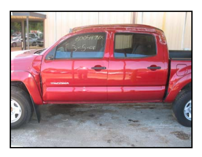
Figure 5: Left side view of the Toyota.