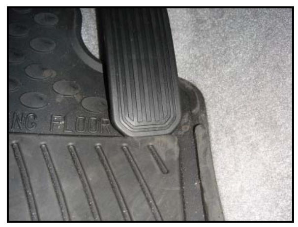
Figure 13: Close-up view of the entrapped accelerator pedal in Figure 12.

A 2007 Toyota Four-Runner, equipped with both the OEM carpet floor mat and OEM all-weather rubber floor mat, was used for the exemplar vehicle testing due to its availability. The configuration and layout of the cab and foot controls were identical to the Toyota Tacoma. The unsecured OEM rubber mat was displaced forward and inboard underneath the accelerator pedal. In this displaced position, it was possible to catch the lower edge of the depressed accelerator