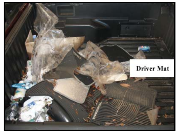
Figure 8: Mats found in the open truck bed.

An OEM carpeted floor mat was installed in the left position and clipped into place. On top of the carpeted mat, an OEM rubber all-weather mat was also in use. It should be noted that this mat, an additional rubber mat for the front right position and a mat for the rear right position were found within the bed of the pickup. Refer to Figure 8 . The OEM rubber mat was contoured to fit within the left floor pan ( Figure 9 ) and was flexible. There were cut-outs on the forward left and forward right sides of the mat for the dead pedal and accelerator, respectively. There were no abrasions or damage to the floor mat. It was not possible to bunch-up the mat and