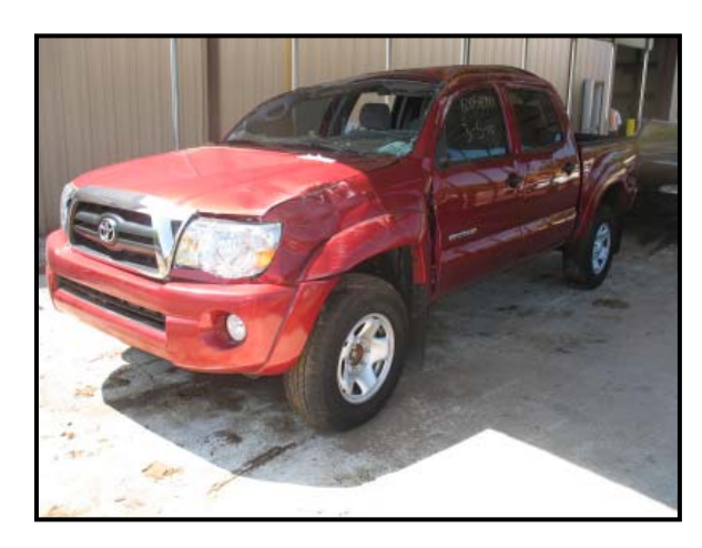
Figure 1: Left front oblique view of the Toyota.

This investigation focused on the alleged sudden acceleration and the crash dynamics surrounding the single vehicle rollover crash of a 2007 Toyota Tacoma pick-up truck (Figure 1). The 35 year old driver reportedly lost control of the vehicle due to the alleged sudden acceleration during a left turning maneuver. During the course of the acceleration, the vehicle lost traction and began yawing counterclockwise as it departed the eastbound lanes. The Toyota crossed the center median. entered the westbound lanes, and tripped into a right side leading five-quarter turn rollover. The vehicle tripped as a result of its transition from grass back