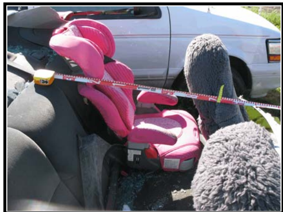
Figure 16. Second row left passenger's seat position.

The 3-year-old female child was seated in a belt positioning booster seat that had been placed in the second row left seat position ( Figure 17 ). The child was restrained by the vehicle's lap and shoulder belt. The belt had been routed through the upper left belt guide and across the lower seat guides and the retractor was in the ELR mode. At impact with the Dodge, the second row left passenger was displaced forward and to the left in response to the 11 o'clock direction of force. There was evidence of loading to the seat belt webbing and the belt guides. This passenger sustained abrasions to her upper left shoulder, chest, and abdomen. She was transported from the scene by ambulance to a local hospital.