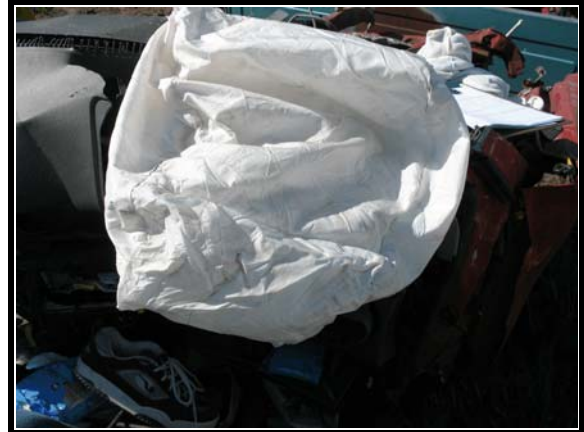
Figure 10. Front right passenger's air bag.

There were loading marks located at the left shoulder belt guide ( Figure 12 ) and along the right lap guide ( Figure 13 ). There were corresponding marks located on the vehicle seat belt webbing. There was some shifting of the plastic along the base on the right side from seat belt loading.