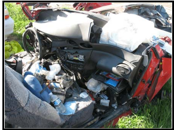
Figure 15. Front right passenger's seated position.

The 39-year-old male front right occupant was seated in the bucket seat in an unknown posture and was restrained by the manual lap and shoulder belt ( Figure 15 ). The seat was adjusted to the mid-track position. At impact with the Dodge, the front right passenger's frontal air bag deployed as he was displaced forward and to the left in response to the 11 o'clock direction of force. He likely loaded the passenger air bag. He loaded the lap and shoulder belt, causing the flail chest, chest abrasions, and the abdominal abrasion. There were knee contacts to the center and right instrument panel. His left knee engaged the instrument panel causing an indirect left hip fracture. His right foot was on the floorboard and probably engaged the toe pan, causing the fracture. This passenger survived the crash for a short period of time. Volunteer first-responders were performing cardiopulmonary resuscitation (CPR) on this passenger when the police arrived. This effort was discontinued shortly after the arrival of the police and the front right passenger was pronounced dead at the scene.