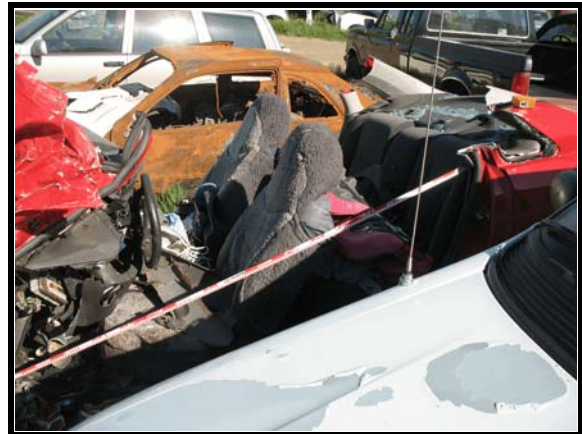
Figure 14. Driver's seated position.

The 38-year-old female driver was seated in an unknown posture in the bucket seat and was restrained by her lap and shoulder belt ( Figure 14 ). The seat was adjusted to the mid-track position. It was not known if the driver was able to execute any evasive maneuvers. At impact with the Dodge, the driver's frontal air bag deployed as the driver was displaced forward and to the left in response to the 11 o'clock direction of force. The driver's face loaded the air bag and both knees loaded the lower instrument panel/knee bolster, causing the left femur fracture and the right knee fracture. Skin transfers were located on the knee bolster. The driver's right foot and ankle contacted the toe pan area and sustained open fractures. The driver's torso loaded and fractured the steering wheel. The driver was displaced to the right and engaged the center console with her right hip. She sustained C1 or C2 neck fractures as a result of the impact force and lacerations/abrasions to both arms from an unknown source. The driver was found in her vehicle without a pulse and was pronounced dead at the scene.