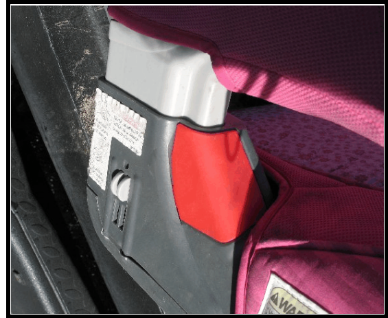
Figure 13. Loading marks to lower belt guide.