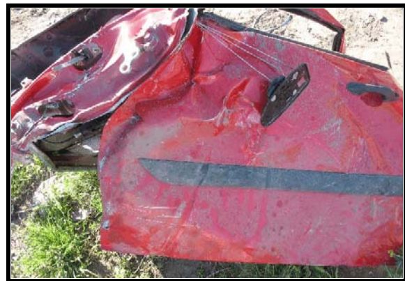
Figure 5. Damage to driver's door