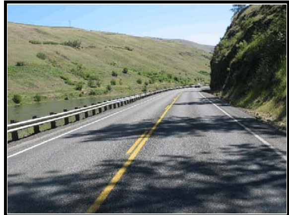
Figure 2. Approach to area of impact with Dodge (east).

The subject vehicle was a 2002 Ford Focus four-door sedan that was being driven by a restrained 38-year-old female. The front right seat was occupied by a restrained 39-year-old male. The second row left seat was occupied by a 3-year-old female seated in a Graco TurboBooster belt positioning booster seat. The Ford was traveling east at an unknown speed ( Figure 2 ). The other vehicle was a 1993 Dodge 2500 series pickup that was being driven by an unrestrained 70-year-old female. The Dodge was traveling west ( Figure 3 ).