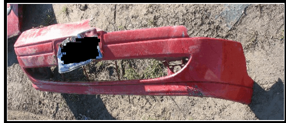
Figure 4. Bumper fascia

The Ford sustained severe interior damage as a result of passenger compartment intrusion and occupant contacts. The left instrument panel, left toe pan, left A-pillar, left lower A-pillar, windshield header, center instrument panel, and right instrument panel sustained longitudinal intrusion. The left front door intruded laterally to the right. The glove compartment door was found in the open position and would not close. The brake and clutch pedals were deformed to the right. The driver's knee bolster exhibited skin transfers on the right side and was cracked on the left. The steering wheel rim sustained 3 cm (1.2 in) of longitudinal deformation and left spoke was fractured and separated from the hub. The steering column appeared to have collapsed, but the shear capsule status was unknown. The center console was fractured and deformed to the right. There were scuffs across the center console and several control knobs were missing. Scuffs were located along the right instrument panel. There was substantial damage from the extrication efforts throughout the vehicle.