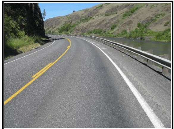
Figure 3. Area of guardrail contact and approach to impact with Ford (west).

For unknown reasons, the Dodge departed the roadway on the right side, struck a guardrail, and then overcorrected into the path of the eastbound Ford. There were no marks left on the roadway prior to the Dodge striking the guardrail or prior to crossing in the path of the Ford. As the Dodge entered the eastbound travel lane it struck the left front of the Ford. The impact damage was severe and resulted in the deployment of the frontal air bag system in the Ford. The Missing Vehicle algorithm of the WinSmash program computed a total delta V of 34 km/h (21.1 mph), based on the Ford's frontal crush profile. The longitudinal and lateral components were -32 km/h (-19.8 mph) and 12 km/h (7.2 mph), respectively. Upon impact, the unrestrained driver of the Dodge was ejected. The Ford was forced rearward and to the south where it came to rest facing northeast in the embankment alongside the roadway. The Dodge rotated in a counterclockwise direction and came to rest on the south side of the roadway with its rear tires on an embankment.