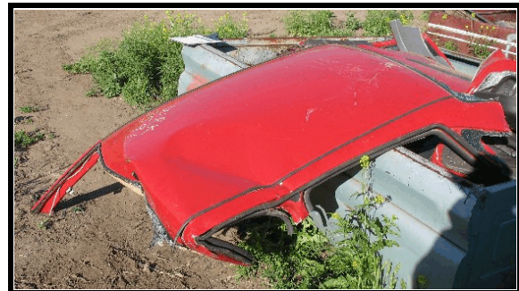
Figure 6. Windshield header/A-pillar damage