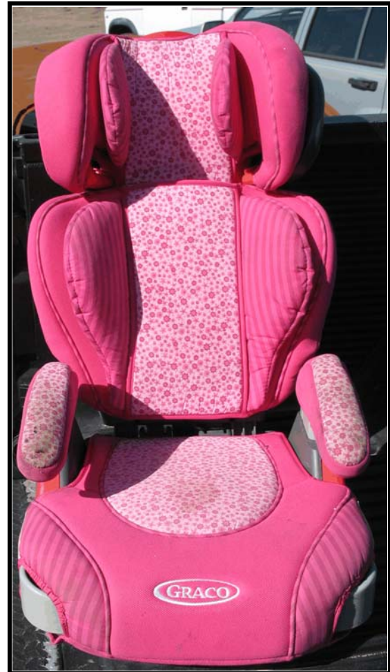
Figure 11. Graco TurboBooster belt positioning booster seat.