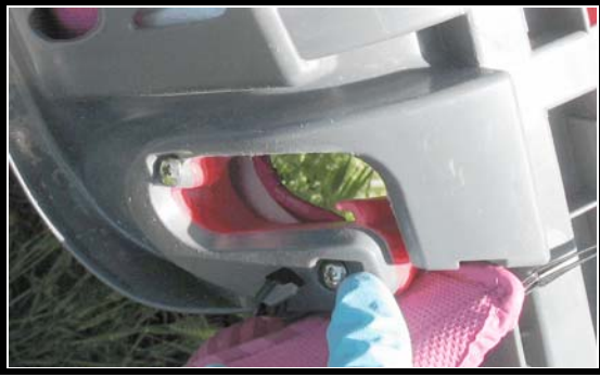
Figure 12. Loading marks to upper belt guide.