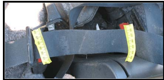
Figure 7. Loading to driver's seat belt webbing.

The Ford was configured with manual 3-point lap and shoulder belts for each seating position. According to the owner's manual, the front row safety belts were equipped with belt height adjustments. Their position was not known. The driver's safety belt was configured with a sliding latch plate and an Emergency Locking Retractor (ELR). Loading evidence was located on the webbing and rescue personnel had cut the webbing during extrication efforts ( Figure 7 ).