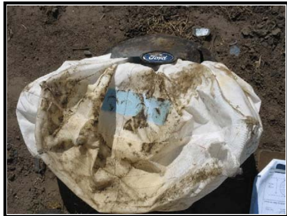
Figure 9. Driver's air bag.