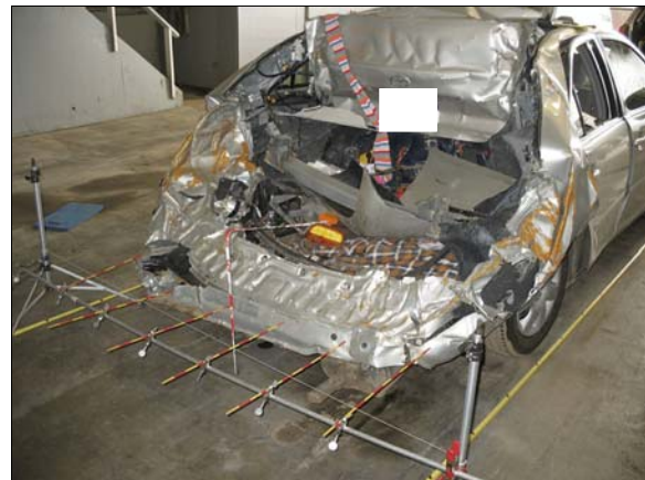
Figure 4: Damage to the back of the Toyota from the impact by the Freightliner