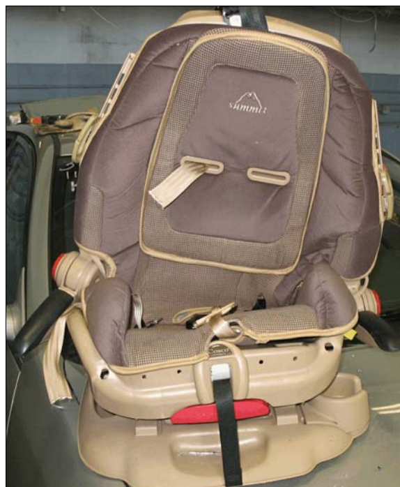
Figure 6: Front view of CSS

The CSS was secured in the second row right seat position by the CSS LATCH anchor straps, which were secured to the lower anchors. The tether strap was not used. Due to the intrusion of the Toyota's seat back, the CSS was held tightly in place by the LATCH anchor straps and had to be cut in order to remove the CSS for inspection. The CSS was deformed as a result of the seat back intrusion, which bent the back of the CSS forward as well as to the left 10 degrees. The right arm rest was also displaced outward, and the lower left side of the seat back sustained a crack in the shell 13 centimeters (5.1 inches) in length ( Figure 7 ). The left harness strap was broken ( Figure 8 ) due to loading on the harness slot as the seat back was bent forward. The harness retainer clip was also broken and the right harness strap was cut by rescue personnel.