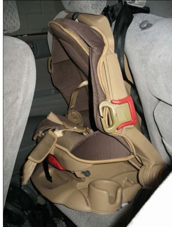
Figure 5: Child safety seat as found, entrapped in the Toyota's second row right seat position

Vehicle Interior: Inspection of the Toyota's interior revealed extensive intrusion into the back seat occupant space. The CSS was found entrapped in the second row right seat position ( Figure 5 ). No evidence of occupant contacts were found in the vehicle. In spite of the severe back impact, the driver's seat back was not deformed rearward and was found in the slightly reclined position. The trunk lid, second row seat back, and backlight header intruded into all of the second row seat positions. The extent of intrusion of the trunk lid, second row seat back, and backlight header were, respectively: 86 centimeters (33.9 inches) 70 centimeters (27.5 inches), and 17 centimeters (6.7 inches). There was no deformation to the steering wheel or compression of the energy absorbing steering column. All windows were closed at the time of the crash and only the backlight and right rear window glazing disintegrated due to impact forces. None of the doors opened during the crash and both rear doors were jammed shut.