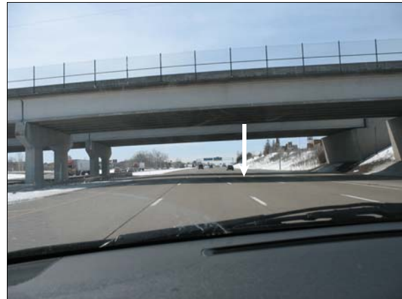
Figure 3: Overview of area of impact in westbound outside center lane (arrow)

Post-Crash: Police and emergency personnel were notified and responded to the crash scene. The Toyota's second row center passenger was assisted medically by a passerby who was a physician and then removed from the vehicle by rescue personnel. The driver's and second row right passenger's method of exit from the vehicle was not determined. All of the Toyota's occupants were transported by ambulance to a hospital. The Toyota and Freightliner were both towed from the scene due to damage.