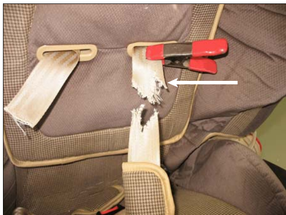
Figure 8: Arrow shows CSS's broken left harness strap; right harness strap was cut by rescue personnel to remove the child from the seat