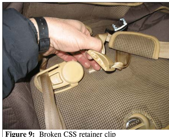
Figure 9: Broken CSS retainer clip