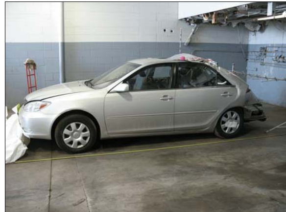
Figure 1: The damaged 2004 Toyota Camry LE

This crash was brought to the National Highway Traffic Safety Administration's attention on March 14, 2008 by an on-line article from a Minnesota newspaper. This crash involved a 2004 Toyota Camry LE ( Figure 1 ) and a 2002 Freightliner FLD-120 truck-tractor with semi-trailer. The crash occurred in March, 2008, at 0823 hours, in Minnesota and was investigated by the Minnesota State Police. This crash is of special interest because the Toyota's second row right passenger (19-month-old, female), was restrained in a Cosco/Dorel Juvenile Group Summit High Back Belt Positioning Booster Child Safety Seat (CSS). This contractor inspected the Toyota, CSS, and the scene on April 1, 2008. A partial interview was conducted with driver on April 4, 2008. The Freightliner was not available and was not inspected. This report is based on the police crash report, scene and vehicle inspections, occupant kinematic principles, and this contractor's evaluation of the evidence.