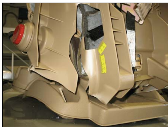
Figure 7: Damage to the CSS's lower left side