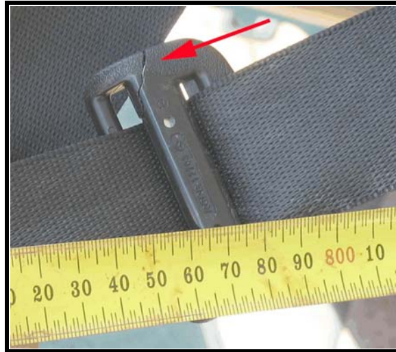
Figure 11. Cracked latch plate

The CSS was damaged during the crash. At the time of the inspection, the back support was no longer attached to the seat bottom. The left arm rest was dislodged and came off the seat. The seat back exhibited signs of crazing due to compression from the left rear door (Figure 14).