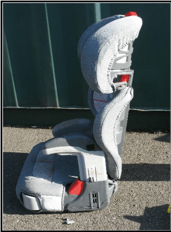
Figure 13. Left side view of booster seat