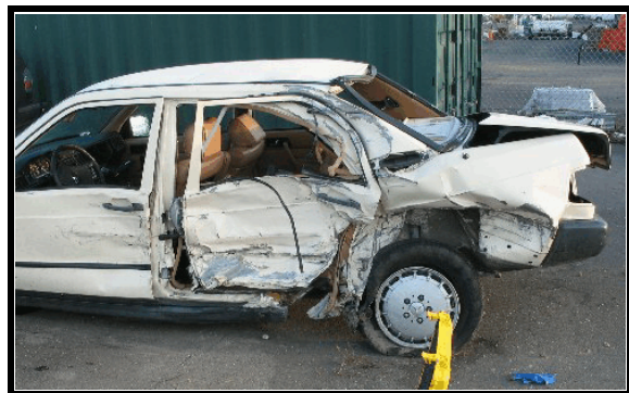
Figure 5. Left side damage

The 1985 Mercedes-Benz sustained moderate left side damage as a result of the impact with the Honda Odyssey ( Figure 5 ). The direct damage began 60 cm (23.6 in) aft of the left rear axle and extended 297 cm (116.9in) forward along the left side plane. The maximum lateral crush was located at C2 and measured 25 cm (9.8 in). There was direct contact to the driver's door, the left rear door, the upper C pillar, and the left rear quarter panel. The driver's door and the left rear door were jammed shut. The door was pulled away from the B-pillar which formed an open gap that measured 20 cm (7.9 in) wide by 42 cm (16.5 in) high at the top and 15 cm (5.9 in) wide by 35 cm (13.8 in) high at the bottom. The base of the C-