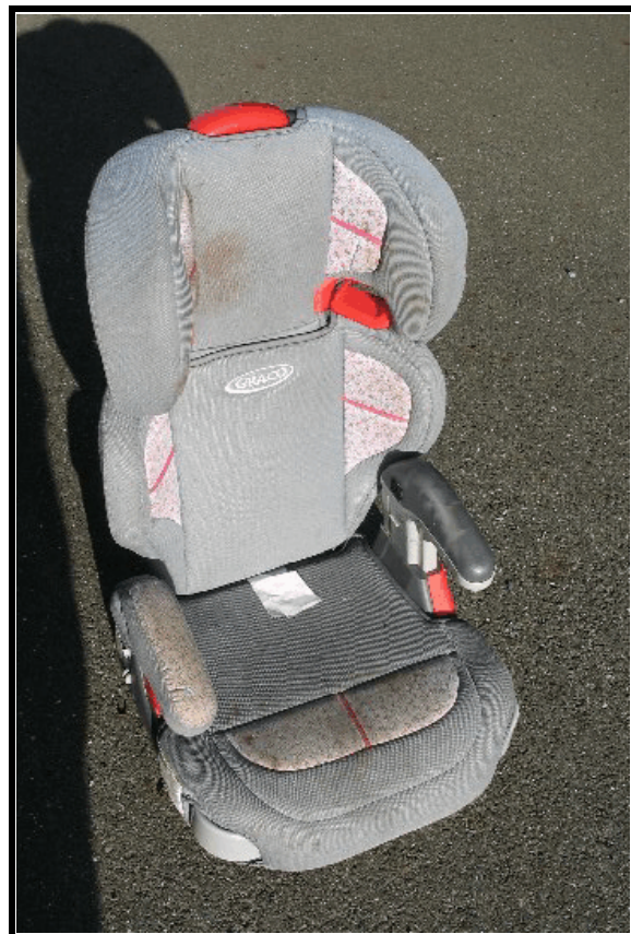
Figure 12. Graco TurboBooster CSS