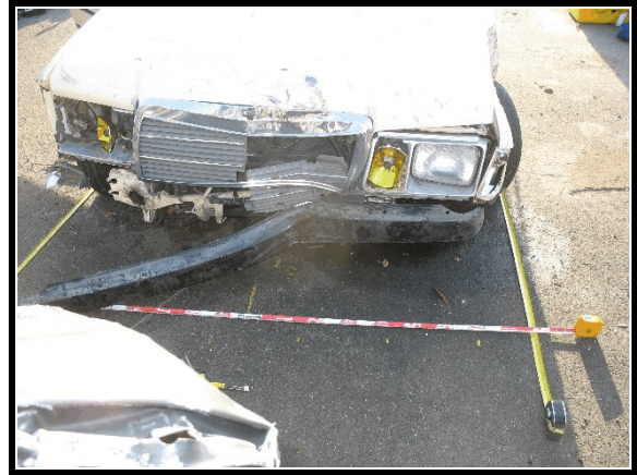
Figure 6. Frontal damage

pillar was pulled away from the door which formed a gap at the bottom that measured 12 cm (4.7 in) wide by 14 cm (5.5 in) high. The anchorage for the second row left seat belt was exposed at this location. Six crush measurements were documented at the mid-door level as follows: C1 = 8 cm (3.1 in), C2 = 25 cm (9.8 in), C3 = 16 cm (6.3 in), C4 = 8 cm (3.1 in), C5 = 4 cm (1.6 in), C6 = 0 cm. The Collision Deformation Classification (CDC) for the impact with the Honda Odyssey was 11LZAW3.