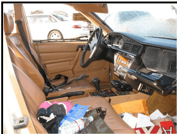
Figure 8. Driver's seated position

The Mercedes sustained moderate interior damage as a result of passenger compartment intrusion. The left side doors, the B-pillar, the C-pillar, and the sill sustained lateral intrusion. The rear bench seat back was displaced longitudinally ( Figures 8-9 ). The specific passenger compartment intrusions were documented as follows: