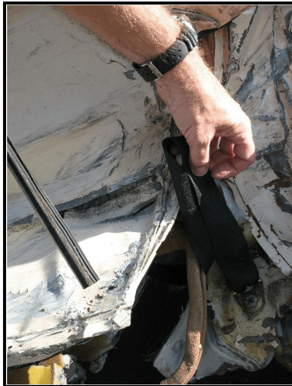
Figure 10. Second row left seat belt anchorage

The rear left safety belt was configured with a sliding latch plate and an Emergency Locking Retractor. The rear left safety belt was used to secure a child safety seat. The seat belt anchorage was exposed during the crash but the belt was not damaged ( Figure 10 ). There was a 48 cm (18.9 in) area of scuffing located on the seat belt webbing. The left rear latch plate was cracked ( Figure 11 ), presumably due to loading.