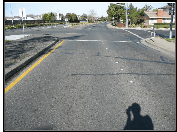
Figure 3. Area of impact with Honda Odyssey

The driver of the Mercedes sustained serious injuries and was transported to a local hospital. She was later arrested for driving under the influence of alcohol. The 3-year-old female sustained severe face and chest injuries. She was transported by air to an area trauma center where she was hospitalized for five days. The occupants of the Odyssey reported minor injuries. The Mercedes was towed from the scene due to damage and was placed on a police hold.