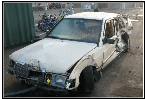
Figure 7. Front and left side damage

The Mercedes sustained front end damage from the impact with a metal pole, the tree and the fence. The impacts could not be separated and a single CDC of 12FDEW1 was assigned to describe the damage ( Figures 6-7 ). Six crush measurements were documented at the bumper level as follows: C1 = 0 cm, C2 = 5 cm (1.9 in), C3 = 11 cm (4.3 in), C4 = 11 cm (4.3 in), C5 = 4 cm (1.6 in), C6 = 0 cm.