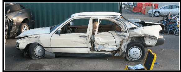
Figure 1. 1985 Mercedes-Benz 190E

This CSS investigation was initiated in response to an online news article which reported a 3-year-old child was seriously injured in a two-vehicle crash. On January 14, 2008 DSI located the case vehicle and child seat and obtained permission for the inspections. DSI was assigned the case on January 15, 2008. Field work was completed on January 16, 2008. The investigating police officers were present during the vehicle and CSS inspections.