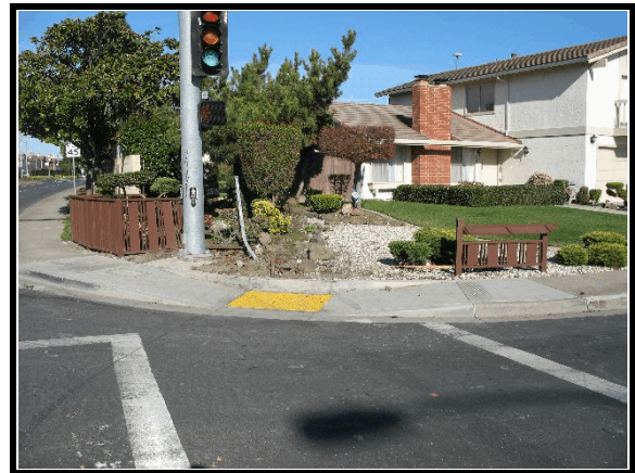
Figure 4. Area of impact with curb, fence, and pole