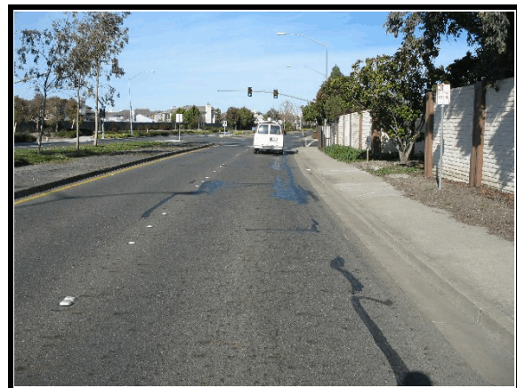
Figure 2. Approach to area of impact (North)

This two-vehicle crash occurred in the approach to a four-leg intersection ( Figure 2 ). At the time of crash, there were no adverse weather conditions and the asphalt roadway was dry. The curved north/south roadway was configured with two lanes in each direction that were separated by a raised median. The northbound travel lanes were separated by raised pavement markers. The intersection was controlled by a tri-color traffic signal. The posted speed limit was 72 km/h (45 mph).