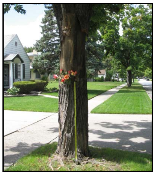
Figure 5: Close-up view of the point of impact.

The force of the impact resulted in a vertical buckling of the hood. The deformed hood penetrated the bark of the tree 1.4 m (4.5 ft) above the ground. As a consequence of the offset left impact, the Camry rotated counterclockwise (CCW) approximately 145 degrees as it separated from the tree. During the rapid rotation of