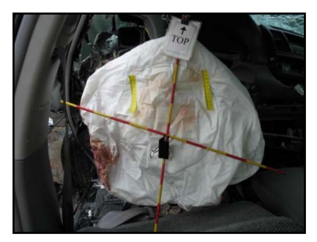
Figure 10: Driver air bag contact evidence.

It is not known if the ACM had Event Data Recorder capabilities. The data possibly recorded by the EDR include pre-crash brake,