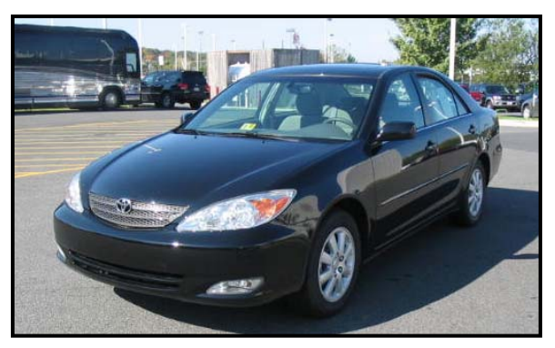
Figure 2: Exemplar Toyota Camry.

The 2005 Toyota Camry was identified by the Vehicle Identification Number (VIN): 4T1BE32K95U (production sequence deleted). Figure 2 is an oblique view of an exemplar Toyota Camry. The vehicle was manufactured in October 2004 and the digital odometer reading was unknown. The four-door sedan was equipped with a 2.4 liter, I4 engine linked to a five-speed automatic transmission. The Camry was equipped with front disc/rear drum brakes with four-wheel antilock (ABS). The interior of the vehicle was configured for five passenger