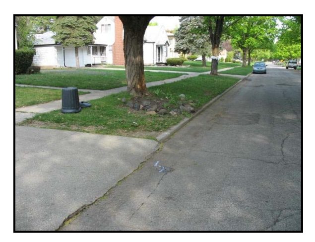
Figure 3: Trajectory view of the Toyota at the road side departure.

the curb. Residential driveways intersected both sides of the street. The posted speed limit was 40 km/h (25 mph). Figure 3 is a westbound trajectory view of the Toyota at the point of the roadside departure. An area of landscape rocks was overridden by the front left wheel rim and an 80 cm (31.5 in) diameter tree was sideswiped as the Toyota left the road. A 53 cm (20.9 in) diameter tree was located 15.8 m (52 ft) downstream and was the point of the frontal impact, Figure 4 . A section of the tree's bark was stripped and removed during the impact. This section was located 1.4 m to 2.6 m (4.5 ft to 8.5 ft) above the ground and extended approximately 40 percent around the tree's circumference. Two scrapes in the asphalt road surface oriented in the northwest direction extended beyond the second tree and evidenced the vehicle's path to final rest. The scrapes measured 5.2 m (17 ft) in length and were attributed to contact from the rear wheel rims. An area of fluid spill and run-off was noted throughout the area of final rest.