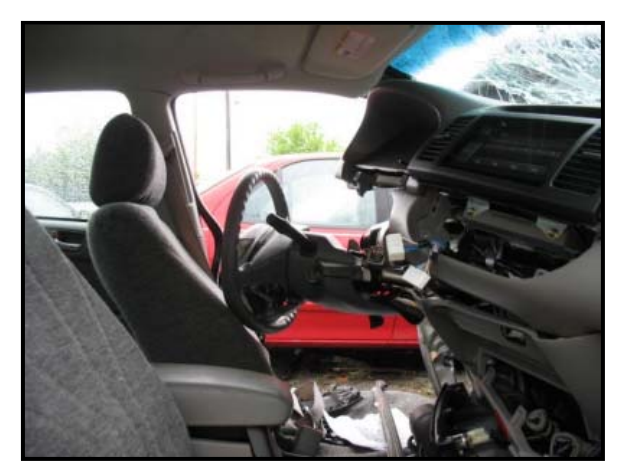
Figure 8: Right lateral view of the intruded steering wheel.