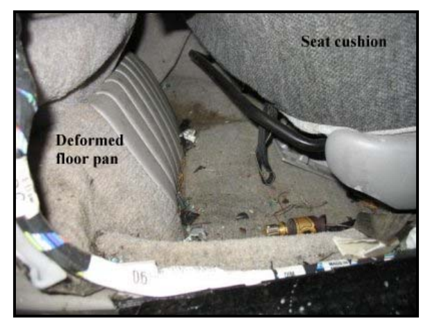
Figure 9: Floor pan intrusion. Floor mats were not present.