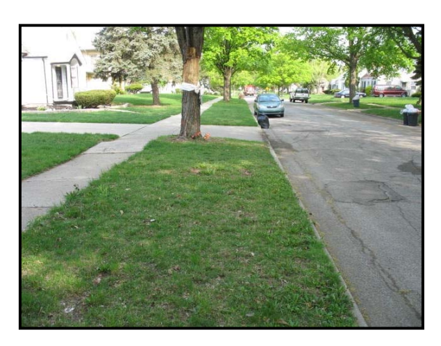
Figure 4: Trajectory view to the frontal impact.