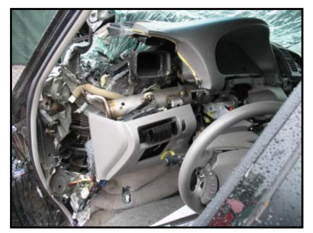
Figure 7: Left front interior intrusion.

The interior Camry sustained severe intrusion into the driver's interior space as a result of the frontal impact. Figures 7-9 are interior views depicting the magnitude and severity of the intrusion. The deformed steering wheel rim was in close proximity to the driver seat back. The left floor pan deformed in an inverted V-pattern and was intruded to the forward edge of the driver seat cushion. Floor mats were not installed in the left floor pan.