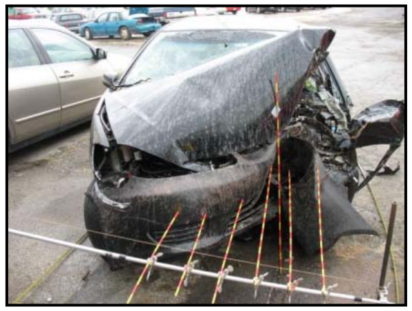
Figure 6: Front view of the Camry.

Figure 6 is a front view of the damaged Toyota Camry. The Camry sustained severe damage as a result of the road side impact sequence. The Toyota sideswiped an 80 cm (31.5 in) diameter tree immediately after departing the road. Although partially masked by the overlapping frontal damage, this swiping contact was observed on the left fender and left front door. The contact measured 112 cm (44.0 in) in length. The lateral extent zone was unknown. The Collision Deformation Classification of this impact was 12-LYES9.