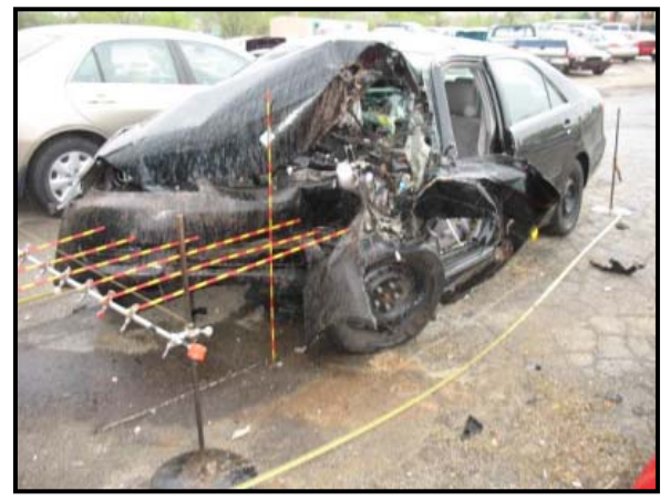
Figure 1: Left front oblique view of the Camry.

This remote investigation focused on the alleged sudden acceleration and the crash dynamics surrounding the single vehicle crash of a 2005 Toyota Camry ( Figure 1 ) and the fatal outcome of the 77 year old female driver. The Toyota Camry was equipped with a 2.4 liter transverse mounted four-cylinder engine linked to a fourspeed automatic transmission with a console mounted shifter. The engine was equipped with an Electronic Throttle Control (ETC). The Camry was equipped with manual three-point lap and shoulder safety belts with retractor pretensioners and Certified Advanced 208-Compliant (CAC) frontal air bags for the driver