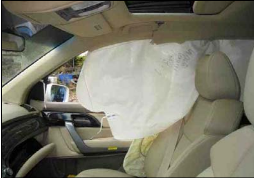
Figure 9 - Right side first row inflatable curtain air bag.

canister located in the roof-rail behind the C-pillar. The overall dimensions of the air bag measured 224 cm x 53 cm (21" x 88"), length by height, respectively. The IC was tethered at the A-pillar and to the roof side rail between the C- and D-pillars. The front tether was cut at its midpoint post-crash. There was no discernable loading evidence on the deployed side air bags.