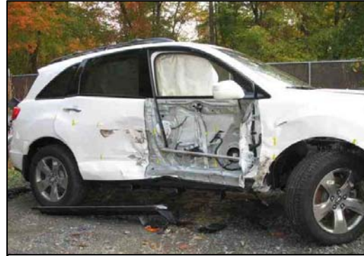
Figure 4 - Damaged right side of the Acura.

The 2007 Acura MDX sustained moderate damage as the result of the impact with the Land Rover ( Figure 4 ). The direct contact damage began 69 cm (27") forward of the right rear axle and measured 191 cm (75") in length. The combined direct and induced damage began 13 cm forward of the right rear axle and measured 284 cm (116") in length. The maximum crush was located between C3 and C4, 170 cm (67") forward of the right rear axle. The maximum crush measured 22 cm (8.7") in depth. The crush profile consisted of six equidistant measurements taken along the mid-door level of the vehicle's right side and was as follows: C1 = 0 cm, C2 = 2 cm (0.5"), C3 = 10 cm (4"), C4 = 19 cm (7.5"), C5 = 4 cm (1.5"), C6 = 0 cm. The Collision Deformation Classification (CDC) for this impact was 01-RYEW-2.