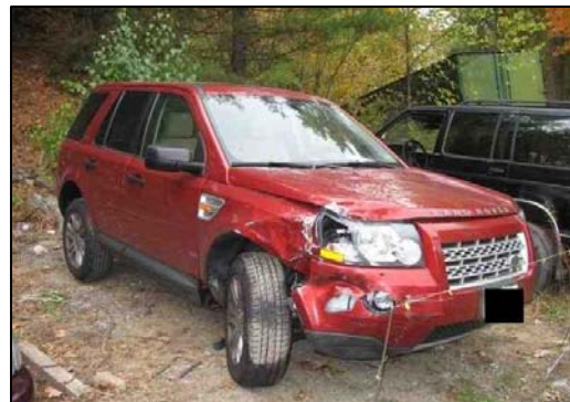
Figure 5 - Damaged front plane of the Land Rover.

The 2008 Land Rover LR2 sustained minor damage during the impact with the 2007 Acura MDX ( Figure 5 ). The direct contact damage began 36 cm (14") right of the vehicle's centerline and extended 48 cm (19") to the front right bumper corner. The direct and induced damage encompassed the full frontal bumper width and measured 160 cm (63"). The maximum crush was to the front right bumper corner and measured 22 cm (8.7") in depth. Six