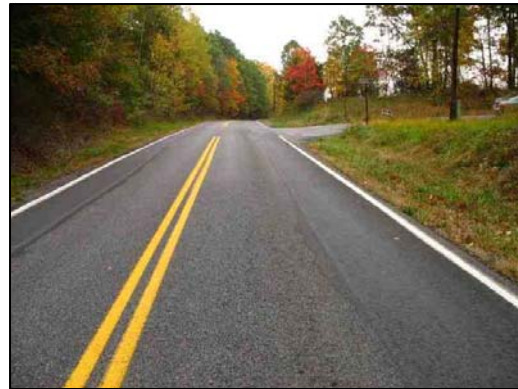
Figure 3 - Eastbound approach of the Land Rover.