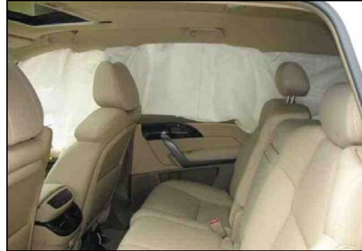
Figure 10 - Right side second row inflatable curtain air bag.