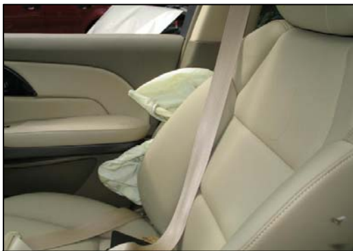
Figure 7 - Side impact seat back mounted air bag.