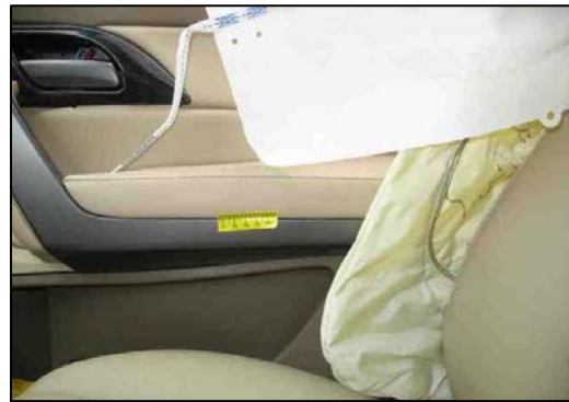
Figure 6 - Seat back mounted side air bag.