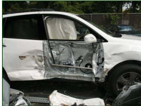
Figure 1. Right side damage to the Acura.

This on-site investigation focused on the side impact air bag system that deployed in a 2007 Acura MDX sport utility vehicle ( Figure 1 ) during an intersection crash with a 2008 Land Rover LR2. The Acura was equipped with a Certified Advanced 208-Complaint (CAC) frontal air bag system, seat back mounted thorax air bags in the front outboard positions, and Inflatable Curtain (IC) air bags that provided protection to the six outboard positions. The manufacturer of this vehicle certified that the vehicle meets the advanced air bag requirement of the Federal Motor Vehicle Safety Standard (FMVSS) No.