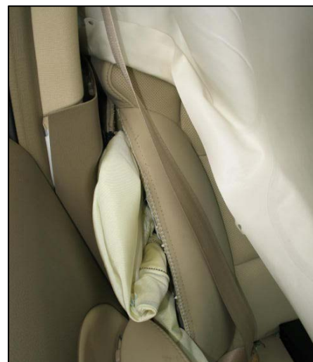
Figure 8 - Seat back mounted side air bag.

The right IC ( Figures 9 and 10 ) deployed downward from its mounting in the vehicle's roof side rail. The rectangular IC provided coverage that extended from the A- to the C-pillars. At deployment, the IC was inflated by compressed helium that was stored in a