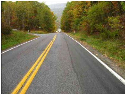
Figure 2 - Westbound approach of the Acura.

The driver of the Acura was traveling in a westerly direction on the two-lane road during daylight hours. As he approached a four-leg intersection, the driver initiated a left turn across the path of the eastbound Land Rover. A witness that was traveling behind the Acura reported that the vehicle initiated a left turn and then stopped inside the intersection. The driver of the Land Rover, however, indicated that the Acura proceeded to turn left without stopping. The 31-year old male driver of the Land Rover braked and steered left in an attempt to avoid the Acura. Figures 2 and 3 are the approach views of both vehicles.