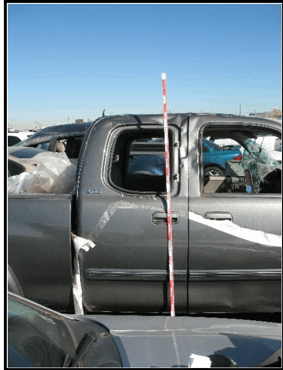
Figure 4. Right side damage