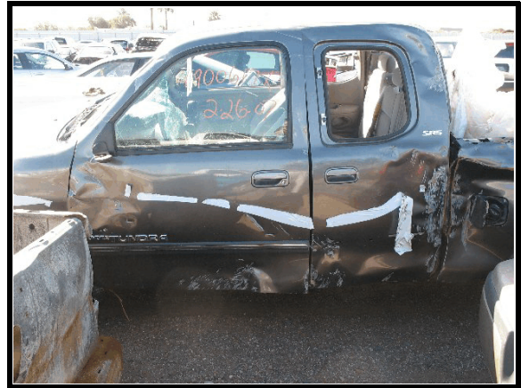
Figure 1. 2005 Toyota Tundra

This on site investigation focused on a 2005 Toyota Tundra ( Figure 1 ) during a rollover crash and a booster safety seat that was installed in the second row right seat. This single vehicle crash occurred in February 2007 at 1436 hours. The crash occurred on a curved two-lane state highway. It was snowing at the time of the crash. The speed limit at this location was 89 km/h (55 mph). The case vehicle was a 2005 Toyota Tundra access cab pickup that was being driven by a restrained 37-year-old male. There were three additional occupants in the vehicle. The front right seat was occupied by a restrained 36-year-old female. The second row middle seat was occupied by a 6-year-old female. The second row right seat was occupied by a 3-year-old male who was seated in a booster safety seat. The Toyota Tundra was traveling northbound at a police reported speed of 89 km/h (55 mph) and was entering a left hand curve. The driver lost control of the vehicle due to the slippery road conditions. The Toyota Tundra departed the roadway on the right side and began traveling down an embankment. The right front of the Tundra probably contacted a juniper tree on the embankment. The Tundra began a clockwise rotation and the vehicle tripped and rolled over onto its left side. The driver indicated that no one sustained any injuries. The Toyota Tundra was towed from the scene due to damage. It was later declared to be a total loss by the insurance company.