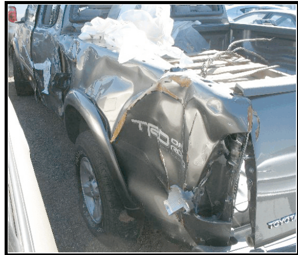
Figure 6. Damage at the tail gate area