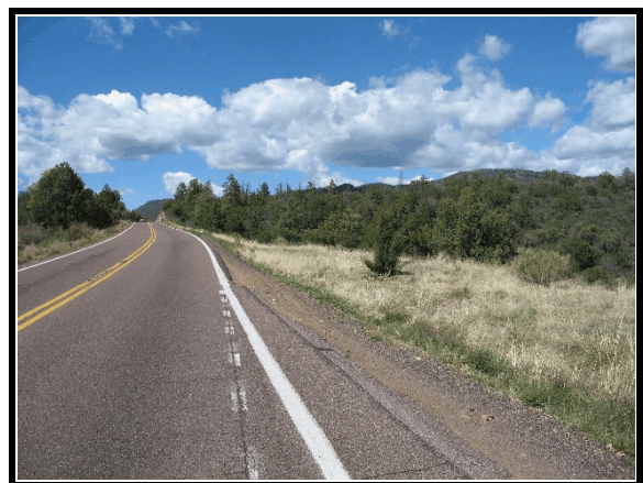
Figure 2. Approach to area of roadway departure (north)

This single vehicle crash occurred in February 2007 at 1436 hours. The crash occurred on a curved portion of a two-lane state highway ( Figure 2 ). At the time of the crash, it was snowing and the asphalt roadway was snow and slush covered. There was a slight uphill grade in the area of the roadway departure.