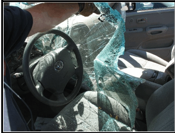
Figure 7. Overview of front row seating

The 2005 Toyota Tundra sustained minor interior damage as a result of passenger compartment intrusion. The C-pillar intruded 4 cm (1.6 in) into the passenger compartment laterally. The windshield was cracked from impact damage and was removed to aid in extrication. Both right side windows and the left rear window were disintegrated. The outboard portions of the three part backlight were also disintegrated. All the doors remained closed and operational.