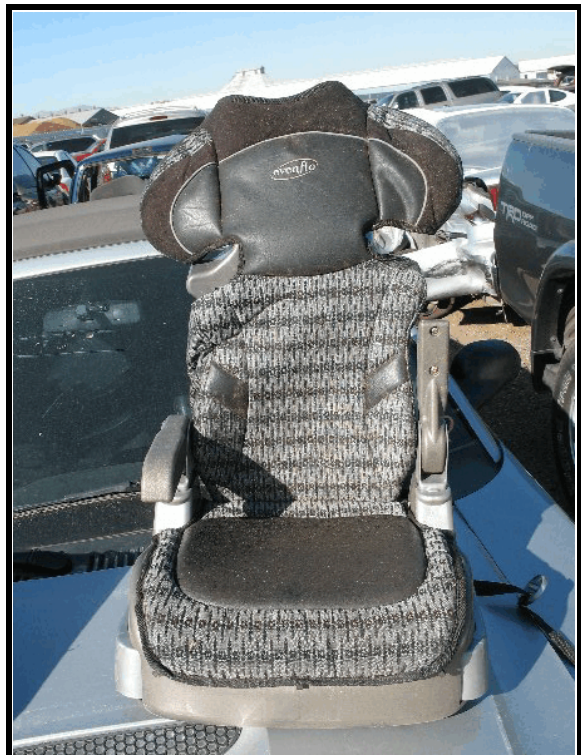
Figure 10. Evenflo Big Kid Booster Seat. Damage to upper right seatback.