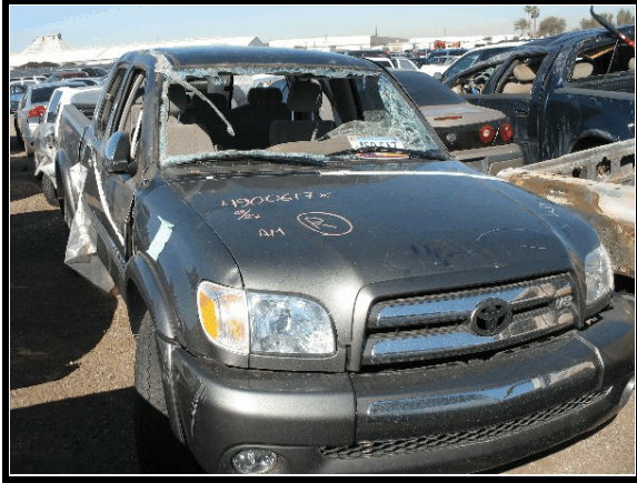
Figure 3. Front right, 2005 Toyota Tundra