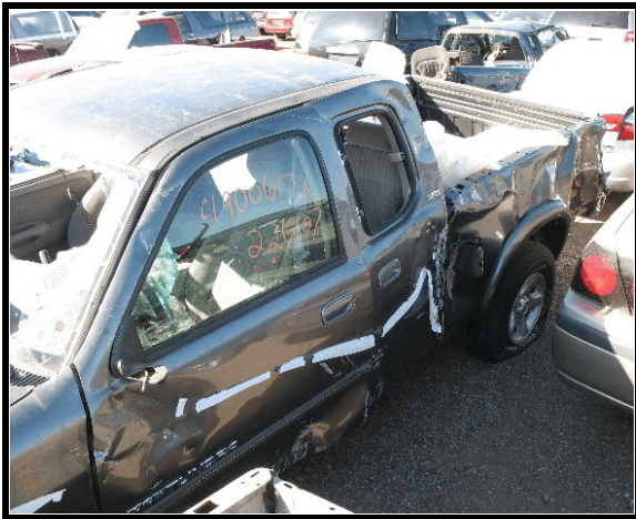
Figure 5. Left side rollover damage