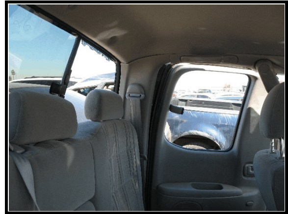
Figure 8. Overview of second row seating