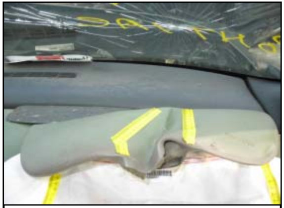
Figure 8. Deformed front right air bag module cover flap.

The front right passenger air bag was a top-mount design, incorporated into the right instrument panel. A single cover flap concealed the front air bag. The cover flap measured 36 cm (14") in width and 19 cm (7.5") in depth. The cover flap was constructed of a vinyl top with a steel backer panel. Prior to the impact, the driver applied a level of braking which resulted in the forward displacement of the front right passenger. At impact, the frontal air bag system deployed which resulted in interaction between the front right passenger and the deploying front right air bag. This interaction was evidenced by a tissue transfer on the cover flap and deformation of the vinyl top and steel backer panel (Figure 8 and 9). The transferred tissue measured 5 cm (2") in height and 0.3 cm (0.125") in width. The transfer was located right of the centerline from 5-10 cm (2-4") forward of the leading edge. The deformation of the vinyl top and steel backer panel was a V-shaped crease that was 6 cm (2.5") in width and extended from the leading edge to the rear edge. Additionally, the forward edge of the flap contained fragments of tissue. The cover flap rotated the child's head up and rearward as it continued to open, hyper-extending the child's neck.