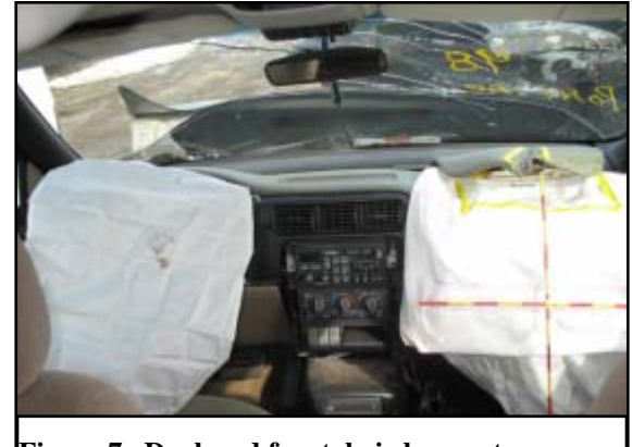
Figure 7. Deployed frontal air bag system.

The driver's air bag was contained within the four-spoke steering wheel and was concealed by two symmetrical I-configuration cover flaps. The flaps were 11 cm (4.25") wide and 8 cm (3.125") in height. The air bag membrane measured