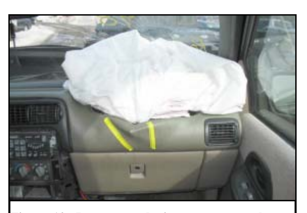
Figure 10. Damage to the instrument panel from the impeded deployment.

As a result of the forward position of the child against the cover flap, the deployment of the air bag was impeded. This impeded deployment was evidenced by rearward