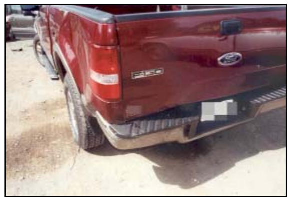
Figure 5. Rear plane damage to the Ford.

The 2005 Ford F-150 sustained moderate damage as result of the impact with the Pontiac ( Figures 5 and 6 ). This vehicle was not inspected during this on-site investigation. The damage information was based on the police provided images of the Ford. Direct contact damage was apparent on the rear plane with induced deformation to the left side of the cargo box. In addition, there was cab-to-bed contact from the forward displaced cargo bed. The direct contact damage began at the rear left bumper corner and extended right approximately three-quarters of the bumper width. The maximum crush occurred at the rear left bumper corner and was approximately 10 cm (4"). The CDC for this impact was 06-BDEW-1.