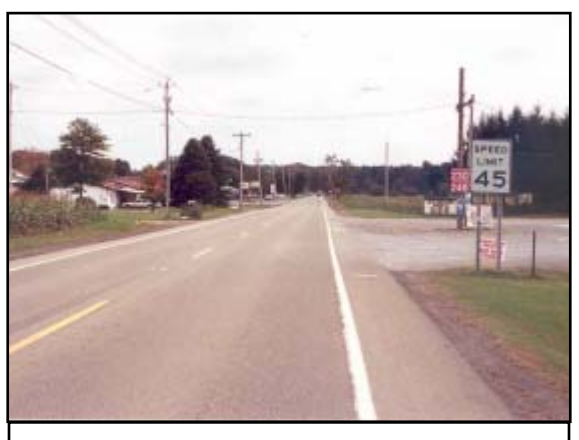
Figure 2. Area of impact.

The driver of the Pontiac was unable to stop the vehicle as the front of the Pontiac impacted the rear of the Ford in the eastbound travel lane ( Figure 2 ). The front-to-rear impact configuration was slightly off-set, right for the Pontiac and left for the Ford. Initial contact involved the front bumper of the Pontiac against the rear bumper of the Ford; however, as the bumpers crushed the front of the Pontiac underrode the rear of the Ford. This was apparent by the deformation to the Pontiac's upper radiator support. The resultant directions of force were 12