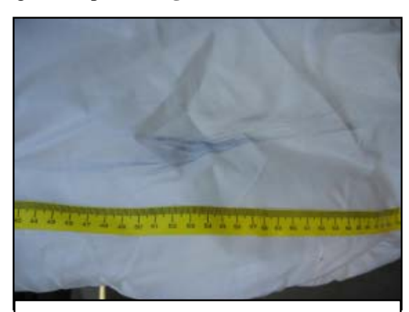
Figure 12. Blue fabric transfer on the right side pane.