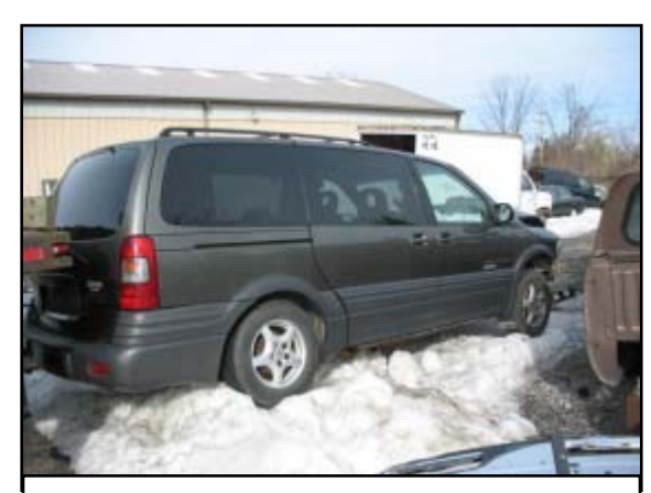
Figure 1. Subject vehicle 1998 Pontiac Trans Port Montana.

This on-site investigation focused on the severity of the crash and the source of injury that caused the death of an unrestrained 9-year-old female front right passenger of a 1998 Pontiac Trans Sport Montana ( Figure 1 ). The Pontiac was involved in a moderate severity front-to-rear collision with a 2005 Ford F-150. The Pontiac was equipped with a redesigned frontal air bag system for the driver and front right positions and buckle mounted safety belt pretensioners. As a result of the crash, the frontal air bags deployed and the safety belt pretensioners