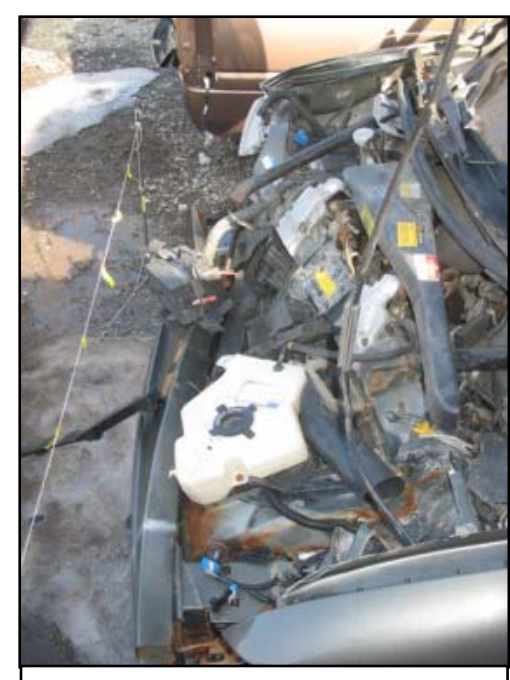
Figure 4. Left lateral view of the crush to upper radiator support.