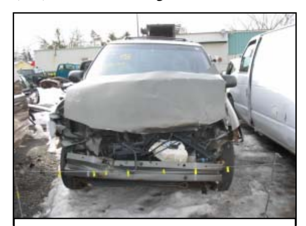
Figure 3. Frontal damage to the Pontiac.

The front of the vehicle underrode the rear of the Ford; therefore, the direct contact damage and crush profiles were documented at the level of the bumper beam and the upper radiator support. The direct contact damage on the bumper fascia measured 122 cm (48") which began at the front left corner and extended to the right, terminating 31 cm (12") inboard of the right corner. The maximum crush at the bumper level was 38 cm