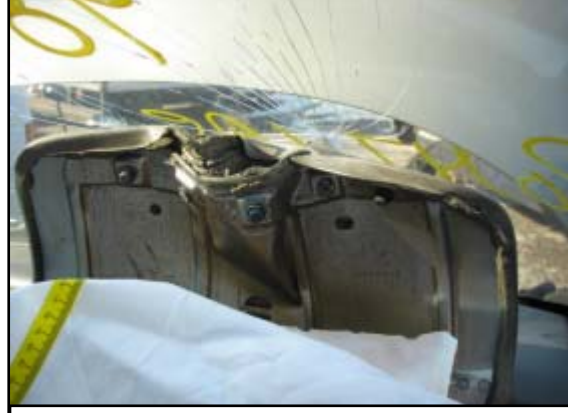
Figure 9. Steel backer panel deformation.

The air bag membrane was rectangular in shape with dimensions of 74 cm (29") in height and 48 cm (19") in width. The membrane was tethered by two wide band tethers that were 48 cm (19") in width. Two vent ports on the side panels at the 3 and 9 o'clock positions vented the air bag. The rearward excursion of this air bag was 33 cm (13") at the tether locations.