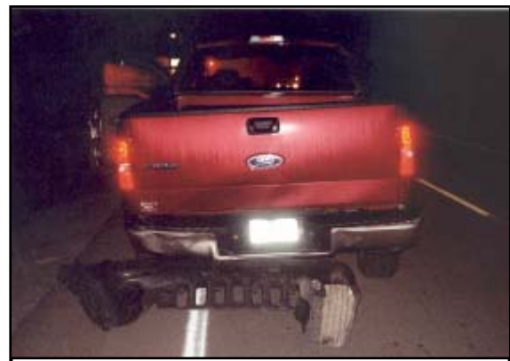
Figure 6. On-scene image of the resultant damage to the Ford.