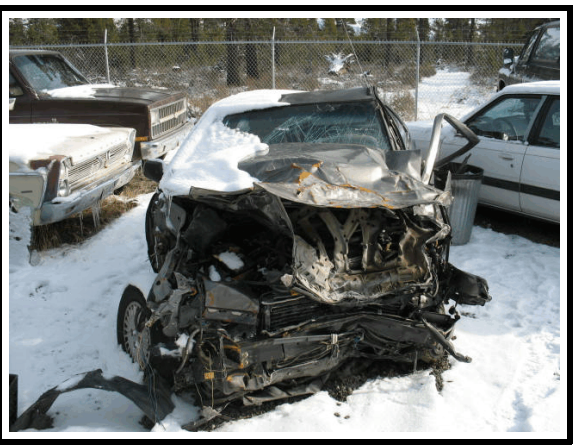
Figure 1. Front - 1986 Honda Accord

According to police and the driver of the Dodge Ram, the Honda Accord's engine was on fire postcrash. The driver of the Dodge pickup reported that he carefully removed the child from her safety seat and held her in a fixed and stable position until paramedics arrived. Several people stopped at the scene and helped put out the fire with fire extinguishers. Police reported that the driver's