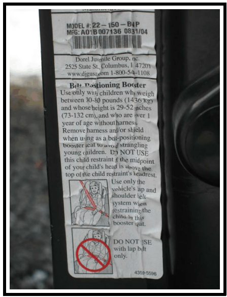
Figure 23. CSS label information