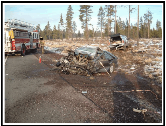
Figure 6 . Vehicles at final rest

According to police and the driver of the Dodge Ram, the Honda Accord's engine was on fire postcrash. The driver of the Dodge pickup reported that he carefully removed the child from her safety seat and held her in a fixed and stable position until paramedics arrived. Several people stopped at the scene and helped put out the fire with