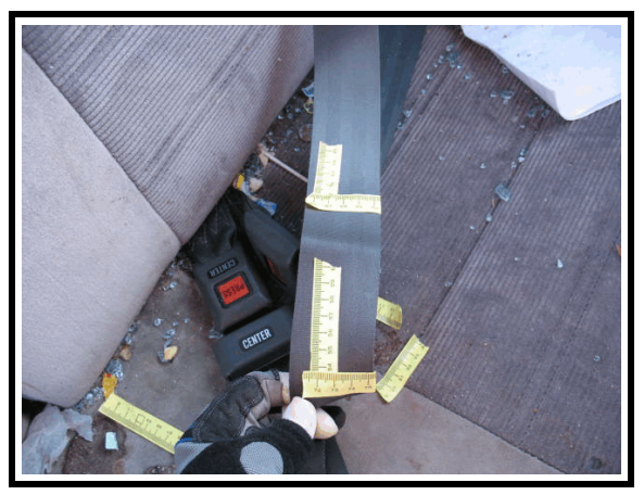
Figure 21 . Scuffs and indentation on LR seat belt