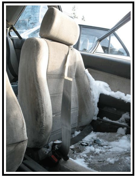
Figure 20. Driver's seat belt (blood on shoulder belt)

The second row left seat belt was used to secure the child in the safety seat (see Figure 21). According to the driver of the Dodge Ram, the lap and shoulder belt were routed across the front of the child.