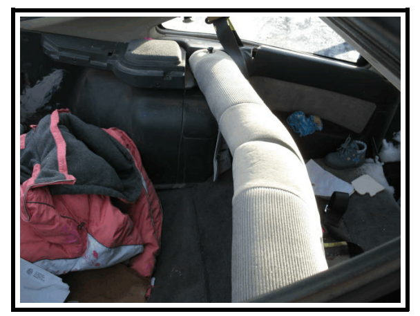
Figure 18 . Second row seat back deformed from impact of rear cargo