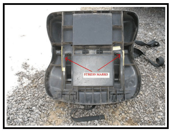
Figure 25. Visible stress marks on bottom of the CSS