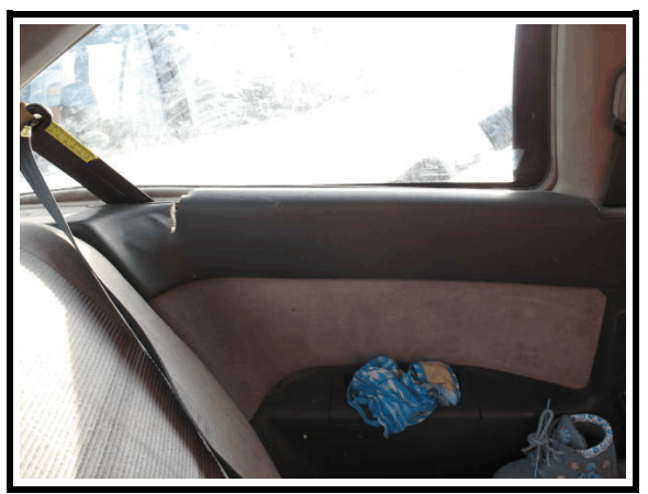
Figure 19 . Damage/Intrusion to left rear side panel