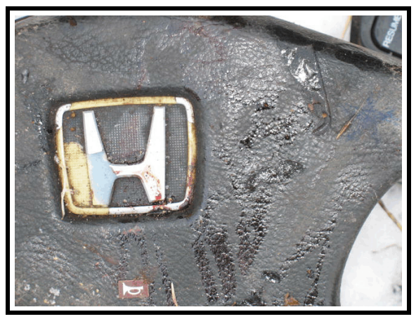
Figure 30 . Close-up - blood and tissue transfers on steering wheel hub

The driver's face and chest struck the steering