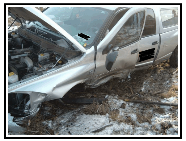
Figure 29 . Damaged 2006 Dodge Ram