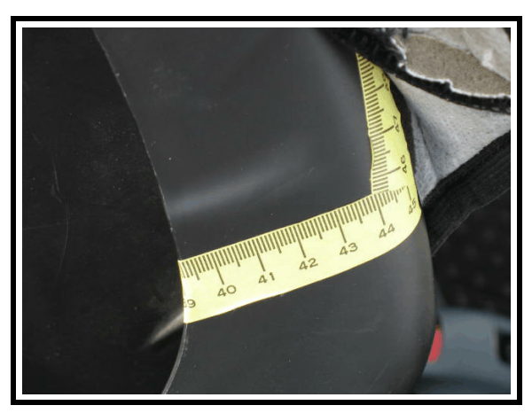
Figure 27 . Close-up – stress mark on right side of booster seat