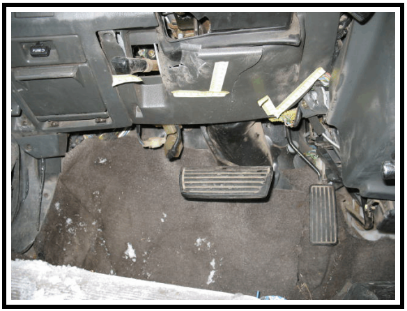
Figure 31. Occupant contacts to steering column and left instrument panel

wheel (see Figure 30), breaking the driver's nose and deforming the wheel. According to the driver, the steering wheel broke off during the crash. A control lever mounted on the right side of the steering column and a control knob mounted on the left center instrument panel (see Figure 31) were also displaced due to occupant contact.