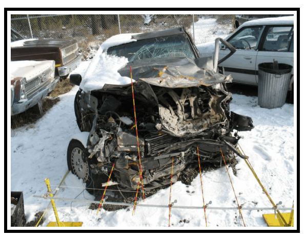
Figure 9. Front crush profile

Six crush measurements were documented at the bumper level as follows: C1=97.0 cm (38.2 in), C2=75.0 cm (29.5 in), C3=73.0 cm (28.7 in), C4=53.0 cm (20.9 in), C5=28.0 cm (11.0 in), C6=24.0 cm (9.4 in). An additional 9.0 cm (3.5 in) of freespace was subtracted from each C measurement to account for the missing bumper cover and foam. Since an exemplar 1986 Honda Accord LX-I could not be located, front bumper freespace had to be estimated from a 1989 Honda