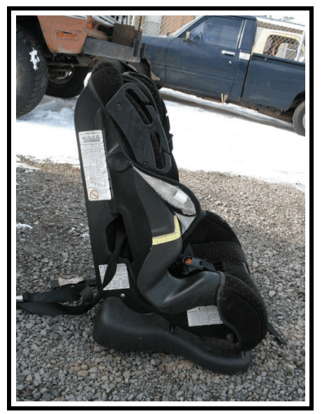
Figure 26 . Stress mark on right side of CSS (highlighted with yellow tape)

This CSS was equipped with the LATCH system but the 1986 Honda Accord was not equipped with the necessary LATCH components. There was a locking clip found on the back of the CSS, in the locking clip's original storage location.