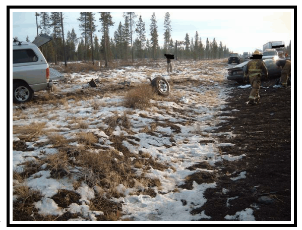
Figure 7 . Vehicles & Dodge Ram's LF tire at final rest (police photo)

extinguishers. Police reported that the driver's seat was found "slammed forward" with the driver leaning over the steering wheel. Police also reported that the driver was able to unbuckle her seat belt and slide her body between the two front row seats. According to the driver of the Dodge Ram, the driver of the Accord was entrapped in her seating area and was eventually removed by a passerby, who used a metal bar to pry an opening in the left front window frame.