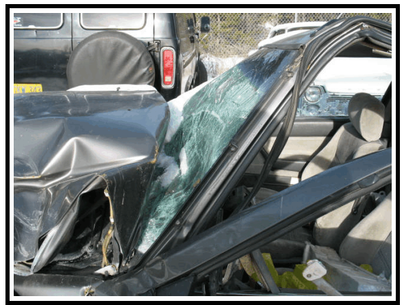
Figure 17. Windshield damage/intrusion