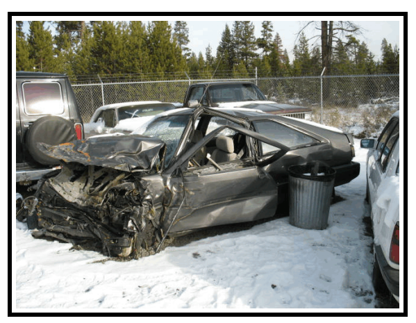
Figure 10. Front/Left - Case vehicle

Accord. Further efforts to locate and measure a 1986 Accord LX-I continued but were not successful. The maximum longitudinal crush was located at C1, the left front bumper corner. There was crush located above the front bumper but there was not enough crush at any of the C measurements to require crush averaging.