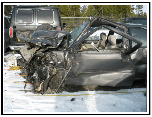
Figure 2. LF damage - 1986 Honda Accord