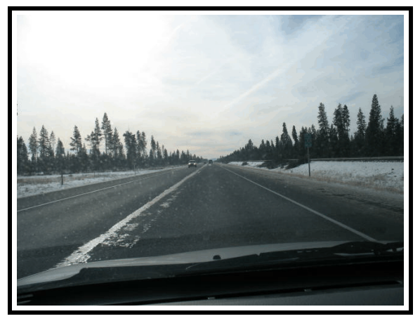
Figure 4 . Approach of case vehicle to crash location (south)

downward away from the roadway. On the east