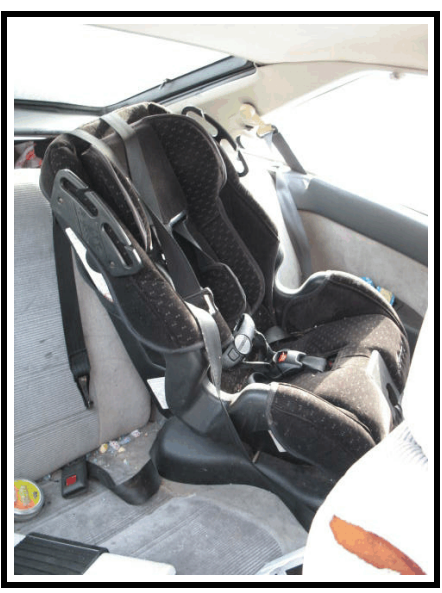
Figure 22 . Dorel Alpha Omega child safety seat as found in vehicle

The manufacturer recommends that the seat be used as a belt positioning booster only with children who weigh between 14-36 kg (30-80 lbs), whose height is between 73-132 cm (29–52 in), and who are greater than 1 year of age without harness. The manufacturer recommends to remove the harness and/or shield when using it as a belt-positioning booster seat, in order to avoid strangling young children. See Figure 23 for more information on the manufacturer's instructions on how to use the seat as a belt positioning booster. The child's reported weight on her official medical records was 13.5 kg (29.8 lb) which is just under the lowest recommended weight for this seat when it is used as a belt positioning booster seat. The child's height, 76 cm (30 in) was just above the lowest acceptable height to use this seat as a belt positioning booster. The harness straps had not been removed from the CSS, as recommended by the manufacturer when using the seat as a booster seat.