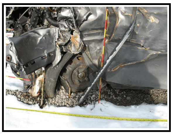
Figure 8. Damage to LF tire/rim

At the time of the inspection, both front row seats were adjusted to the fully rearward track position. The driver's mother reported that her daughter generally positioned the seat track between the center and forward most track setting. The driver's