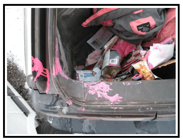
Figure 16 . Hatchback opened during crash - paint found outside of rear cargo area