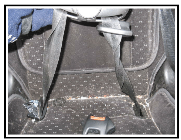
Figure 24. Twisted harness straps

The harness straps were found buckled, with the top straps threaded through the top harness slots. The retainer clip was found connected and fairly low on the harness straps. There were pieces of padded fabric around the upper harness straps (original equipment). The harness straps were twisted on both sides (see Figure 24). The plastic shell showed signs of stress in several areas (see Figures 25-27). There were stress marks on the right center section and to the bottom center area of the seat. There were no signs of occupant loading or contact to the harness straps, retainer clip, or to the shell padding.