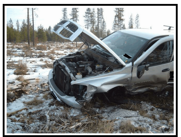
Figure 3 . Damaged 2006 Dodge Ram (police photo)