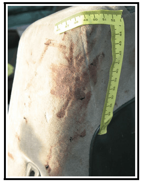
Figure 14. Blood on the left side of the RF seat back