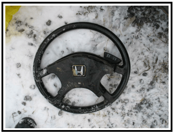
Figure 12. Steering wheel (cut out of vehicle)

that would have been retracted into the B-pillar had it not been in use. The left rear seat belt webbing showed signs of loading in several areas. The driver reported that her seat belt "broke" during the crash, but there were no obvious failures found during the vehicle inspection. It is possible that the driver's seat belt emergency locking retractor did not hold her in place during the impact. Police reported that the driver's seat was found "slammed forward" with the driver leaning over the steering wheel. According to the driver of the Dodge Ram, a passerby had to "break" the driver's seat back while he was helping get her out of the vehicle, but further details were not able to be obtained.