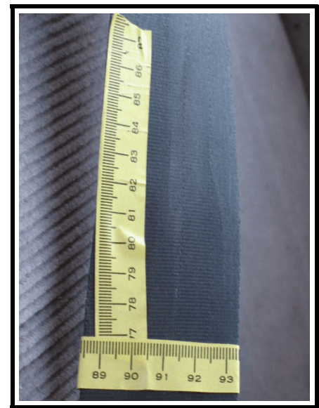
Figure 33. Evidence of loading to the second row left seatbelt