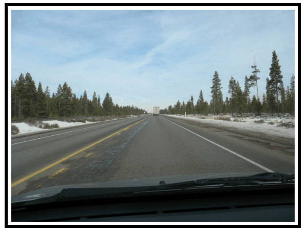
Figure 5 . Approach of Dodge Ram to crash location (north)

The other vehicle, a 2006 Dodge Ram 3500 pickup, was being driven by a restrained 35-year-old driver. There were no other occupants in the vehicle.