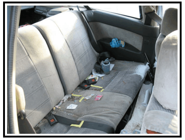
Figure 15. Location of blood stains on second row seat cushion and center lap belt

The second row seat backs were deformed from contact with rear cargo. The spare tire was out of its storage area and it is possible that it impacted the back of the second row seat backs during the collision. The other cargo was not large or heavy enough to have caused the deformation.