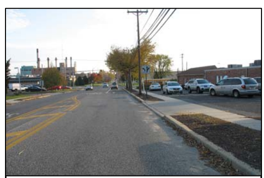
Figure 2 – Southbound approach o Chevrolet.

Both impacts involved the frontal plane which resulted in a combined crush profile. The combined crush profiles of the two impacts were used to generate a barrier algorithm of the WinSMASH program. The program computed a total delta-V of 43 km/h (26.7 mph). The specific longitudinal and lateral velocity