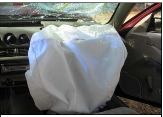
Figure 7 - Deployed front right air bag.

A Graco CarGo CSS (Figure 8) was installed forward-facing in the rear right position of the 1998 Chevrolet Lumina. The CSS was present inside the vehicle at that location during the SCI inspection. The model number of the CSS was 8481SVD and the date of manufacture was 03/03/2004. The CSS was rated for children between 14 and 45 kg (30 –