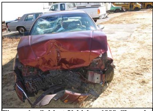
Figure 1 - Subject Vehicle - 1998 Chevrolet Lumina

This on-site investigation focused on the performance of a Graco CarGo booster Child Safety Seat (CSS) that was present in a 1998 Chevrolet Lumina four-door sedan (Figure 1). The vehicle was occupied by a restrained 20-year old female driver and a 4-year old female seated in the booster CSS in the right rear seating position. The child was restrained within the CSS by the vehicle's manual lap and shoulder restraint. The Chevrolet was equipped with redesigned frontal air bags for the driver and front right passenger position, which