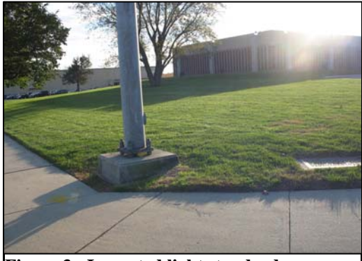
Figure 3 - Impacted light standard.