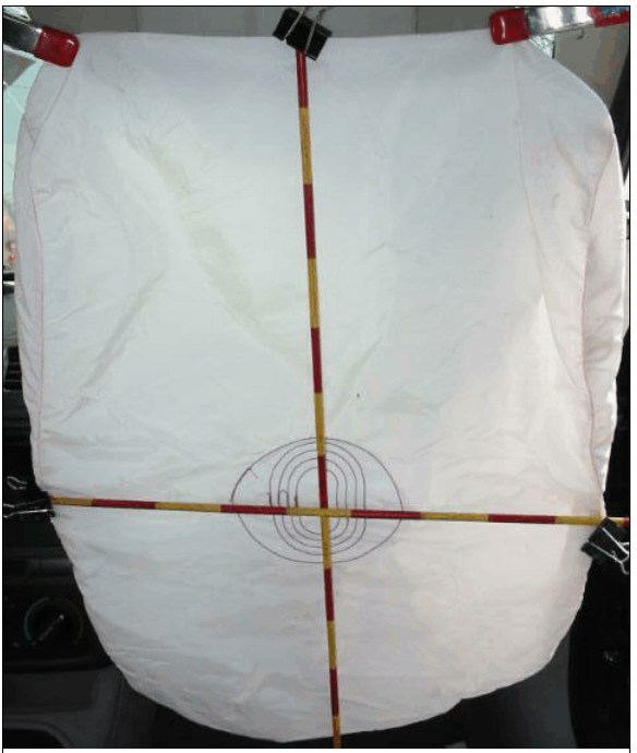
Figure 12: Overview of case vehicle's front right passenger air bag

as buckled, the front right passenger air bag was indicated as not suppressed, and a deployment of the driver's and front right passenger's pretensioners was commanded. The interpretation of the Longitudinal Axis Deployment Data graph shows that the first stage deployment command was issued at the approximate 80 millisecond sample point. A second stage deployment was not required and disposal of the second stage was commanded. The maximum recorded longitudinal and lateral Delta Vs were respectively: -36 km.p.h. (-22.37 m.p.h.) and 8.72 km.p.h. (5.42 m.p.h.), and the reported estimated principal direction of force was 345 degrees. Lastly, the data indicated that the deployment event recording was complete.