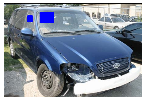
Figure 5: Overview of Kia, under repair, case vehicle impacted right fender, right front wheel and right front bumper corner

Crash: The front of the case vehicle ( Figure 4 ) impacted the Kia's right fender, right front wheel and right front bumper corner ( Figure 5 ) causing a stage 1 deployment of the case vehicle's driver and front right passenger air bags. In addition, both the case vehicle's driver and front right passenger safety belt pretensioners actuated.