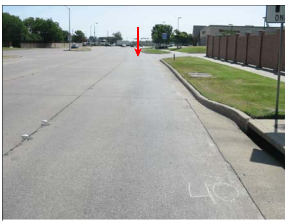
Figure 1: Approach of case vehicle to intersection eastbound in outside through lane, arrow shows area of impact, number shows meters to impact

Pre-Crash: The case vehicle was eastbound in the outside through lane (Figure 1). The case vehicle's travel speed based on the driver interview and supported by the EDR data was 64 km.p.h. (40 m.p.h.). The driver was intending to continue eastbound through the intersection. The police crash report indicated that eastbound traffic in the center and left through lanes was moving slowly due to heavy traffic. The Kia was westbound in the outside left turn lane (Figure 2 below), and the driver was intending to turn left (south) once traffic cleared. The Kia's driver stated that the eastbound traffic stopped to let her turn left. She did not see the approaching case vehicle due to stopped traffic and executed the left