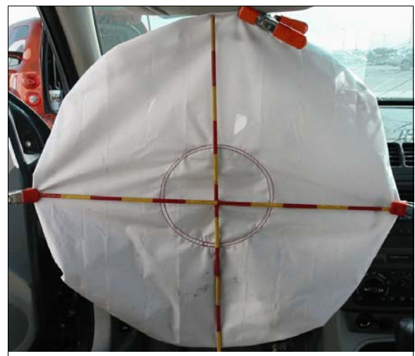
Figure 9: Case vehicle's driver air bag