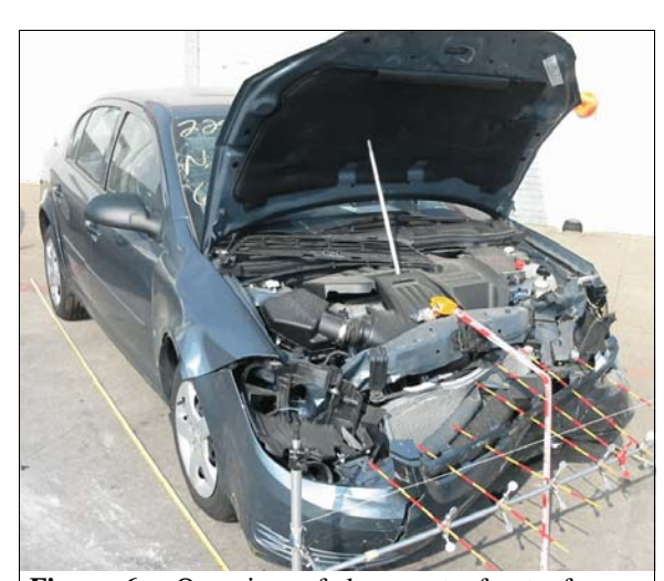
Figure 6: Overview of damage to front of case vehicle from impact with Kia, vertical scale is in tenths of meter, each stripe on rods in 5 cm (2 in)

Exterior Damage: The case vehicle's impact with the Kia involved the front end. The front bumper, grille, hood and front of the left fender were directly contacted and crushed rearward and slightly to the right (Figure 6). The direct damage began at the left corner of the front bumper fascia and extended across the full width of the front bumper. The bumper fascia had sprung back, away from the underlying bumper bar, so crush measurements were taken at the bumper bar. The direct damage began at the front left bumper corner and extended 120 centimeters (47.2 inches) across the bumper. The maximum residual crush was measured as 43.0 centimeters (16.9 inches) occurring 9 centimeters (3.5 inches) right of C<sub>2</sub> (Figure 7 below). The table below shows the case vehicle's front crush profile.