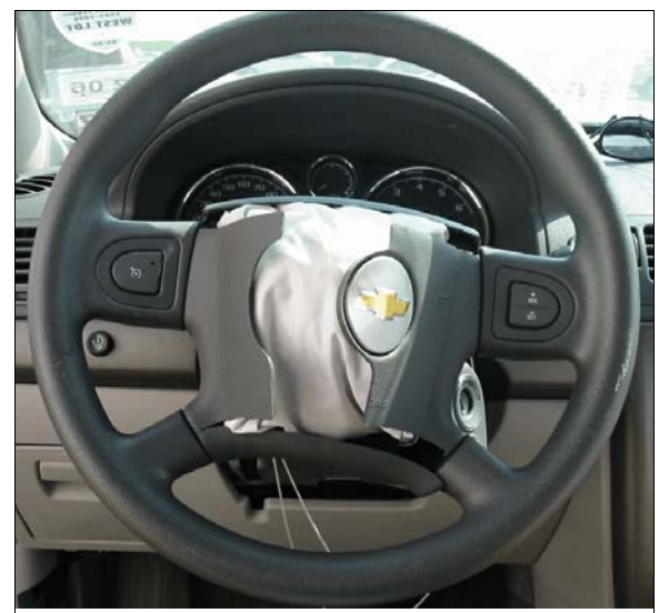
Figure 8: Case vehicle's driver air bag module cover flaps