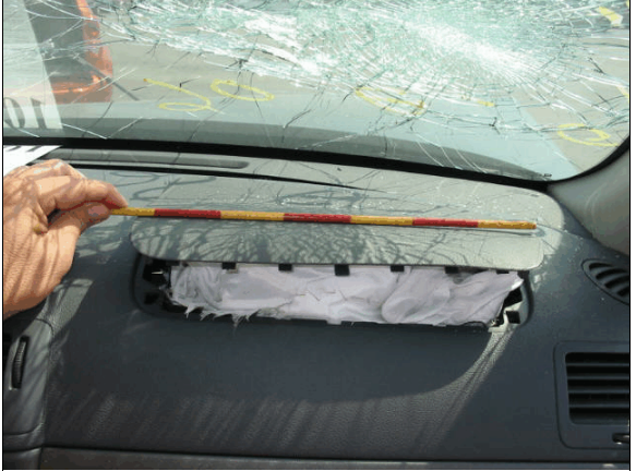
Figure 11: Case vehicle's front right passenger air bag module cover flap

The download of the case vehicle's EDR was done during the vehicle inspection via connection to the diagnostic link connector. The EDR recorded a deployment event. The EDR reports are presented at the end of this report ( Figures 13-18 ). The System Status at Deployment report shows the SIR warning lamp was recorded as off, the driver's and front right passenger's seat belt switch circuit were recorded