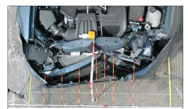
Figure 7: Top view of crush to case vehicle's front bumper bar, each increment on rods is 5 cm (2in)

The case vehicle's recommended tire size was: P195/60R15, and the vehicle was equipped with tires of this size. The case vehicle's tire data are shown in the table below.