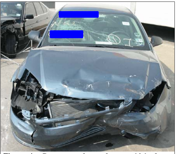
Figure 4: Damage to front of case vehicle from impact with Kia