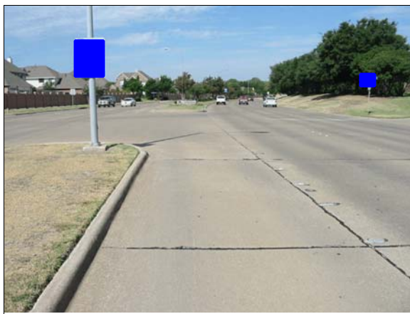
Figure 2: Approach of Kia westbound to intersection in left turn lane

turn. The case vehicle's driver stated she steered right and braked in an attempt to avoid the crash. The crash occurred in the intersection (Figure 3).