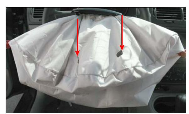
Figure 10: Case vehicle driver's air bag vent ports (arrows)