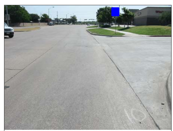
Figure 3: Approach of case vehicle into intersection to area of impact, vehicle on left is following likely approach path of the Kia to impact