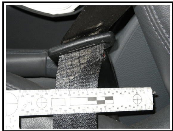
Figure 10. Close-up - evidence of occupant loading to driver's seat belt

The 20-year-old male driver appears to have been seated in an upright posture in the leather covered bucket seat and was restrained by the available 3-point manual lap and shoulder belt. The shoulder belt anchorage was in the full up position. The seat was adjusted to the forward most track position. The seat back was reclined at a 63 degree angle and the seat bottom had a 14 degree angle. During the initial impact, the driver's front air bag deployed and his safety belt pretensioner actuated. The male driver initiated a forward and slightly lateral trajectory towards the 11 o'clock direction of force, leaving occupant load marks on the seat belt webbing. The case vehicle rotated clockwise from the impact and came to final rest still in the intersection, facing northwest. This driver was not injured and did not receive any medical treatment at the scene.