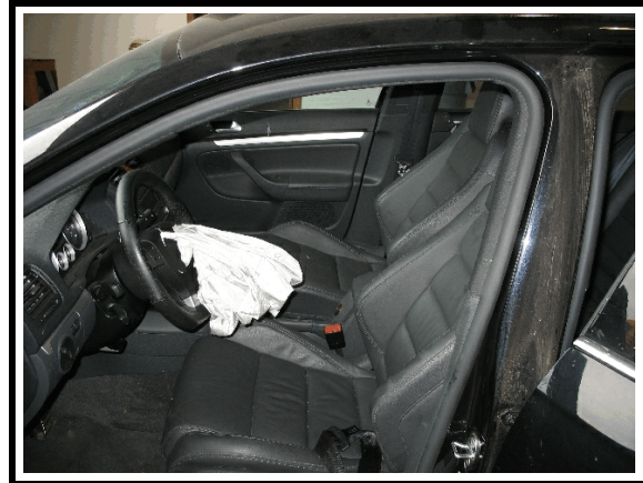
Figure 6. Driver's seating area

The driver's B pillar seat belt pretensioner actuated during the collision and was locked in place post-crash. There was evidence of occupant loading to the driver's seat belt, located 35.0 cm (13.8 in) from the belt's stop button and 78.0 cm (30.7 in) from the D ring. The second row outboard seating positions were equipped with seat belt retractor pretensioners that actuated during the collision and were locked in place post-crash.