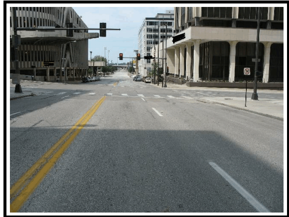
Figure 3. Approach of other vehicle to intersection (north)