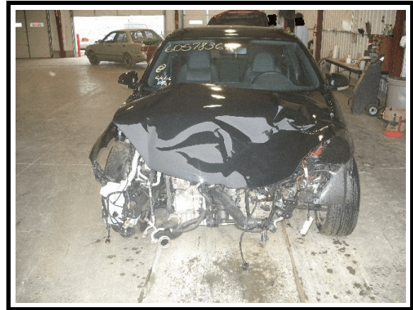
Figure 1. Front - 2006 Volkswagen Jetta

This CAC case was identified by SCI. DSI personnel located and obtained permission to inspect the case vehicle on June 28, 2006. NHTSA assigned the case on June 29, 2006. Field work was completed on July 10, 2006.