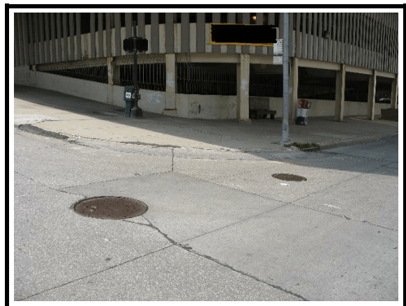
Figure 4. General rollover location - 1998 Mercury Mountaineer (northwest)