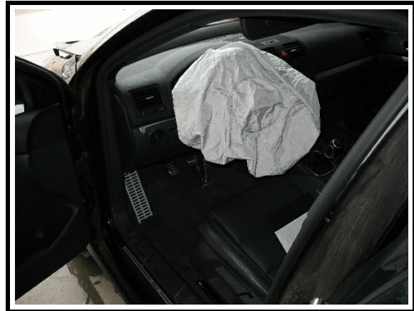
Figure 8. Driver’s front air bag

The driver’s air bag was mounted in the center of the steering wheel hub. The air bag module cover flaps had an ‘n’ configuration. The top cover flap was semi-circular in shape and measured 12.0 cm (4.7 in) in width along the upper edge, 6.0 cm (2.4 in) along the lower edge and 3.5 cm (1.4 in) along both sides. The left and right cover flap measurements were as follows: the inner flap edge heights were 7.0 cm (2.8 in), the upper flap edges were 3.5 cm (1.4 in) and the lower flap edges were 2.5 cm (1.0 in). The bottom cover flap measured 6.0 cm (2.4 in) wide and was 11.0 cm (4.3 in) tall. The air bag was circular in shape and measured 50.0 cm (19.7 in) high/wide in its deflated state. The center stitching measured 17.0 cm (6.7 in) in diameter. The air bag had one vent port on the back of the bag at the 12 o’clock position that measured 6.5 cm (2.6 in) in diameter. The material surrounding the vent port was blackened, with the darkened area more pronounced on the left side of the vent port. The air bag was not damaged and showed no sign of occupant contact.