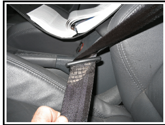
Figure 7. Evidence of occupant loading to driver's seat belt

The 2006 Volkswagen Jetta was configured with manual 3-point lap and shoulder belts for each of the five seating positions. Both front seat belts were equipped with B-pillar pretensioners with load limiters and seat belt height adjusters. The driver's pretensioner actuated during the crash. The right front seat belt pretensioner did not actuate as there was no occupant seated in that position. The driver's seat belt height adjuster was in the full up position and the right front adjuster was in the center position. The driver's safety belt was configured with a sliding latch plate and an emergency locking retractor (ELR). The right front safety belt had a sliding latch plate and a switchable ELR/Automatic Locking Retractor. The second row seating positions were not equipped with seat belt anchorage adjustments. The outboard positions in the second row were equipped with seat belt retractor pretensioners. All three safety belts had sliding latch plates and switchable retractors.