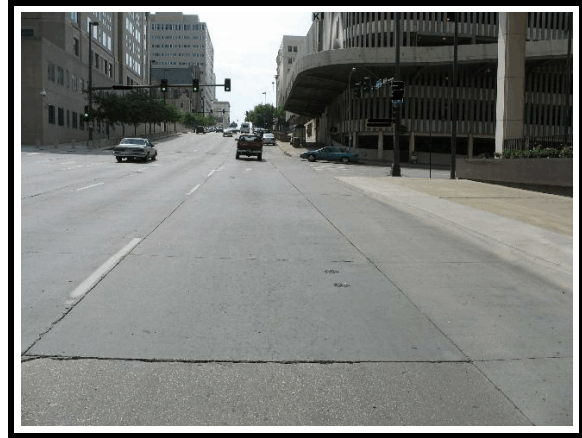
Figure 2. Approach of case vehicle to intersection (west)

The front of the Volkswagen Jetta (11FDEW1) struck the right side of the Mercury Mountaineer. The impact severity was moderate and resulted in the deployment of the Jetta's driver side front air bag. The barrier equivalent routine of the WinSmash program computed a total delta V of 19.0 km/h (11.8 mph). The longitudinal and lateral components were -16.5 km/h (-10.3 mph) and 9.5 km/h (5.9 mph), respectively. The Mountaineer was pushed laterally from the impact and began to rollover to the left while still within the intersection. According to the police report, the Mountaineer rolled over a total of eight quarter turns and came to final rest on its tires, partially off the roadway at the northwest corner of the intersection, facing northwest. After the initial impact, the Jetta rotated clockwise and came to final rest still in the intersection, facing northwest.