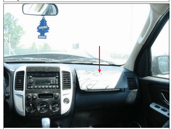
Figure 8: Case vehicle's center and right instrument panel, arrow shows front right passenger air bag module cover flap