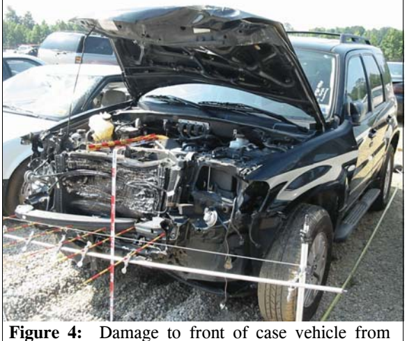
impact with the Saturn, increments on vertical scale in tenths of meter