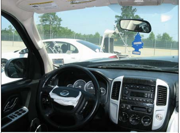
Figure 7: Case vehicle's steering wheel, instrument panel and windshield

Damage Classification: Based on the vehicle inspection, the CDC for the case vehicle was determined to be 10-FYEW-2 ( 300 degrees). The WinSMASH reconstruction program damage algorithm was initially used to reconstruct the case vehicle's Delta Vs. However, the results were unreasonably low. This was due to the small amount of bumper crush sustained by the Saturn as a result of the impact occurring at the front right corner. During the impact, the Saturn's right front wheel was primarily engaged with little engagement of the front bumper bar. Therefore, the WinSMASH missing vehicle algorithm was used and the Saturn was treated as the missing vehicle. The missing vehicle run improved the