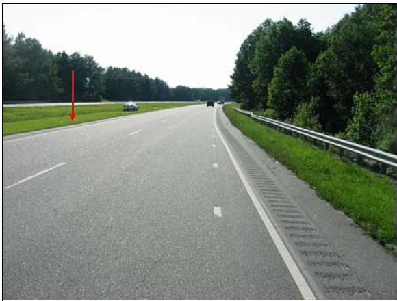
Figure 2: Approach of Saturn westbound in outside lane and overview of impact area in foreground, arrow shows area where case vehicle entered westbound lanes

315 degrees prior to the impact. It is not known if the case vehicle's driver took any actions to avoid the crash with the Saturn.