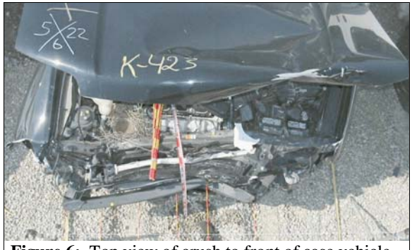
Figure 6: Top view of crush to front of case vehicle, each increment on the measurement rods is 5 cm (2 in)

Exterior Damage: The case vehicle's impact with the Saturn involved the front end. The front bumper, grill, and hood were directly damaged and crushed rearward and to the right. The direct damage began at the front left bumper bar corner and extended 104 centimeters (40.9 inches) across the front end. The bumper fascia and grille were missing. Crush measurements were taken at the bumper bar, and the maximum residual crush was measured as 24 centimeters (9.5 inches) occurring at C_2 ( Figure 6 ). The table below shows the case vehicle's front crush profile.