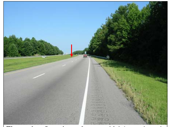
Figure 1: Overview of case vehicle's eastbound approach roadway, arrow shows area of onset of case vehicle's yaw mark furrows in median

Pre-Crash: The case vehicle was eastbound in an unknown lane (Figure 1). The Saturn was westbound in the outside westbound lane (Figure 2 below). Both drivers were intending to continue straight ahead. The evidence indicated that the case vehicle most likely initially departed the south side of the roadway. The driver steered left to reenter the roadway, and the case vehicle began to rotate counterclockwise across the roadway on the wet pavement. The case vehicle departed the roadway (Figure 3 below), crossed the median and entered the westbound lanes as it continued to rotate counterclockwise. The crash occurred in the outside westbound lane. The case vehicle rotated counterclockwise a total of approximately