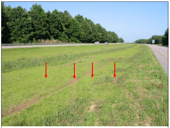
Figure 3: Case vehicle's yaw mark furrows in median, arrows show yaw marks, marks are from left to right: left front, right front, left rear and right rear