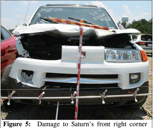
Figure 5: Damage to Saturn's front right corner from impact with case vehicle, deformations at middle of hood are not crash related, hood was pried open

Crash: The case vehicle's front left ( Figure 4 ) impacted the Saturn's front right ( Figure 5 ) causing the case vehicle's driver and front right passenger air bags to deploy. The crash also caused the Saturn's driver and front right passenger air bags to deploy.