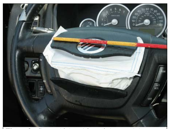
Figure 9: Case vehicle's driver air bag module cover flaps

The case vehicle's driver air bag was located in the steering wheel hub. The air bag module was constructed with "H"-configuration cover flaps ( Figure 9 ) constructed of pliable vinyl. The upper cover flap was constructed with the manufacturer's logo in the middle, which created a rounded contour at the horizontal tear seat. This contour fit into a rounded cut-out in the lower cover flap. The upper cover flap's overall dimensions were 15 centimeters (5.9 inches) in width and 9 centimeters (3.5 inches) in height. The lower cover flap's dimension's were 15 centimeters (5.9 inches) in width and 3 centimeters (1.2 inches) in height at the middle