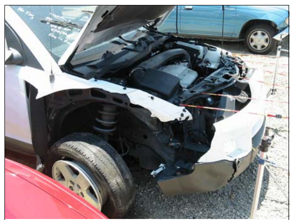
Figure 14: Right side view of damage to Saturn's front bumper, right fender and right front wheel due to impact with front of case vehicle

Exterior Damage: The Saturn's impact with the case vehicle involved the front right corner of the vehicle. The right portion of the front bumper fascia, right headlamp/turn signal assembly, fog lamp, grille, hood and right fender were directly contacted and crushed rearward. In addition, the plastic right fender was broken. Due to the length of the front bumper bar, it was minimally engaged. The primary engagement occurred to the right front wheel (Figure 14), which was crushed rearward 13 centimeters (5.1 inches). The direct damage began at the front right bumper corner and extended 29 centimeters (11.4 inches) across the front bumper. Crush measurements were taken at the bumper level and the radiator frame level. The maximum residual crush at the