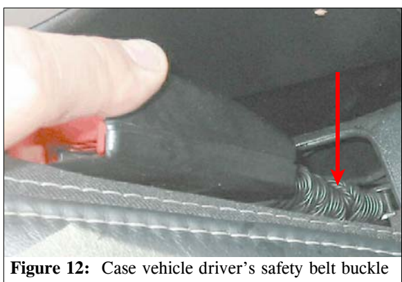
stalk, arrow shows retracted buckle stalk due to activation of the pretensioner

kilograms (160 pounds)] was most likely seated in a nominal upright driving position. She most likely had both hands on the steering wheel. The position of her feet is not known at this time. At the time of the case vehicle inspection, the driver's seat track was adjusted to its middle position, and the seat back was slightly reclined. The tilt steering wheel was located in its center position.