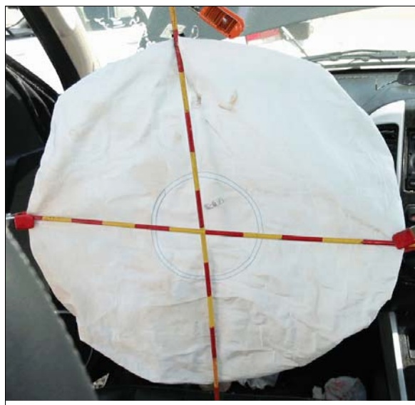
Figure 10: Case vehicle's driver air bag

and 5 centimeters (2 inches) in height on each side. An inspection of the air bag module cover flaps and the air bag fabric revealed that the cover flaps opened at the designated tear points. There was no evidence of damage during the deployment to the air bag module cover flaps or the air bag fabric. The deployed driver's air bag ( Figure 10 ) was round with a diameter of approximately 54 centimeters (21.3 inches). The air bag was designed with two tether straps, each approximately 10 centimeters (3.9 inches) in width and had two vent ports, each 3 centimeters (1.2 inches) in diameter, located at the 3 and 9 o'clock positions. The distance between the mid-center of the driver's seat back, as positioned at the vehicle inspection (seat track in middle position, seat back slightly reclined), and the air bag at approximate full excursion was 35 centimeters (13.8 inches). Inspection of the driver's air bag revealed a possible make-up scuff on the top right quadrant of the air bag. In addition, there were a few dark scuffs, possibly related to deployment, and an area of discoloration on the left portion of the air bag that appeared to be a liquid stain.