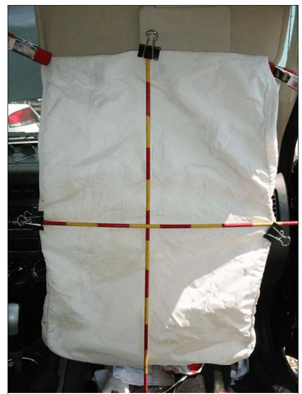
Figure 11: Case vehicle's front right passenger air bag