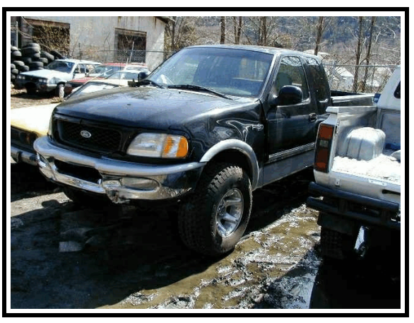
Figure 1 . Front/Left - 1997 Ford F150 SuperCab

This remote investigation focused on an alleged air bag fatality in a 1997 Ford F150 SuperCab pickup truck. This single vehicle crash occurred in March 2002 at 1030 hours in a sparsely populated, mountainous area of Washington. The case vehicle was a 1997 Ford F-series pickup truck being driven by a restrained driver of an unknown sex and age. There were three additional occupants in the vehicle, including a 4-year-old male passenger in the front center seat. The Ford F150 was traveling east in lane one on a three lane, two-way highway with no traffic controls. The roads were icy and it was snowing. For unknown reasons, the driver lost control of the pickup, and the vehicle traveled across lanes two and three, departed the north