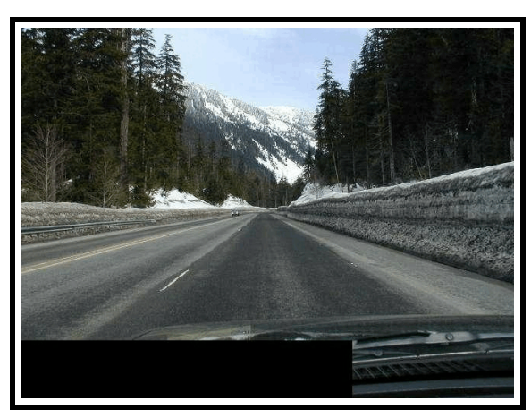
Figure 2. Approach of case vehicle (east)

The 1997 Ford F150 SuperCab was being driven by a restrained driver of an unknown sex and age. There were three other passengers in the vehicle. The front center seat was occupied by a restrained 4-year-old male (109 cm/43 in, 23 kg/51 lbs), the front right seat was occupied by a restrained occupant of an unknown sex and age and the second row left seat was occupied by a restrained occupant of an unknown sex and age. The Ford F150 was traveling east in lane one of the three lane, two-way highway, and had no traffic controls. There was no cargo in the bed of the pickup truck and the left rear tire was found