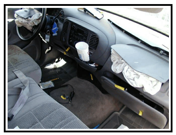
Figure 6 . Damage/Occupant contacts to the instrument panel

There was a scuff to the driver's knee bolster due to occupant contact. The center section of the instrument panel was deformed and the rearview mirror was broken off its base. A cup holder mounted in the center of the instrument panel appeared to have been moved and the cup in the holder was deformed, but this may have occurred post-impact. The right A pillar and glove compartment door were scuffed and the right instrument panel was cracked, most likely due to occupant contact. The back of the driver's