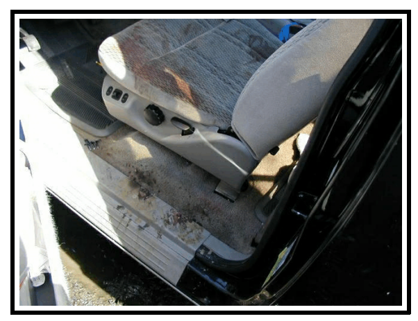
Figure 8 . Blood in driver's area - from fatally injured front center occupant