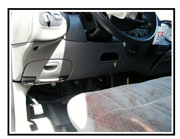
Figure 14 . Possible driver contact to knee bolster

The driver of the case vehicle was seated on the fabric covered split bench seat with separate back cushions and was restrained by the 3-point manual lap and shoulder belt. The shoulder belt anchorage was in the full down position, the seat back was slightly reclined, and the seat track was adjusted to the middle track position. The case vehicle was traveling on an icy roadway with snowy weather conditions. For unknown reasons, the driver lost control of the Ford F150 and the case vehicle began moving to its left, traveled onto the shoulder of the highway, and impacted a snowbank with its front end. At impact, the driver's front air bag deployed. The driver initiated a forward trajectory towards the 1 o'clock direction of force and likely loaded the safety belt and engaged the deployed front air bag with his/her face. The driver's right knee likely contacted the left knee bolster, leaving a scuff. The Ford F150 came to final rest facing northeast near the point of impact. It is not known if the driver was injured or if he/she received any medical treatment. The bloodstains found on the driver's air bag, left front seat back and seat cushion and left sill area likely occurred post-impact and were from the front center occupant who was fatally injured in the collision.