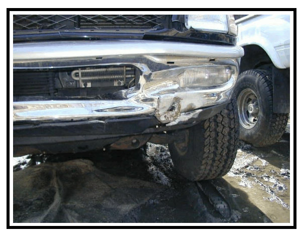
Figure 5 . Closer view of damage to left front bumper