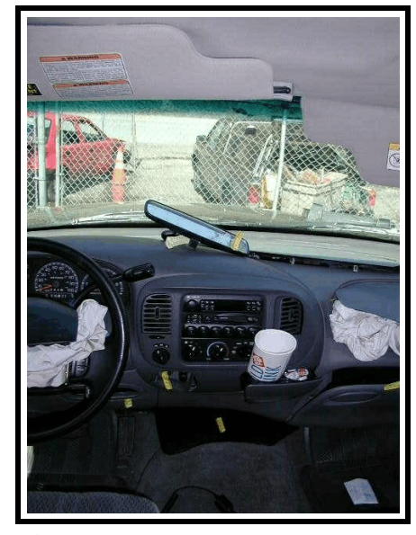
Figure 7 . Damage/Occupant contacts - center instrument panel

integral head restraint was deformed due to contact from the second row left seat passenger. There was blood found on the driver and passenger air bags, the front row center lap belt, the left and center front row seat backs and seat cushions, as well as the left sill area. There was no intrusion and no integrity loss. The three side doors remained closed and operational. The windshield was in place, but was cracked on the right side due to occupant contact. There was no other glazing damage.