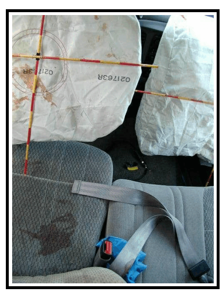
Figure 13. View of front center seat in relation to the deployed driver and passenger air bags