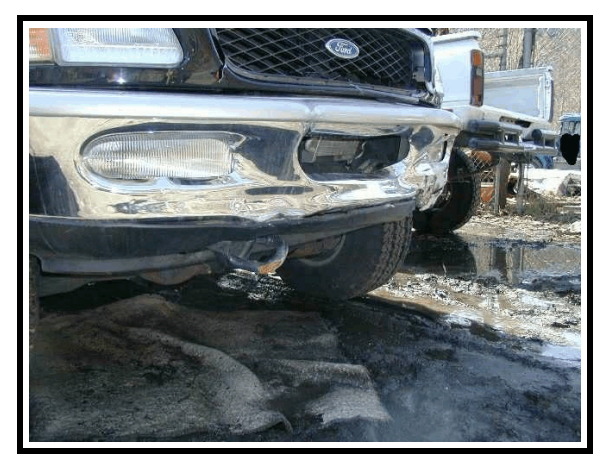
Figure 4 . Closer view of damage to right front bumper