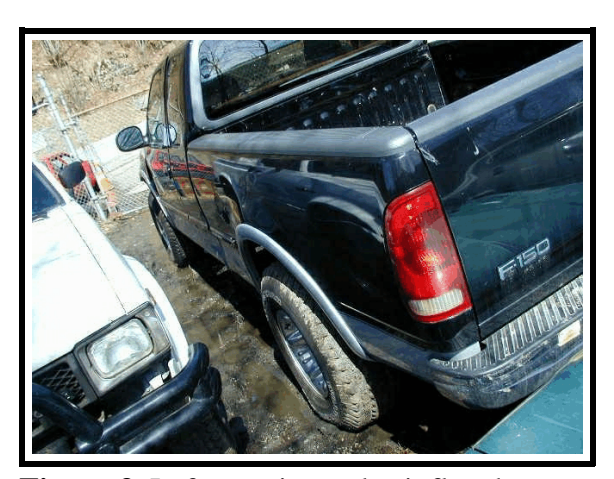
Figure 3 . Left rear tire under-inflated at inspection

The front row seating in the 1997 Ford F150 was configured as a fabric covered split bench with separate back cushions. The front center seat back can also be folded forward in order to be used as a center armrest. The outboard seats were equipped with integral head restraints that were not damaged. The second row was configured as a fabric covered bench seat. The second row outboard seating positions were equipped with adjustable head restraints that were not damaged. The front and second row center seating positions were not equipped with head restraints.