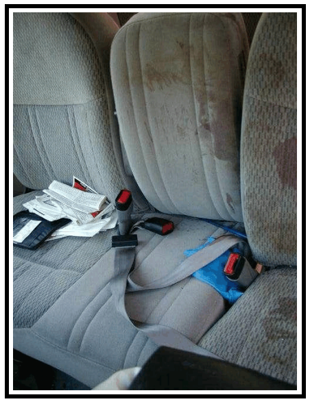
Figure 9. Front center lap belt

The 1997 Ford F150 was configured with manual 3-point lap and shoulder belts with sliding latchplates for the first and second row outboard seating positions. The center seating positions in both rows were equipped with manual lap belts and locking latchplates. The left front seat belt was equipped with a seat belt height adjuster that was in the full down position. The right front passenger's seat belt and the two second row lap and shoulder belts were not equipped with anchorage adjustments. The driver's seat belt was equipped with an Emergency Locking Retractor (ELR). The front right and second row outboard seat belts had switchable ELR/Automatic Locking Retractors that were in the ELR mode. The two center seat lap belts were not equipped with retractors.