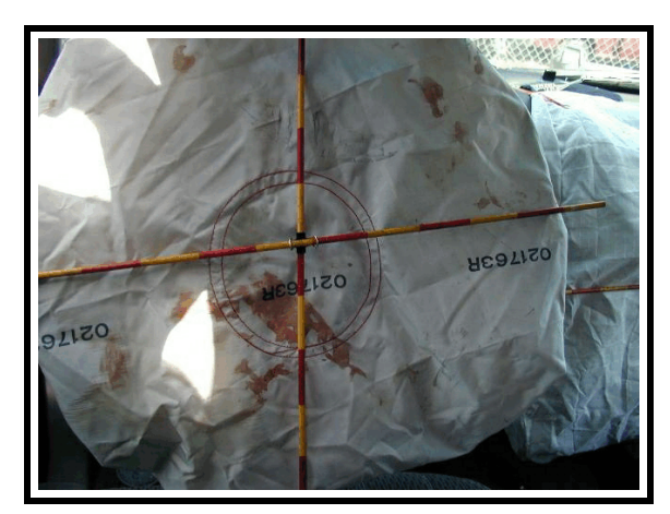
Figure 10. Driver air bag

The driver's air bag was mounted in the center of the steering wheel hub. The driver's tilt steering wheel was set between the center and full down tilt positions. The air bag module had an H configuration. The top flap measured 20.0 cm (7.9 in) wide by 20.0 cm (7.9 in) high. The