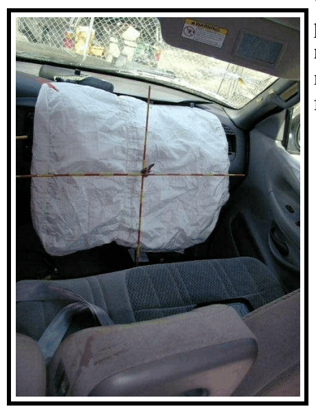
Figure 11. Front passenger air bag

60.0 cm (23.6 in) high. There were black streaks located on the top center portion of both the front and back of the air bag. There was a dot of blood on the back left section of the bag, at the 9 o'clock location. There was one vertical tether located in the left half of the air bag. There