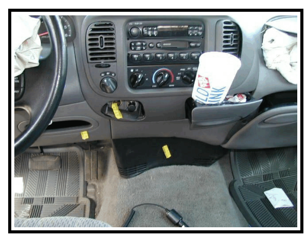
Figure 15 . Possible occupant contacts - center instrument panel and below