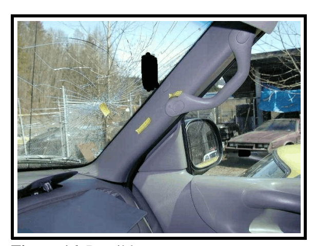
Figure 16 . Possible occupant contacts to windshield and right A pillar

This passenger initiated a forward trajectory toward the 12 o'clock direction of force and likely loaded the safety belt and engaged the deployed passenger air bag with his/her face. This occupant's knees appear to have contacted the glove compartment door, leaving scuffs. This occupant's right hand and wrist appear to have been pushed upward due to the deploying