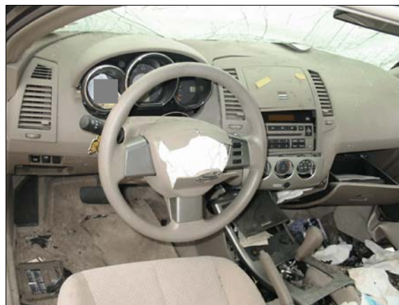
Figure 8: Overview of case vehicle's steering wheel and instrument panel

Damage Classification: Based on the vehicle inspection, the CDC for the case was determined to be: 12-FDEW-4 (10 degrees) . The WinSMASH reconstruction program, missing vehicle algorithm, was used to reconstruct the case vehicle's Delta Vs. The Total, Longitudinal, and Lateral Delta Vs are, respectively: 61 km.p.h. (37.9 m.p.h.), -60.1 km.p.h. (-37.3 m.p.h.), and -10.6 km.p.h. (6.6 m.p.h.). This was a borderline reconstruction and the results appear reasonable. The case vehicle was towed due to damage.