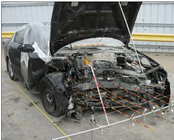
Figure 4: Front right view of damage to front of case vehicle from impact with the Honda, each increment on vertical scale is tenth of meter, each increment on rods in 5cm (2 in)