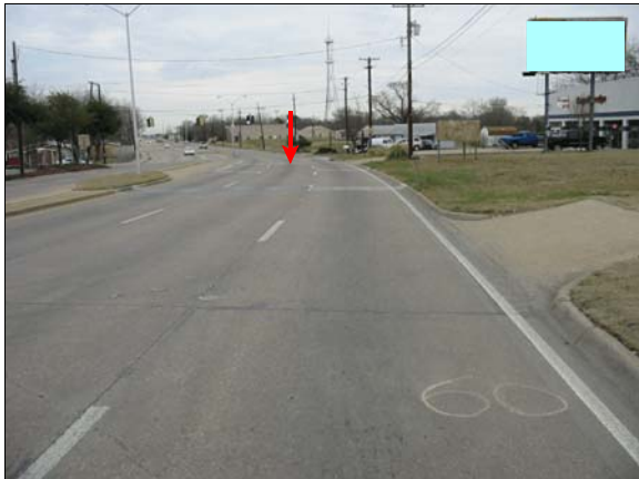
Figure 2: Approach of Honda eastbound to impact (arrow)