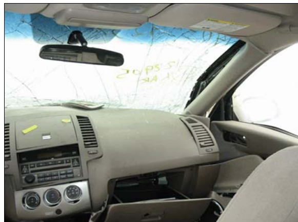
Figure 11: Overview of right instrument panel, front passenger air bag located in top of instrument panel