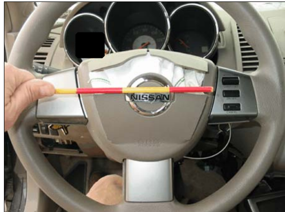
Figure 9: Case vehicle's driver air bag module cover flaps