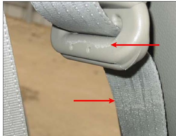
Figure 12: Arrows show load abrasions on case vehicle driver's D-ring and shoulder belt

Based on the vehicle inspection, the case vehicle's driver was restrained by his manual, three-point, lap-and-shoulder safety belt system. Inspection of the driver's safety belt assembly revealed load abrasions on the D-ring and shoulder belt ( Figure 12 ). In addition, the pretensioner had actuated and the retractor was jammed with a length of belt extended out of the retractor.