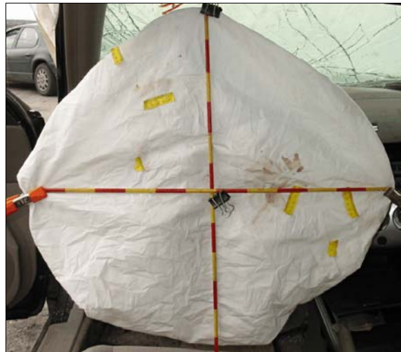
Figure 10: Case vehicle's driver air bag, yellow tape shows blood stains on air bag