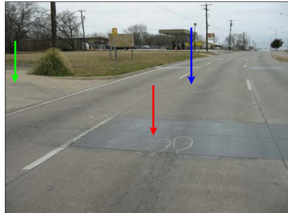
Figure 3: View southwest from case vehicle's approach to impact area (red arrow), green arrow shows area of final rest of case vehicle, blue arrow shows area of final rest of Honda