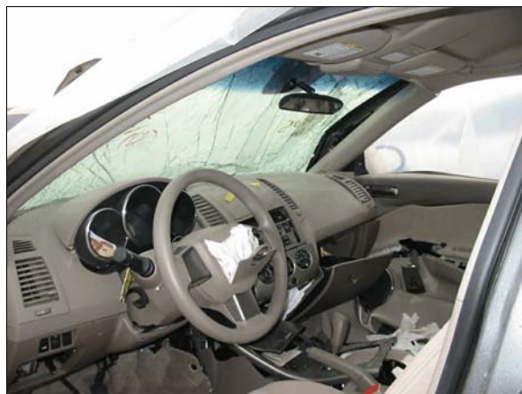
Figure 7: Overview of case vehicle's steering wheel, instrument panel and windshield

Vehicle Interior: Inspection of the case vehicle's interior ( Figures 7 and 8 ) revealed evidence of occupant contact to the driver's air bag and safety belt. There was no deformation of the steering wheel but the steering column appeared to be slightly compressed. There were numerous intrusions to the passenger compartment. The most severe intrusions involved 31 centimeters (12.2 inches) of longitudinal intrusion to the side panel forward of the right "A"-pillar and 21 centimeters (8.3 inches) of longitudinal intrusion of the right toe pan.