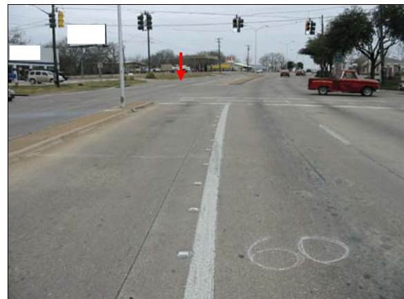
Figure 1: Approach of case vehicle westbound to impact (arrow), number shows meters to impact

Pre-Crash: The case vehicle was traveling west in an undetermined lane of the westbound roadway ( Figure 1 ). It is not known if the driver was intending to continue through the right curve and the intersection, or if he was going to turn at the intersection. The Honda was traveling east in the center through lane ( Figure 2 below). The Honda's driver was intending to continue through the left curve to the intersection. The police crash report indicated that as the case vehicle approached the intersection, the driver experienced a seizure and lost control of his vehicle. It drifted in a southwest direction, through the intersection and into the eastbound lanes of traffic. Due to the seizure, the driver most likely took no actions to avoid the cash. The crash occurred in the center eastbound through lane of the roadway ( Figure 3 below).