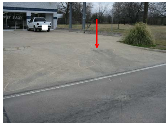
Figure 5: View southwest to area of case vehicle's final rest (arrow)

Post-Crash: As a result of the impact, the case vehicle rotated clockwise and continued southwest and came to rest in a driveway to a local business ( Figures 3 and 5 ) heading northeast. The Honda, most likely braking at the time of the crash, was moved westward and rotated clockwise approximately 170 degrees and came to a final rest in the center lane heading west ( Figure 3 ).