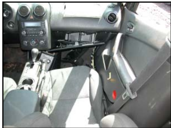
Figure 6: View of the front right interior.

The interior damage of the Pontiac G6 consisted of right interior intrusion as a result of the exterior impact force and the deployment of the vehicle's frontal air bag system. Figure 6 is a view depicting the intrusion in the front right interior. The right front door and right B-pillar were in contact with the front passenger seat and the seat cushion was compressed into the center console. The residual lateral intrusion at the right front seat bight measured 22 cm (8.5 in). The lateral intrusion in the right foot well measured 21 cm (8.2 in). The right upper B-pillar intrusion measured at belt line was 6 cm (2.5 in).