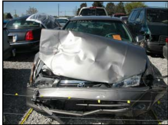
Figure 5: Front view of the Toyota.

Figure 5 is a front view of the subject Toyota Camry. The exterior damage to vehicle consisted of direct contact damage to the frontal plane that extended across its full 155 cm (61.0 in) end width. The residual crush profile was documented across the front bumper and was as follows: C1 = 19 cm (7.5 in), C2 = 17 cm (6.7 in), C3 = 18 cm (7.1 in), C4 = 20 cm (7.9 in), C5 = 23 cm (9.1 in), C6 = 26 cm (10.2 in). The maximum crush was located at C6, the front right bumper corner. The residual damage profile was biased to the left consistent with the angular orientation of the vehicles during engagement. The deformation energy was absorbed primarily by the vehicle's structures forward of the front axle location. The right wheelbase was reduced 3 cm (1.0 in). The left wheelbase was unchanged. The windshield and all side glazings remained intact. All four doors remained closed during the impact and were operational post-crash. The Collision Deformation Classification (CDC) of the vehicle was 11-FDEW2.