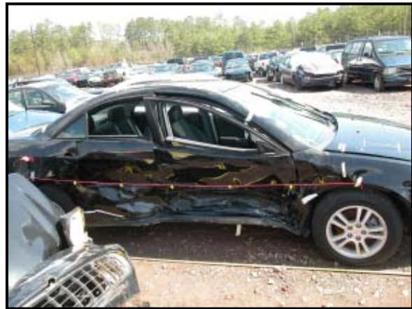
Figure 4: View of the right side damage.

The right side of the Pontiac sustained 237 cm (93.5 in) of direct and induced damage which began 3 cm (1.2 in) aft the right front axle, Figure 4 . The direct damage began immediately rearward of the right front wheel opening and measured 162 cm (63.6 in) in length. The residual crush was measured at the mid-door elevation. The crush profile was as follows: C1 = 0 cm (0 in), C2 = 10 cm (3.9 in), C3 = 26 cm (10.2 in), C4 = 31 cm (12.2 in), C5 = 17 cm (6.7 in), C6 = 0 cm (0 in). The maximum crush was located at the C4 mid door elevation, 93 cm (36.5 in) aft of the right front axle. The maximum crush was 31 cm (12.2 in). The right doors were jammed shut. The left doors remained closed during the crash and were operational at the time of the inspection. The right wheelbase was reduced 5 cm (1.9 in). The left wheelbase lengthened 1 cm (0.5 in) due to distortion in the vehicle's unibody construction. The right aspect of the windshield fractured and the glazing of the right windows disintegrated during the impact. The Collision Deformation Classification (CDC) of the Pontiac was 02-RYEW3. The Pontiac's Event Data Recorder measured and recorded bi-directional acceleration. The maximum longitudinal and lateral delta V components were -13.0 km/h (-8.1 mph) and -30.6 km/h (-19.0 mph).