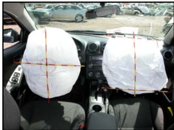
Figure 7: View of the deployed air bags.

The driver and front right passenger air bag deployed as a result of the angular crash event, Figure 7 . The driver air bag was housed within an I-configuration module designed into the center hub of the steering wheel. The diameter of the deployed air bag measured 58 cm (23 in). It was tethered by two straps and vented by a single 3 cm (1.2 in) diameter port on the back side of the bag's 12 o'clock sector. No evidence of occupant contact was identified on the driver air bag or its associated components.