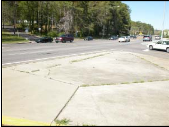
Figure 2: Northeast view into the intersection.