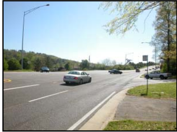
Figure 3: Southwest view of the intersection.