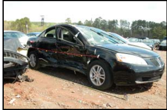
Figure 1: Right front view of the Pontiac G6.

This on-site investigative effort focused on the performance of the Certified Advanced 208-Compliant safety system in a 2006 Pontiac G6, Figure 1 . A CAC vehicle is certified by the manufacturer to be compliant to Advanced Air Bag portion of Federal Motor Vehicle Safety Standard (FMVSS 208). This advanced occupant protection system was comprised of dual-stage frontal air bags, seat track position sensors for both front seats, front safety belt buckle switches and a front right occupant detection sensor. The vehicle's Sensing and Diagnostic control Module (SDM) tailored the deployment of the frontal air bags based the crash severity and inputs from these sensors. The Pontiac was not equipped with inflatable side impact protection.