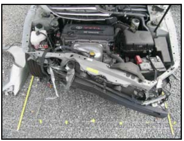
Figure 5: Overhead view of the Camry depicting the extent of crush.

The interior damage to the Toyota was limited to the deployment of the vehicle's safety systems. There was no intrusion or interior damage related to the exterior force of the crash. There was no residual evidence of occupant contact to the hard structures of the interior. Figures 6 and 7 are the left and right interior views of the vehicle, respectively.