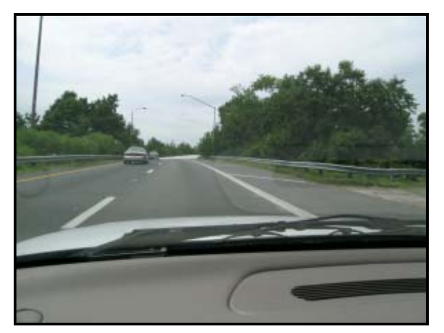
Figure 2: Trajectory view of the Toyota.