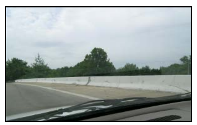
Figure 3: Area of the impact.