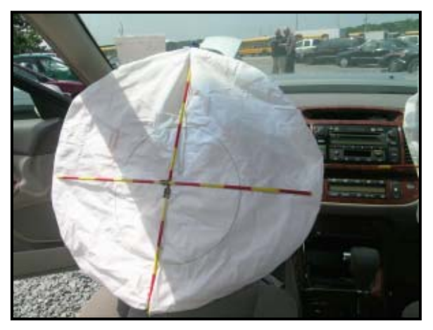
Figure 9: Deployed driver air bag.

oriented, red lipstick transfer was identified in the 10 o'clock sector of the air bag. The transfer was located 19 cm (7.3 in) left of the vertical centerline of the air bag and 11 cm (4.5 in) above the bag's horizontal centerline. The orientation and position of the transfer was consistent with a 90 degree clockwise (right) rotation of the steering wheel at the time of the air bag inflation and occupant contact. This steering maneuver was consistent with the reconstruction of the crash dynamics.