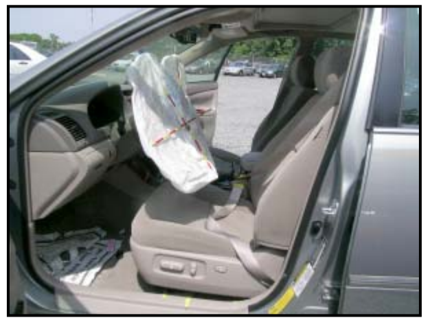
Figure 6: Left interior view.

The front right passenger seat was located in a mid-track position 13 cm (5.3 in) forward of full rear. The total seat track travel measured 25 cm (9.5 in). The seat back angle measured 25 degrees aft of vertical. This angle was measured 41 cm (16 in) above the seat bight. The antisubmarine angle of the seat cushion measured 15 degrees. The horizontal distance from the seat back to the rearmost protrusion of the instrument panel measured 66 cm (26 in). The horizontal distance from the seat back to the aft edge of the front passenger air bag module measured 80 cm (31.5 in).