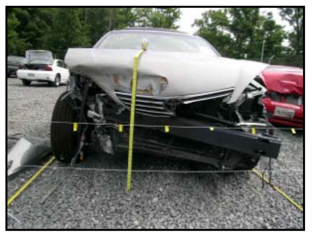
Figure 4: Front view of the Toyota Camry.