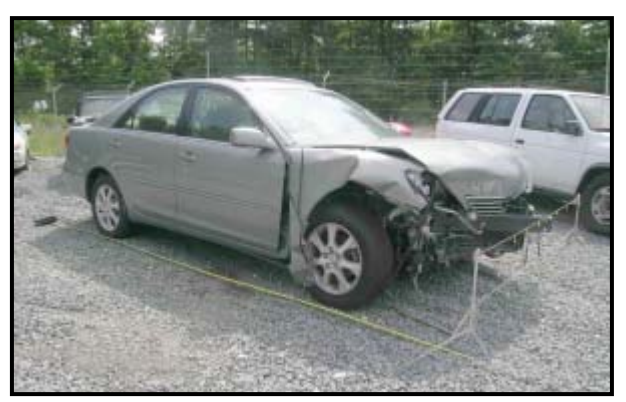
Figure 1: Front right view of the Toyota Camry.

This investigation focused on the performance of the Certified Advanced 208-Compliant (CAC) safety system in a 2005 Toyota Camry, Figure 1, and injury sources for the 49 year old female driver and the 19 year old female front The advanced occupant right passenger. protection system in the Toyota was comprised of dual-stage frontal air bags, front safety belt switch sensors, front seat belt buckle pretensioners, and a front right occupant The manufacturer certified detection sensor. the CAC system met the requirements of the