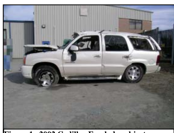
Figure 1. 2002 Cadillac Escalade subject vehicle.

This on-site investigate effort focused on the crash severity, rollover dynamics, and the injury sources that contributed to the death of the 17-year old female front right passenger of a 2002 Cadillac Escalade (Figure 1). The Cadillac was equipped with Stabilitrack, an electronic stability control system, redesigned frontal air bags, and seat back mounted side impact air bags for the driver and front right passenger positions. The Cadillac was involved in a single vehicle rollover crash on an interstate roadway during daylight hours. The air bags did not deploy in this