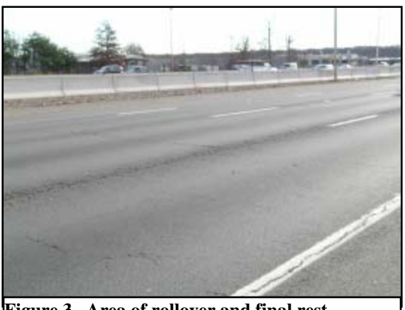
Figure 3. Area of rollover and final rest.

The left side alloy rims contacted the asphalt road surface resulting in a tripped left side leading rollover. The vehicle rolled four-quarter turns and came to rest on the center travel lane facing in a westerly direction ( Figure 3 ). The total distance from the rollover initiation to final rest was approximately 13 meters (40 feet). Due to the passage of time and the heavily traveled interstate roadway, there was no physical evidence remaining at the crash site