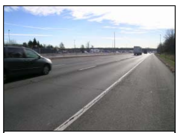
Figure 2. Southbound travel direction of the Cadillac.

The 16-year-old female driver of the Cadillac was operating the vehicle southbound in the center lane (Figure 2) at a police reported speed of 105 km/h (65 mph). The vehicle was also occupied by six teenage females that were seated in the front right, second row, and third row (2/3/2). The driver attempted to change lanes from the center to the left lane. As the vehicle entered the left travel lane, the driver applied a sudden right steering input that resulted in a loss of directional control. The left side tires rolled under the alloy wheels exposing the rims to the asphalt road surface.