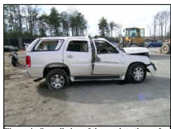
Figure 4. Overall view of the crush to the roof side rail.

The Cadillac sustained moderate severity damage to all four planes as a result of the four quarter-turn rollover event. The area of greatest crush was located along the right roof side rail. The direct contact damage measured 244 cm (96") and extended from the right A-pillar to the right D-pillar. The maximum crush measured 13 cm (5.1") and was located at center of the right front door on the roof side rail. A crush profile was documented along the full length of the roof side rail ( Figure 4 ). The six crush measurements