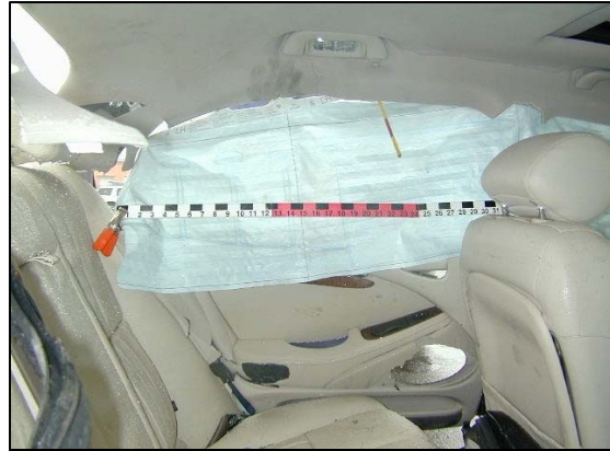
Figure 7 - Rear left Inflatable Curtain (IC)

The investigation revealed no discernable contact evidence on the left side air bags; however, the driver and rear left passenger reported to the CIREN investigator that they had contacted their respective air bags.