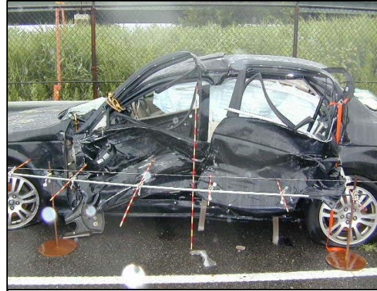
Figure 4 - Damaged left side of the 2003 Jaguar S-Type

ending 12.0 cm (4.7") forward of the left rear axle. Both left side doors were crushed laterally and jammed shut. Induced buckling was present on the front left fender, along the roof, and on the right side doors. The front left and rear left side glazing, and the backlight glazing was shattered due to impact forces. The windshield sustained stress cracking extending across the entire width. The left side window frames were displaced approximately 5.0 cm (2.0") vertically above the roofline. Six crush measurements were documented at the mid-door and were as follows: C1 = 3.0 cm (1.2"), C2 = 12.0 cm (4.7"), C3 = 24.0 cm (9.4"), C4 = 36.0 cm (14.2"), C5 = 10.0 cm (3.9"), C6 = 7.0 cm (2.8"). The Collision Deformation Classification (CDC) for the impact with the 1998 Jeep Cherokee was 10-LYAW-3.