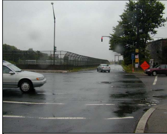
Figure 3 - The southbound approach of the 1998 Jeep Cherokee