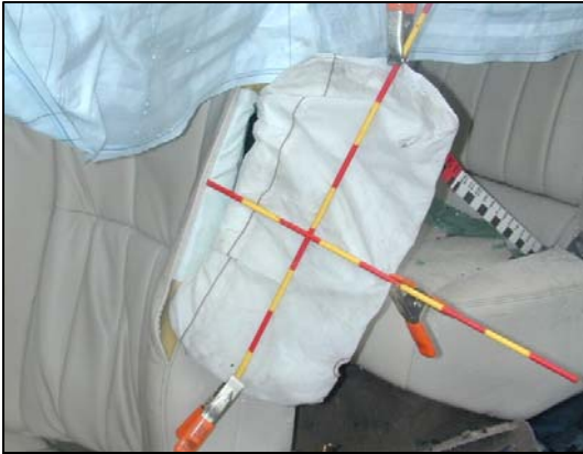
Figure 6 - Driver's seat back air bag.