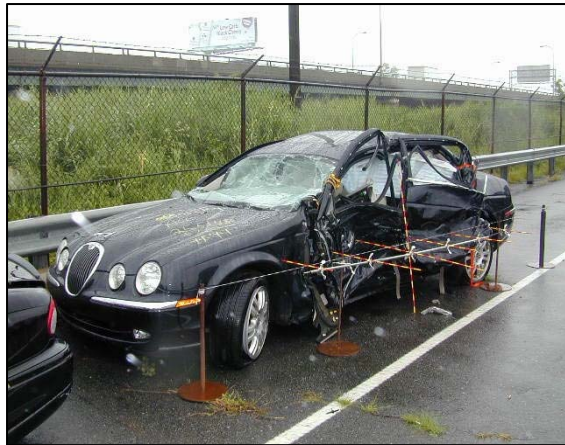
Figure 1 - Damaged 2003 Jaguar S-Type.

This remote investigative effort focused on the performance of the side impact occupant protection system that was present in a 2003 Jaguar S-Type four-door sedan. The Jaguar ( Figure 1 ) was involved in an intersection crash with a 1998 Jeep Cherokee that was sufficient to deploy the Jaguar's side Inflatable Curtain (IC), the driver's seat back air bag, and fire all four outboard seatbelt retractor pretensioners. Five adult passengers occupied the 2003 Jaguar. The vehicle was occupied by a restrained 36-year-old male driver, a restrained 24-year-old female seated in the front right position, a restrained 35-year-old male seated in the