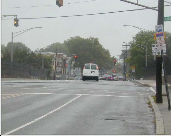
Figure 2 - Eastbound approach for the Jaguar S-Type