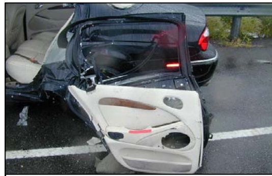
Figure 5 - Interior rear left intruded door

The 2003 Jaguar S-Type sustained moderate interior damage as a result of lateral passenger compartment intrusion ( Figure 5 ). A contact point was present on the armrest of the back left door. As the back left occupant loaded the door panel, it sustained a crack on the plastic trim. Both left side occupants loaded the side air bags and safety belts; however, no discernable contact evidence was present on these components. The front left and rear left doors were jammed shut. Lateral intrusion into the driver's seating position included the front left door, left A- and B- pillars, and the left sill. The front left seat was compressed slightly by the intrusion of the driver's door. Lateral intrusion into the back left passenger's seating position included the back left door, back left sill, the back left roof-side-rail, and the C- pillar. The back left seat was compressed slightly due to the lateral intrusion of the left door panel. The extent of the intrusion of these components is documented in the table that follows: