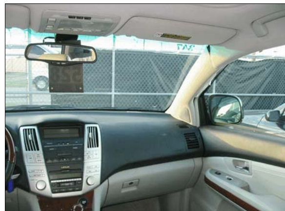
Figure 14: Case vehicle's front right air bag located in middle of instrument panel above glove box door

The case vehicle was equipped with a certified advanced 208-compliant air bag system. The case vehicle's driver air bag was located in the steering wheel hub. The driver knee air bag was located in the lower left instrument panel, and the front right passenger air bag was located in the middle of the instrument panel, above the glove box door (Figure 14). The driver's air bag and knee air bag did not deploy because there was no frontal impact, and the longitudinal deceleration due to the right side impact was not severe enough to require a deployment. The front right air bag and front right seat back-mounted side impact air bag did not deploy because the occupant weight sensor in the front right seat determined no occupant was on the seat and suppressed the deployment of the air bags.