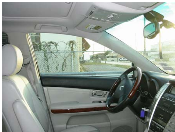
Figure 11: Overview of case vehicle’s driver seating area

Interior Damage: Inspection of the case vehicle’s interior revealed no evidence of occupant contacts to any interior surfaces or components. No intrusion of the passenger compartment was observed ( Figures 11 and 12 ). There was also no evidence of compression of the energy absorbing steering column and no deformation of the steering wheel rim ( Figure 13 below).