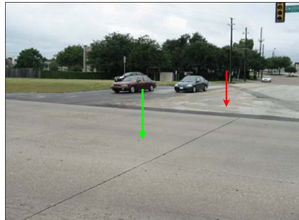
Figure 7: View southwest to area of final rest of case vehicle (red arrow) and Nissan (green arrow)