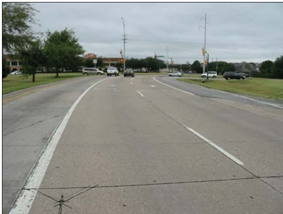
Figure 2: Approach of Nissan to the intersection, southbound in the inside through-lane

Pre-Crash: The case vehicle was westbound in the outside lane and was stopped for the traffic signal at the intersection ( Figure 1 above). The Nissan was traveling southbound in the left, inside through lane approaching the intersection ( Figure 2 ), and the driver was intending to continue southbound through the intersection. The case vehicle's driver stated he did not see the approaching Nissan and took no avoidance actions. The crash occurred within the intersection of the two trafficways ( Figure 3 ).