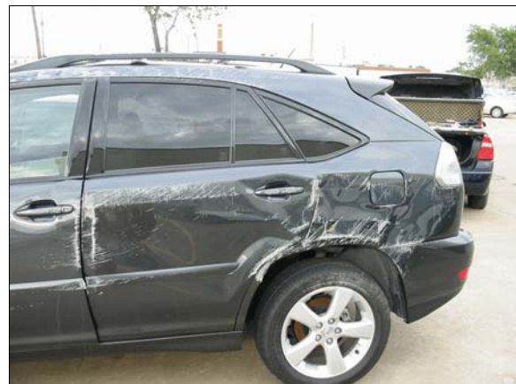
Figure 10: Rollover damage to back half of the left side of the case vehicle