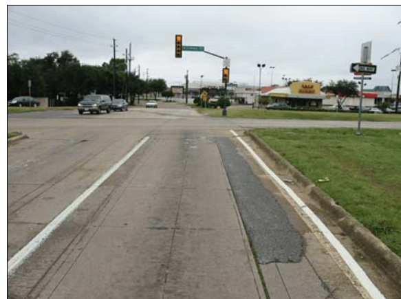
Figure 1: Approach of case vehicle westbound in outside lane and stopped for the traffic signal