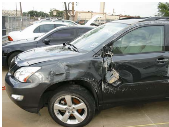
Figure 9: Rollover damage to front half of the left side of the case vehicle

The case vehicle’s rollover involved the entire left side of the vehicle. The direct damage began immediately rearward of the left headlamp/turn signal assembly and extended down the entire left side of the vehicle ( Figures 9 and 10 ). The left fender, left front wheel, left A-pillar, left front door, rear view mirror, left rear door, left roof side rail, left luggage rack, left quarter panel, and left rear wheel were all directly damaged.