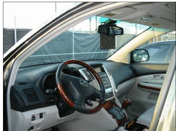
Figure 12: Overview of case vehicle’s windshield, instrument panel and steering wheel

Damage Classification: Based on the case vehicle inspection, the CDC for the impact with the Nissan was determined to be 02-RZEW-1 (70 degrees) . The CDC for the rollover was determined to be: 00-LDAO-2 . The WinSMASH reconstruction program, damage only algorithm was used to reconstruct the Delta Vs for the case vehicle's right side impact. The Total,