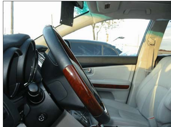
Figure 13: Left side view of case vehicle's steering column and steering wheel showing no damage

Longitudinal, and Lateral Delta Vs are, respectively: 12 km.p.h. (7.5 m.p.h.), -4.1 km.p.h. (2.5 m.p.h.), and -11.3 km.p.h. (-7.0 m.p.h.). The collision fits the reconstruction model but the results appeared to be low. The low Delta-V results are partly due to the small amount of crush sustained by the case vehicle. It is this contractor's opinion that the case vehicle's crush was minimal because the front left corner of the Nissan impacted the case vehicle's right rear wheel, which is a very stiff component. The impact to the right rear wheel resulted in a rapid clockwise rotation of the case vehicle, and prevented the Nissan from penetrating deeper into the sheet metal of the case vehicle's right side doors.