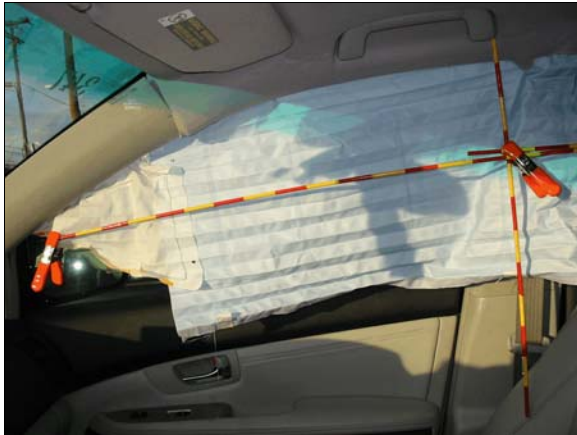
Figure 15: Front portion of case vehicle's right side curtain air bag, each increment on rods is 5.0 centimeters (2.0 inches)

shaped chambers adjacent to the front right seat ( Figure 15 ) and a rectangular chamber and one pillow shaped chamber adjacent to the back right seat ( Figure 16 ).