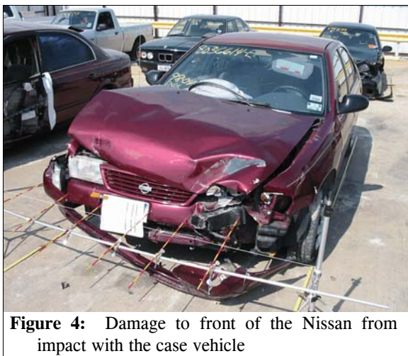
Figure 4: Damage to front of the Nissan from impact with the case vehicle