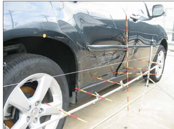
Figure 8: Damage to right rear wheel, right rear door, sill and right front door [each stripe on rods is 5.0 centimeters (2.0 inches)]

Exterior Damage: The case vehicle’s impact with the Nissan involved the right front door, right rear door, right quarter panel, rear portion of the sill, and the right rear wheel. The direct damage began 128 centimeters (50.4 inches) rear of the right front axle and extended 140 centimeters (55.1 inches) along the right side of the case vehicle ( Figure 8 ). Crush measurements were taken at the lower door level. The maximum crush was measured as 4.0 centimeters (1.6 inches) occurring at C 4 . The C 1 position was located at the right rear wheel, which had been directly impacted by the front left corner of the Nissan. There was no sheet metal crush at this position; however, the right rear wheel was bent in at the front about 3.0 centimeters (1.2 inches).