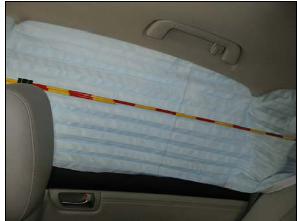
Figure 16: Back portion of case vehicle's right side curtain air bag