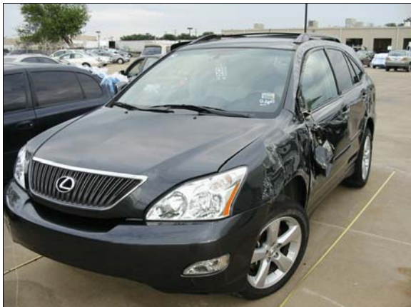
Figure 6: Overview of rollover damage to left side of case vehicle

Post-Crash: The case vehicle came to final rest on its left side on the west side of the intersection across the two westbound lanes facing southwest ( Figure 7 ). The impact caused the Nissan to rotate clockwise approximately 55 degrees. It came to final rest in the intersection facing southwest.