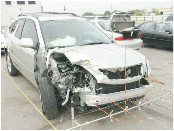
Figure 5: Case vehicle's frontal damage viewed from right of front; Note: bumper fascia missing and contour gauge shows bumper crush (case photo #24)