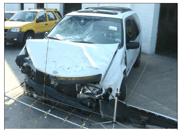
Figure 3: Elevated view of Nissan's overlapping frontal damage viewed from left of front; Note: front left half damage most likely from initial impact with barrels (case photo #54)

Crash: The front left ( Figure 3 ) of the Nissan collided with a crash barrier (i.e., barrels) that protected the gore area between the right side of the northeast roadway and the exit ramp ( Figure 4 below). The Nissan entered the exit ramp while rotating approximately 160 degrees counter-clockwise after impacting the barrels, and it was most likely traveling backwards in a northeasterly