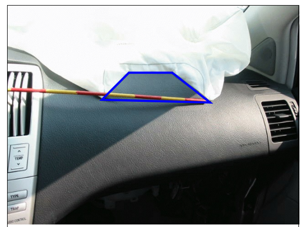
Figure 15: Case vehicle's deployed front right passenger air bag and air bag module's trapezoidal-shaped bottom cover flap (case photo #40)