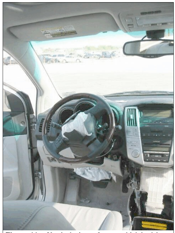
Figure 11: Vertical view of case vehicle's driver seating area showing no apparent evidence of occupant contact (case photo #26a)

Damage Classification: Based on the vehicle inspection, the CDCs for the case vehicle were determined to be: 12-FDEW-1 ( 0 degrees) and 09-LBEW-1 ( 280 degrees). The WinSMASH reconstruction program, missing vehicle algorithm, was used on the case vehicle's highest severity impact. The Total, Longitudinal, and Lateral Delta Vs are, respectively: 15.0 km.p.h. (9.3 m.p.h.), -15.0 km.p.h. (-9.3 m.p.h.), and 0.0