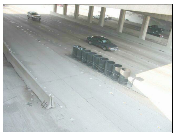
Figure 4: Impact area-Nissan hit barrels (1<sup>st</sup> event), case vehicle impacted Nissan (2<sup>nd</sup> event), and case vehicle's left rear impacted barrels (3<sup>rd</sup> event); Note: barrel type and/or configuration likely different from date of crash (case photo #07)

direction. Recognizing the impending collision, the case vehicle's driver "briefly" braked, attempting to avoid the crash. The front right (primarily) of the case vehicle ( Figure 5 ) impacted the front right of the rotating Nissan ( Figure 6 ), causing the case vehicle's driver and front right passenger supplemental restraints (air bags) to deploy. In addition, the case vehicle's driver knee bolster supplemental restraint (air bag) also deployed. Sustained contact occurred between the two vehicles as the case vehicle's front wrapped around the right front of the Nissan enabling the case vehicle's front left ( Figure 7 ) to impact the right front door of the Nissan ( Figure 8 below).