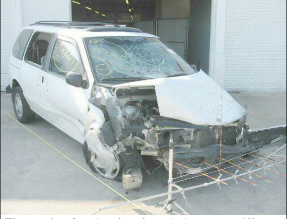
Figure 6: Overlapping frontal damage to Nissan viewed from right of front with contour gauge showing aggregate crush to bumper; Note: case vehicle impacted Nissan's front right, with wraparound damage extending to right front door (case photo #62)