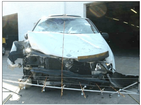
Figure 22: Overlapping damage to Nissan's front from impact with barrels and case vehicle; Note: contour gauge positioned along actual bumper (case photo #52)

Although the front of the Exterior Damage: Nissan sustained overlapping damage, the initial contact with the crash barrels most likely involved the front left. After rotating approximately 160 degrees counterclockwise, the Nissan's contact with the case vehicle initially involved its front right, but the contact was sustained, wrapping around the Nissan and involving its right fender and right front door. The combined direct damage involved the entire front bumper, from corner to corner, and extended a measured distance of 160 centimeters (63.0 inches) along the front bumper (Figure 22). The combined residual maximum crush was measured as 28 centimeters (11.0 inches) at C_6 . The table below shows the case vehicle's composite crush profile for the three tree impacts.