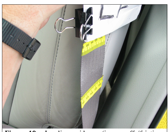
Figure 19: Loading evidence (i.e., scuffs/friction burns) on webbing of torso portion case vehicle's driver safety belt (case photo #44)

Based on this contractor's vehicle inspection, the case vehicle's driver was restrained by his available, active, three-point, lap-andshoulder, safety belt system; the belt system was equipped with a retractor-mounted pretensioner with force load limiters, housed within the "B"pillar. There was no mention by the driver of belt pattern bruising and/or abrasions to the driver's body, but the inspection of the driver's seat belt webbing, "D"-ring, and latch plate showed evidence of loading (Figure 19). Specifically there were friction burns on the torso portion of the webbing. In addition, it should be noted that the seat belt webbing for this seat position spooled and unspooled freely, indicating that the pretensioner may not have actuated.