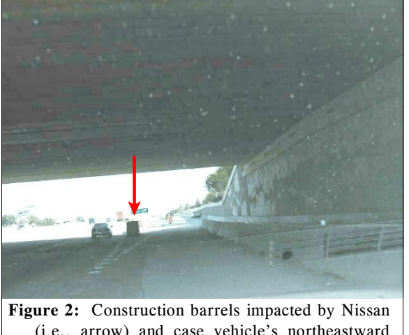
(i.e., arrow) and case vehicle's northeastward travel path to impact with redirected Nissan (case photo #05)

New Jersey type) which separated and protected the northeast roadway from the construction area. The northwestern shoulder was similarly configured with a short, unmeasured shoulder prior to the concrete longitudinal barrier that protected the median between the roadways (i.e., the overpass's bridge support pillars). The roadway was not bordered by curbs. Pavement markings consisted of raised pavement markers, grouped into fours (4s), so as to appear as dashed lines (Figure 1 above). Groupings (of four markers) were used to separate the through lanes while continuous raised pavement markers were used to identify the roadway's edges and the gore area where the exit lane began. The estimated coefficient of friction was 0.65 for the case