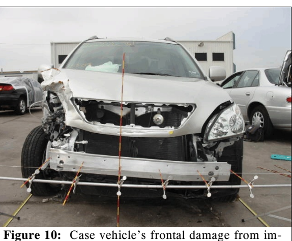
Figure 10: Case vehicle's frontal damage from imact with Nissan; Note: contour gauge positioned along actual bumper (case photo #11)

Exterior Damage : The case vehicle's contact with Nissan initially involved the front right. The case vehicle had sustained contact with the Nissan, eventually "wrapping around" the Nissan's right side enabling the entire front of the case vehicle to sustain direct contact damage ( Figure 10 ). The case vehicle's front bumper fascia was torn off the bumper and, although it was present at the time of our inspection, the direct contact damage was best measured along the actual bumper and remaining structures, beginning at the front right corner and extending 81 centimeters (31.9 inches) leftward. Residual maximum crush was measured as 13 centimeters (5.1 inches) at C<sub>6</sub>. The table below