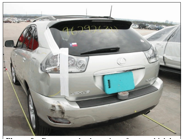
Figure 9: Damage to back portion of case vehicle's left rear quarter panel and bumper from impact with barrels during clockwise rotation to final rest (case photo #17)

system analyze a combination of factors including the predicted crash severity and driver and front right passenger seat belt usage to determine the front air bag inflation level appropriate for the severity of the crash. For the front right seating position, an occupant weight sensor in the seat determines first, if a passenger is on the seat and, second, if the weight of the passenger is below a set value [i.e., the specific weight value is not known for the case vehicle, but must be 30 kilograms (66 pounds) or less]. If no front right occupant is seated or the occupant's weight is below the set value, then the sensor will suppress deployment of the front right passenger air bag. The crash sensors in the side of the case vehicle analyze side impact forces and deploy the driver's and/or the front right passenger's seat back-mounted side impact air bag and the roof mounted, side inflatable curtain air bags to provide added protection to passengers seated along the side of the vehicle. Finally, the case vehicle was also equipped with an <u>Electronic Control Unit</u>, which houses the Event Data Recorder (EDR) technology.