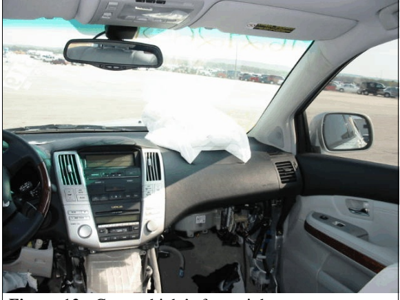
Figure 12: Case vehicle's front right passenger seating area showing no apparent occupant contact evidence (case photo #28)

The case vehicle was equipped with a Supplemental Restraint System (SRS) that contained a multi-stage frontal air bag at the driver position ( Figure 11 above) and a dual stage frontal air bag at the front right passenger position ( Figure 12 ). In addition, the vehicle was equipped with a driver's knee bolster air bag ( Figure 11 above); front, seat back-mounted, side impact air bags; and side-inflatable curtain air bags which extend from each of the roof side rails. All three frontal air bags deployed as a result of the frontal impact with the Nissan. Based