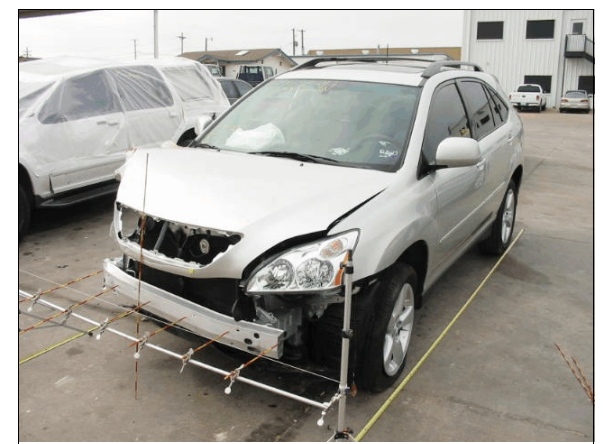
Figure 7: Case vehicle's frontal damage from impact with Nissan viewed from left of front; Note: lesser damage to front left resulted from contact with Nissan's right front door as case vehicle wrapped around Nissan's right side (case photo #13)

Post-Crash: The Nissan's counterclockwise rotation was accelerated as a result of the impact and it continued to rotate approximately 40 degrees counterclockwise while being pushed in a northeasterly direction by the case vehicle. The Nissan came to rest obliquely oriented across the exit ramp, heading south. The case vehicle rotated approximately 65 degrees clockwise as it slid