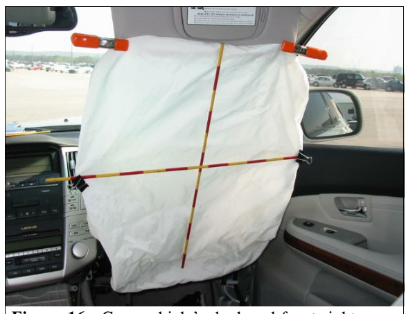
Figure 16: Case vehicle's deployed front right passenger air bag showing no apparent evidence of occupant contact (case photo #35)