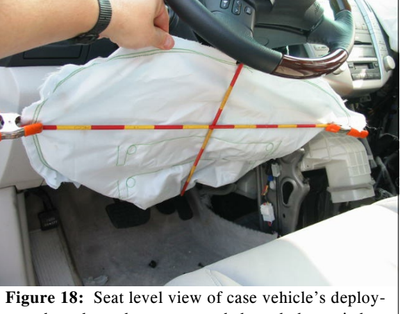
Figure 18: Seat level view of case vehicle's deployed, under column-mounted, knee bolster air bag showing no residual occupant contact evidence (case photo #42)

downloaded from the case vehicle's EDR showed the driver's and front right passenger's seat belt buckle status, time from algorithm enable to deployment (i.e., air bag deployments) for only the system's first stage, the type of passenger in the front right seating position, and the vehicle's speed and brake switch status for the five recorded sample periods preceding the ALGORITHM ENABLE . In addition, the vehicle's velocity change (i.e., Longitudinal Delta V) is reported. Downloaded data of interest indicated the following: the case vehicle was gradually accelerating and had reached a speed of at least 95.9 km.p.h. (59.6 m.p.h.) when the driver applied the brake between the 3<sup>rd</sup> and 2<sup>nd</sup> recorded sample period prior to ALGORITHM ENABLE , the driver's and front right passenger's seat belt status showed they were buckled, the driver's third stage and the front right passenger's second stage of their multi-stage and dual stage air bags, respectively, were activated, the front right passenger was an "adult", and the Delta V reached a value of 28.2 km.p.h. (17.5 m.p.h.) at the 150 millisecond mark of recorded data but was still increasing. In addition, the EDR showed that there was a previous ALGORITHM ENABLE in this vehicle's history, but this non-deployment event occurred at least 5.1 seconds prior to the crash event. This