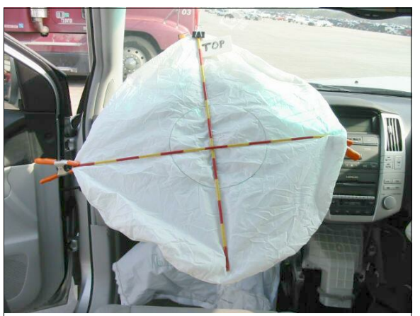
Figure 14: Case vehicle's deployed driver air bag showing no obvious occupant contact evidence (case photo #32)