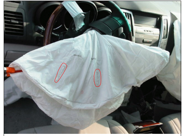
Figure 13: Back top surface of case vehicle's deployed driver air bag showing "slit"-type vent ports (case photo #33)

11 centimeters (4.3 inches). An inspection of the air bag module's cover flaps and the air bag's fabric revealed that the cover flaps opened at the designated tear points, and there was no evidence of damage during the deployment to the air bag or the cover flaps. The driver's air bag was designed with two tethers, each approximately 10 centimeters (3.9 inches) in width, positioned at the 9 and 3 o'clock positions and sewn 23 centimeters apart (9.1 inches) at the center of the bag. The driver's air bag had two vent ports, which were essentially slits in the back of the air bag, each approximately 6 centimeters (2.4 inches) in length, located at the 11 and 1 o'clock positions (Figure 13). The deployed driver's air bag was