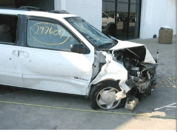
Figure 8: Nissan's frontal and right side damage viewed from right front; Note: displacement of right front wheel assembly and damage on right front door caused by wrap-around damage from impact with case vehicle (case photo #60)

The case vehicle was <u>CERTIFIED</u> <u>ADVANCED</u> 208-<u>COMPLIANT</u> and was equipped with multistage driver and dual stage front right passenger air bag inflators, a driver seat belt sensing system, a driver's knee air bag, front seat back-mounted side impact air bags, and front and back side curtain air bags. Furthermore, the case vehicle was equipped with LATCH system features and a new tire pressure monitor. In addition, there was an occupant weight sensor for the front right passenger seating position. The various sensors in the case vehicle's advanced occupant restraint