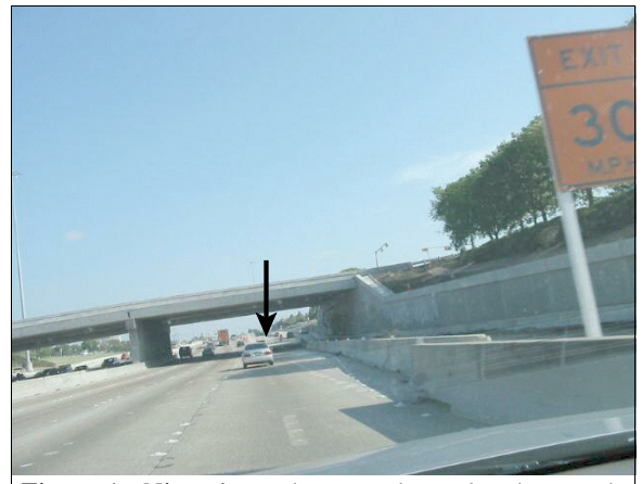
Figure 1: Nissan's northeastward travel path toward initial impact with crash barrels (i.e., arrow) which separate inside northeastbound through lane from exit lane; Note: construction barricades widen for exit lane (case photo #03)

through lanes while the northeast roadway had an exit ramp. There was construction on-going on both the northeastern and southwestern roadways (i.e., probably adding an additional through lane in each direction), and the crash location occurred underneath an overpass (Figure 1). The U.S. highway was straight and had an unmeasured grade positive to the northeast (i.e., an upgrade in the case vehicle's direction of travel), at the area The pavement was concrete, but of impact. traveled. and the width of the inside northeastbound lane was most likely 3.7 meters (12.0 feet) and the exit lane was unmeasured but appeared to be wider (Figure 2 below). The shoulders were improved (i.e., concrete), and there was a short, unmeasured southwestern shoulder prior to the longitudinal barrier (i.e.,