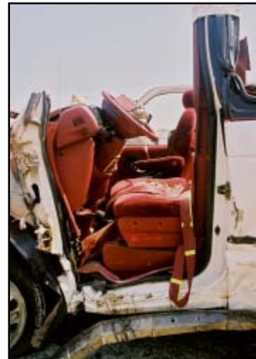
Figure 8. View of displaced driver's seat and related intrusions