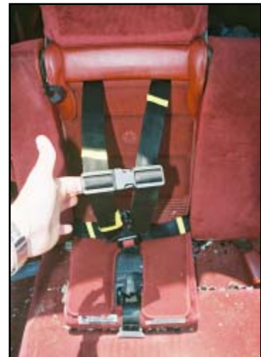
Figure 15. Close-up of harness straps of the right side integrated CSS

A 13-month-old female child was restrained in the right side integrated CSS. The left side integrated CSS was not used in this crash. At the time of the vehicle inspection, the right side CSS head restraint was found in the stowed position, and it was not known if it was engaged at the time of the crash. The harness system ( Figure 15 ) was adjusted such that the length of the harness webbing measured 67.3 cm (26.5") between the harness slots and the lower anchors. The adjustment tab was adjusted to a residual length of 12.7 cm (5.0"). It should be noted that the left side CSS harness system (not used in this crash) was adjusted to the same parameters, and did not show signs of historical use. The pre-crash position of the harness retainer clip was unknown. The harness retainer clip did not exhibit any abrasions or deformation. Minor stretch marks were present on the harness webbing. The loading to the right harness strap began 12.1 cm (4.5") above the lower anchor and extended upward 45.1 cm (17.8"). The loading to the left harness strap began 5.1 cm (2.0") above the lower anchor and extended upward 57.2 cm (22.5"). The plastic harness slots sustained only faint abrasions from the child loading against the harness straps.