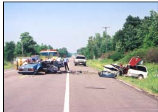
Figure 4. On-scene police photograph of crash site and final rest positions