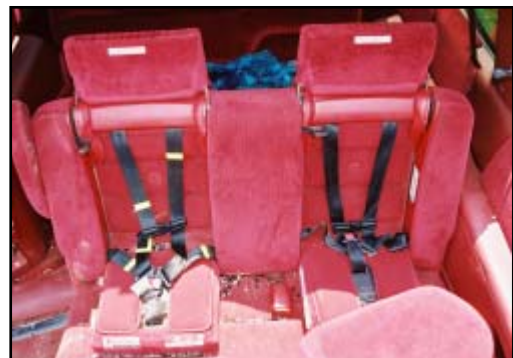
Figure 14. Overhead view of the integrated CSS's