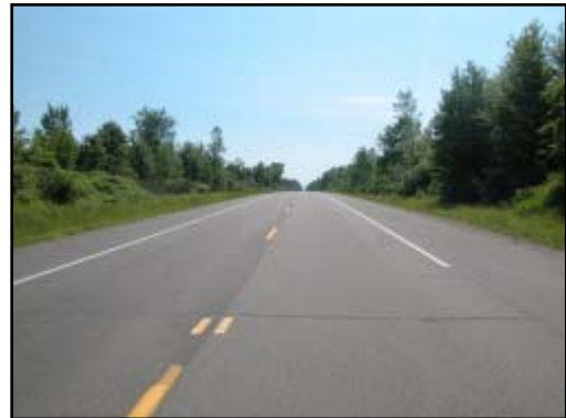
Figure 3. Westbound approach for the Pontiac 6000