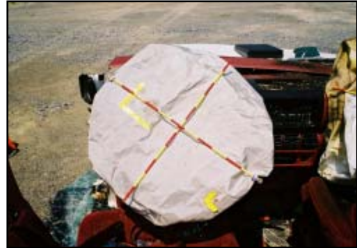
Figure 16. Deployed driver's air bag

The 1994 Dodge Grand Caravan was equipped with frontal air bags for the driver and front right passenger positions that deployed as a result of the frontal impact. The driver's air bag ( Figure 16 ) deployed from the center of the steering wheel hub from symmetrical H-configuration cover flaps. The cover flaps measured 5.7 cm (2.5") in height and 17.8 cm (7.0") in width. The driver's air bag measured 66.0 cm (26.0") in diameter. A fluid transfer (possibly body fluid) was present on the face of the driver's air bag that was vertically centered, located 7.6 cm (3.0") below the horizontal centerline, and measured 10.2 cm (4.0") in length. A small circular body fluid transfer was located 22.9 cm (9.0") above the horizontal centerline and 10.2 cm (4.0") to the right of the vertical centerline that measured 1.3 cm (0.5") in diameter. Faint linear vinyl transfers were present on the outboard aspects of the face of the air bag from engagement against the cover flaps during the deployment. The driver's air bag was vented by two circular ports located at the 12 o'clock position on the rear of the air bag. The vent ports measured 2.5 cm (1.0") in diameter and were located 7.0 cm (2.8") from the circumferential seam and were spaced 5.1 cm (2.0") apart. The air bag was not tethered.