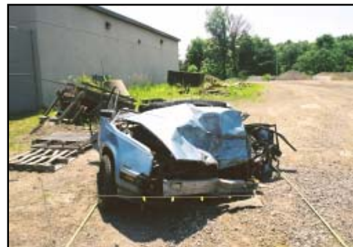
Figure 9. Frontal view of damaged Pontiac 6000

The 1988 Pontiac 6000 sustained severe damage (Figures 9 and 10) as a result of the frontal impact with the Dodge Grand Caravan. The direct damage on the bumper fascia began 11.4 cm (4.5") left of the centerline and extended 69.9 cm (27.5") to the front left corner. The bumper fascia was fractured and completely separated from the vehicle. The hood sustained direct contact abrasions and was crushed and buckled rearward. The front bumper beam exhibited two vertical fractures that were located 27.9 cm (11.0") and 54.6 cm (21.5") left of the centerline. The maximum crush at the front left corner measured 116.8 cm (46.0"). The combined direct and induced damage involved the entire frontal width of the Pontiac 6000. The vehicle frame was buckled and deformed laterally between the B- and C-pillars. The front half of the vehicle was deflected to the right, and the magnitude of the lateral deflection on the right side between the right B-pillar and right C-pillar measured 39.4 cm (15.5"). The right front fender was deflected significantly to the left. The left front wheel was crushed rearward and restricted. The entire left sill was buckled and the left front door was deformed, buckled, and pulled outward from the top aspect by rescue personnel. The frontal crush and frame deflection resulted in a 68.0 cm (26.8") reduction of the left wheelbase and a 9.0 cm (3.5")