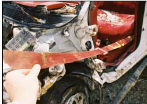
Figure 11. View of driver's cut safety belt

The front seating positions in the Dodge Grand Caravan were configured with manual 3-point lap and shoulder belts. Both front seat safety belts were cut by rescue personnel to facilitate the cutting of the B-pillars, folding of the roof, and extrication of the driver. The driver’s safety belt was configured with a sliding latch plate, adjustable D-ring, and an emergency locking retractor (ELR). The retractor was jammed in the used position, and rescue personnel cut the driver’s safety belt webbing 167.6 cm (66.0”) above the lower anchorage ( Figure 11 ). The remaining webbing, which extended from the retractor, measured 50.8 cm (20.0”) from the opening on the B-pillar to the cut point, and 27.9 cm (11.0”) from the driver’s D-ring (located in the full-up position) to the cut point. The driver’s safety belt webbing exhibited minor stretch marks from occupant loading and the D-ring exhibited faint abrasions. A white paint transfer was located 64.8 cm (25.5”) above the lower anchor on the outboard aspect that measured 16.5 cm (6.5”) in length. The plastic hardware of the latch plate sustained minor abrasions as a result of occupant loading.