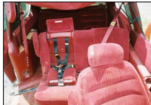
Figure 12. View of second row restraints

The second row two-person bench seat ( Figure 12 ) was configured with manual 3-point lap and shoulder belts for each seating position. Both had fixed D-ring anchors, ELR’s, and cinching latch plates. The right side safety belt was configured with a steel spring clasp on the lower anchor of the lap belt portion. A plastic sleeve that measured 25.4 cm (10.0”) in length and 5.1 cm (2.0”) in width was located adjacent to the clasp on the webbing. The clasp engaged with one of two steel rings labeled “A” and “B”. The “A” ring was located on the floor on the rear right corner aspect of the second row bench seat. The “B” ring was located on the