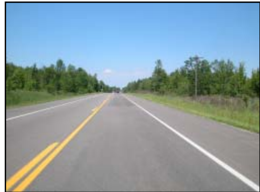
Figure 2. Eastbound approach for the Grand Caravan

The Grand Caravan impacted the Pontiac 6000 in an angled, offset, head-on configuration. The impact resulted in severe damage to both vehicles, and resulted in the deployment of the frontal air bag system in the Grand Caravan. The directions of force were in the 12 o'clock sectors for both vehicles. The damage algorithm of the WinSMASH program computed a total delta-V of 54.0 km/h (33.6 mph) for the Grand Caravan and a total delta-V of 76.0 km/h (47.2 mph) for the Pontiac 6000 based on the respective crush profiles. The vehicles remained engaged and rotated in a counterclockwise (CCW) direction. Due to the continued engagement and rotation of the vehicles, direct contact from the Pontiac 6000 extended down the left side of the Grand Caravan. Two curved tire marks from the Grand Caravan's front tires were present on the asphalt shoulder from the post-impact rotation and travel to final rest. The vehicles separated and the Grand Caravan came to rest on the grassy roadside facing northwest. The Pontiac 6000 came to rest straddling the centerline facing southeast. Final rest positions are shown in Figure 4 .