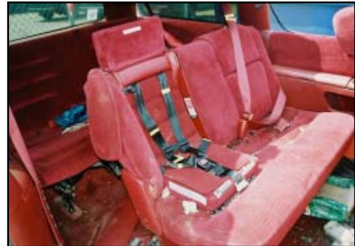
Figure 1. Integrated CSS in the 1994 Dodge Grand Caravan

This on-site investigation focused on the performance of an integrated forward-facing child safety seat (CSS) that was present in a 1994 Dodge Grand Caravan. The Grand Caravan was occupied by a 62-year-old male driver, a 33-year-old male front right passenger, a 32-year-old female left second seat passenger, and a 13-month-old female child passenger who was restrained in the second bench seat's right side integrated CSS ( Figure 1 ). All of the adult passengers were restrained by the manual 3-point lap and shoulder belts. The Grand Caravan was involved in an angled offset head-on collision with a 1988 Pontiac 6000 that crossed the centerline of a two-lane roadway. The impact resulted