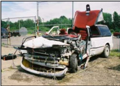
Figure 5. Damaged Dodge Grand Caravan

The 1994 Dodge Grand Caravan ( Figures 5 and 6 ) sustained severe damage as a result of the frontal impact with the Pontiac 6000. The direct damage began 5.1 cm (2.0”) left of the centerline and extended 78.7 cm (31.0”) to the front left bumper corner. Abrasions and paint transfers were present on the left aspect of the bumper fascia and the bumper fascia was separated from the vehicle. The bumper beam and upper and lower radiator supports were crushed rearward. The maximum crush at the bumper beam was located at the front left corner and measured 94.0 cm (37.0”). The front left aspect of the hood was deflected down and rearward from direct contact and the entire hood was rotated slightly clockwise (CW). The left rear aspect of the hood was separated. The left front fender was completely separated and the left front wheel sustained direct contact, evidenced by tears on the sidewall of the tire and abrasions on the alloy wheel. The frontal crush resulted in a 43.0 cm (16.9”) reduction of the left wheelbase. Due to the post impact engagement and rotation, direct contact abrasions and paint transfers extended along the left side of the Grand Caravan beginning at the left front corner and terminating at the left B-pillar, 123.0 cm (48.4”) aft of the damaged left front axle. The combined direct and induced damage involved the entire frontal width of the Grand Caravan. The bumper