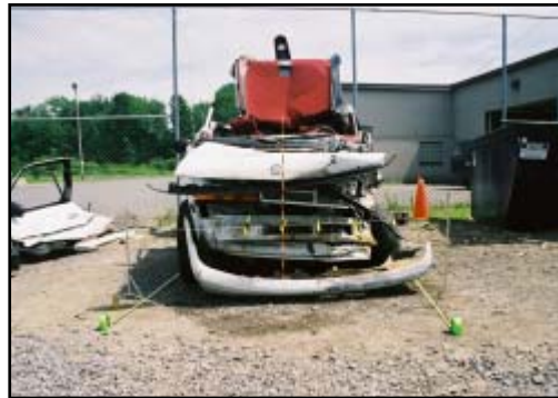
Figure 6. Frontal view of the damaged Dodge Grand Caravan