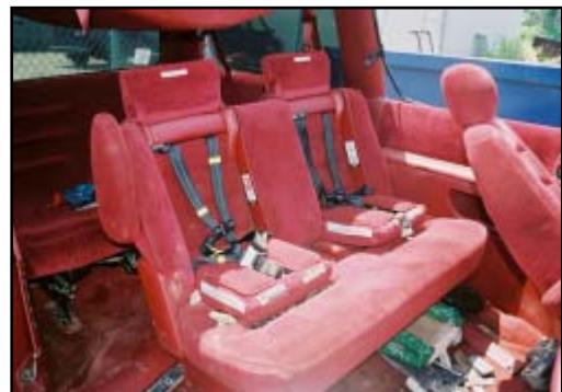
Figure 13. Lateral view of second row integrated CSS's

The 1994 Dodge Grand Caravan was equipped with two integrated forward-facing CSS's ( Figure's 13 and 14 ) in the second row bench seat. The CSS seat cushions folded forward from the bench seat back and the CSS head restraints rotated upward from the seat back. The CSS head restraints measured 20.3 cm (8.0”) in height, 29.8 cm (11.8”) in width, and 5.7 cm (2.3”) in thickness in the stowed position. In the used position, the CSS head restraint measured 15.2 cm (6.0”) in height. A label was present on the CSS head restraint that read, “This headrest is not intended for use by an adult.” A 7.6 cm (3.0”) long nylon loop was present on the right aspect of each CSS that protruded from under the head restraints in the stowed position, which released the CSS seat cushions and head restraints from the seat back. The CSS head restraint locked into position when fully extended, and could be released to re-stow by pulling on the spring-loaded nylon loop. The CSS seat cushions measured 27.9 cm (11.0”) in width, 33.0 cm (13.0”) in length, and 7.6 cm (3.0”) in height. The CSS cushions extended 21.6 cm (8.5”) forward from the seat back. Horseshoe-shaped removable fabric pads were affixed to each seat cushion with Velcro fasteners, which measured 1.9 cm (0.8”) thick. The