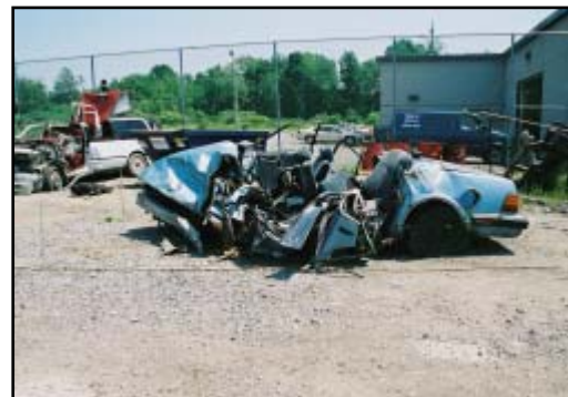
Figure 10. Left side view of damaged Pontiac 6000