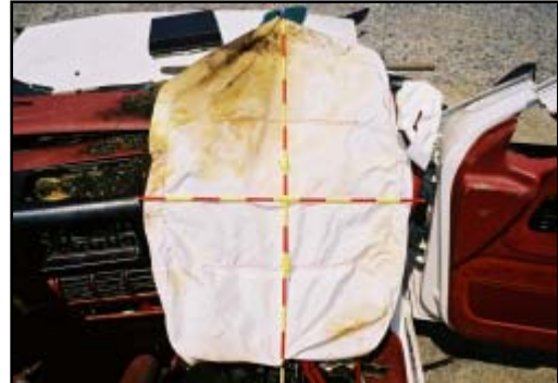
Figure 17. Deployed front right passenger's air bag

The front right passenger's air bag ( Figure 17 ) deployed from a top-mount module with a single cover flap design. The cover flap was rectangular in shape and measured 14.6 cm (5.8") in height and 30.5 cm (12.0") in width. The front right passenger's air bag measured 66.0 cm (26.0") in height and 45.7 cm (18.0") in width. The air bag was vented back through the module, as there were no vent ports located on the air bag. The air bag was tethered by two internal straps that measured 29.8 cm (11.75") in width and were located 15.2 cm (6.0") above and below the horizontal centerline of the air bag. At the time of the inspection, the top aspect of the front right passenger's air bag was covered with motor oil and crash debris. There was no occupant contact evidence on the air bag.