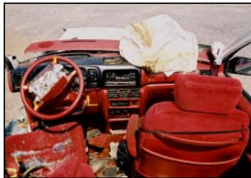
Figure 7. Overall view of damaged front seating positions