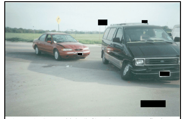
Figure 6: Case vehicle (left) and Aerostar at final rest (case photo #03)

The other vehicle was a 1990 Ford Aerostar rear wheel drive (4x2), three-door minivan (VIN: 1FMDA11U9LZ-----), equipped with a 3.0 liter V6 gasoline engine. The Aerostar was not equipped with anti-lock brakes. Its odometer reading is not known. Its specification wheelbase was 302 centimeters [118.9 inches]. The Aerostar was towed due to disabling wheel damage.