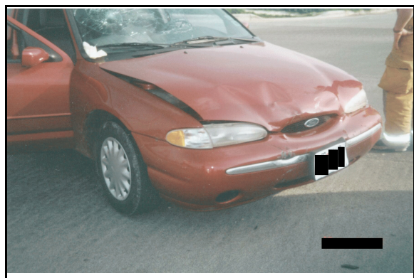
Figure 3: Case vehicle's front and right side (case photo #05)

The CDC for the case vehicle was estimated from photographs as 12-FYEW-1 ( 350 ). The WinSMASH reconstruction program, damage only algorithm based on the photo-estimated CDCs for the two vehicles, was used on the single impact. The total, longitudinal and lateral delta-Vs for the case vehicle are, respectively: 14.0 km.p.h. [8.7 m.p.h.], -13.8 km.p.h. [-8.6 m.p.h.] and + 2.4 km.p.h. [+ 1.5 m.p.h.]. This is a borderline reconstruction and the results appear a little low but essentially reasonable. This was a crash of low severity (14-23 km.p.h. [9-14 m.p.h]) for the case vehicle.