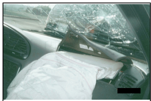
Figure 5: Front right air bag and cover flap, view from right (case photo #10)

The driver observed the threat ahead and braked with lock-up, and the front right passenger moved forward in response to the braking deceleration. This forward movement put the child in close proximity to the front right passenger's air bag module. The case vehicle's front impacted the right front area of the other vehicle, causing front right passenger to move further forward, toward the 12:00 o'clock direction of force, and causing the case vehicle's front right passenger air bag to deploy. The front right air bag module's cover flap and air bag struck the child in the anterior portion of her neck, causing contusions and abrasions on her neck and an injury to her larynx. Her face struck the windshield, causing the windshield to crack, and she sustained contusions on her face. The expanding air bag lifted her and the back of her head stuck the windshield header. She sustained scalp contusions and a depressed skull fracture in the occipital region. Her position at final rest is not known, but she probably fell back into the front right seat.