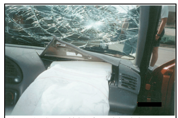
Figure 4: Case vehicle's front right air bag, cover flap and cracked windshield (case photo #07)

The case vehicle's front right passenger (6-year-old female, white, unknown if Hispanic, unknown height, 18 kilograms [40 pounds]) was neither in a child safety seat nor using her available, active, three-point, lap-and-shoulder safety belt system. According to the driver's statement to the police, the child had been safety belted but had removed her seat belt shortly before the crash. There is no knowledge of the front right seat adjustments or the child's posture.