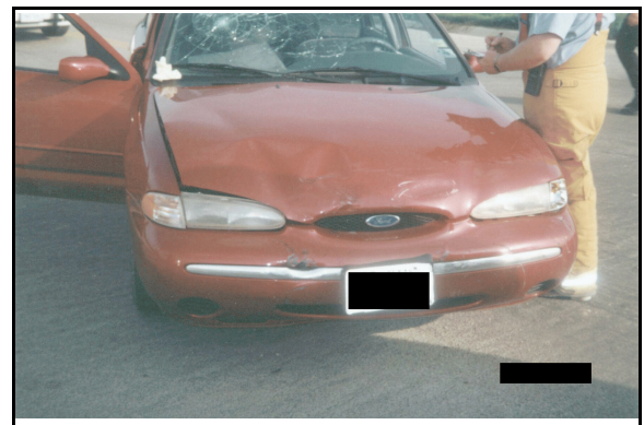
Figure 2: Case vehicle's front at final rest (case photo #04)

The case vehicle sustained light crushing and abrading from direct contact involving the left three-quarters of the front (Figures 2 and 3). The damage was primarily at the center of the bumper and on the leading edge of the hood, extending to the front left bumper corner, with minor induced damage and displacement of the hood. Both headlamp/turn signal assemblies were intact. Based on the collision configuration and the damage to the other vehicle, this was probably an impact that involved substantial force despite the apparently minor damage. The case vehicle's energy absorbing bumper structures and frame accommodated this force with only slight exterior damage evident. There was extensive cracking of the windshield in the right and center (Figure 4). This cracking was certainly a result of the front right occupant impacting the windshield, but the vehicle-to-vehicle crash forces probably contributed to the magnitude of the windshield damage. None of the case vehicle's tires were deflated or restricted, and there was no glazing damage other than the windshield.