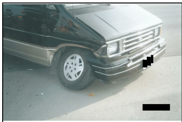
Figure 7: Aerostar's front right fender and wheel damage (case photo #12)

The Aerostar sustained direct contact damage in the right front area, from the right A-pillar forward to the bumper corner. The fender was crushed inward along the edges of the wheel well and there was direct contact to the wheel/tire assembly. The right front suspension components and/or axle were probably damaged, with the top of the wheel tilted inward approximately 20 degrees off vertical. The portion of the front bumper cover that wraps around to the right side showed light abrading and the turn signal lens was broken, but the right headlamp was intact. It appears that none of the other wheels/tires sustained any damage and no glazing damage is visible in the available photos.