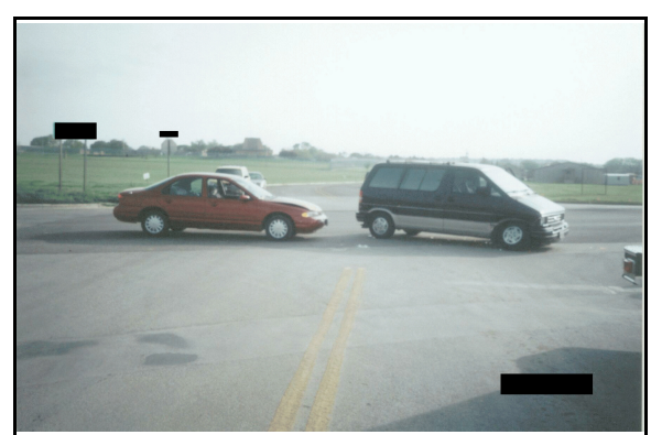
Figure 1: Case vehicle (left) and other vehicle at final rest, looking southwest (case photo #01)

The front of the case vehicle impacted the right front portion of the other vehicle, causing the case vehicle's driver and front right passenger air bags to deploy. The case vehicle rotated a few degrees clockwise and came to rest a short distance from the point of impact, within the intersection, heading approximately north. The other vehicle rotated approximately 60 degrees counterclockwise while sliding in a northwesterly direction and came to rest within the intersection heading north ( Figures 1 and 6 ).