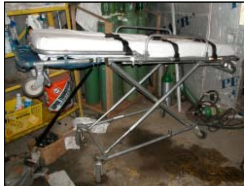
Figure 6. Ferno ambulance cot

The ambulance cot was a Ferno Model 35-A aluminum cot ( Figure 6 ). The cot was rated for a maximum weight of 228 kg (500 lb) and was designed with eight vertical adjustment positions. Its overall length measured 200.1 cm (79.0") and overall width measured 61.0 cm (24.0"). The cot was configured with a fully adjustable gas-assist backrest and three sets of lateral harness straps with locking latch plates for the chest, hips, and legs. A 4-point shoulder harness was available for this ambulance cot, but was not affixed to the cot at the time of the crash.