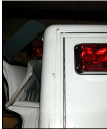
Figure 13. Close up of abrasion on the forward corner of the drip rail

Large amounts of dirt were also present on the right front wheel, the right side running board, and the lower aspect of the right side of the patient compartment ( Figure 14 ). The right front wheel cover was deformed on the center aspect. The rear aspect of the right front fender was deformed slightly at the bottom aspect. The lower diamond plate trim piece aft of the right rear wheel was separated.