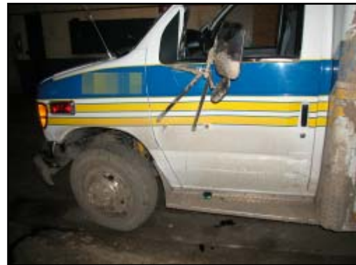
Figure 11. Left front view showing displaced mirror and door damage