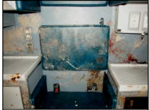
Figure 9. Left side "CPR" seat

A single seating position was located on the center aspect of the left wall of the patient compartment ( Figure 9 ). Commonly called the “CPR seat”, it was configured with a bottom cushion and 3.2 cm (1.3”) thick padding on the outboard side aspects. The padded seat back was located 20.3 cm (8.0”) above the cushion, and was hinged at the bottom aspect, designed to fold onto the outboard padded cushions for use as a shelf. The seat back measured 59.7 cm (23.5”) in width and 40.6 cm (16.0”) in height. It was anchored in the up position by a steel pin-type lock located at the top of the seat cushion at the forward aspect.