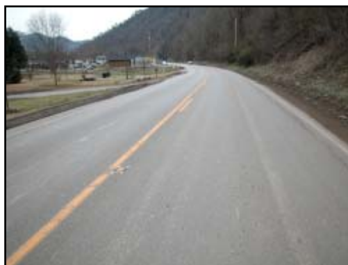
Figure 2. Westbound approach for the ambulance

As the ambulance was in the left curve approaching the straight section of the roadway ( Figure 2 ), the driver detected a tractor-trailer ahead in the westbound lane traveling well below the posted speed limit. The tractor-trailer was displaying a left turn signal as it slowed, and the driver of the ambulance thought the truck was slowing to let the ambulance pass. The ambulance driver initiated a passing maneuver and crossed the centerline of the roadway. As the ambulance entered the eastbound lane, the tractor-trailer initiated a left turn into a driveway across the path of the ambulance. The driver of the ambulance braked and steered right in an attempt to avoid the collision. He called out to the occupants in the patient compartment during the avoidance maneuver in an attempt to warn them of the impending crash. The ambulance crossed the centerline, initiated a clockwise (CW) yaw across the westbound lane, and departed the right roadside. It traveled through the shallow ditch and ramped up the hillside. At the time of the scene inspection, there were no pre-crash tire marks or other evidence on the roadway surface.