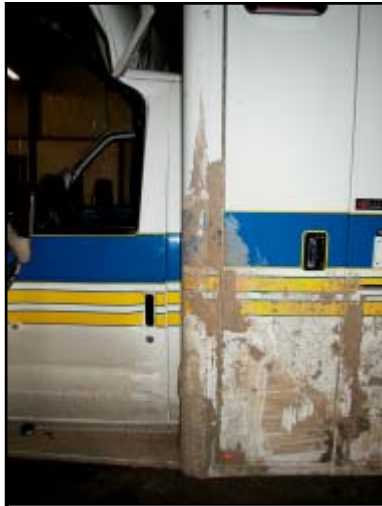
Figure 12. View of abrasions on left front corner of the patient compartment

The left front corner of the patient compartment outboard of the cab sustained moderate abrasions from the rollover ( Figure 12 ). The abrasions began 62.2 cm (24.5”) from the top aspect of the patient compartment and extended a vertical distance of 153.7 cm (60.5”). The forward corner of the drip rail along the top aspect of the left side of the patient compartment was also abraded ( Figure 13 ). The abrasion measured 1.9 cm (0.8”) in length. The 144.8 cm (57.0”) long diamond plate trim piece that was located on the bottom aspect of the patient compartment, forward of the rear wheel was separated. The aluminum splash guard that was contoured to the rear wheel well was also separated. The Collision Deformation Classification (CDC) for the rollover event was 00-LDAO-1.