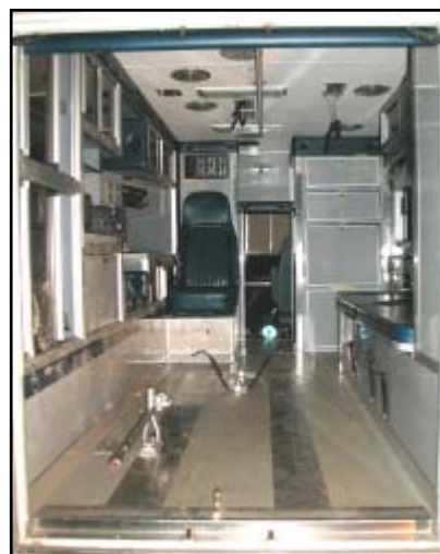
Figure 7. View of patient compartment interior

Two cabinets were located over the right side squad bench seat. The combined measurements were 184.2 cm (172.5") in length and 25.4 cm (10.0") in height. A second cabinet was located on the rear wall on the right side of the patient compartment, adjacent to the right exit door, and