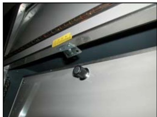
Figure 16. Close-up of displaced cabinet door

The cabinet doors on the front right wall of the patient compartment sustained damage from occupant contact. A 10.2 cm (4.0”) section of the aluminum frame around the top door was deformed from occupant contact on the top aspect. A 5.1 cm (2.0”) section was deformed on the top right side aspect. The two center cabinet doors on the front right wall of the patient compartment were displaced forward from occupant contact ( Figure 16 ). Both doors were hinged at the bottom aspects and the spring-loaded cam locks were displaced forward past