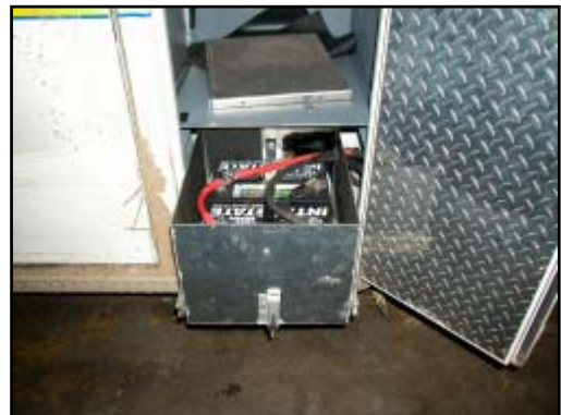
Figure 5. View of battery drawer

The forward compartment on the right aspect of the patient compartment allowed access to the interior shelves and also housed the vehicle batteries in the bottom aspect. A roll-out drawer housed two batteries that were secured by a single aluminum bracket along the top aspect ( Figure 5 ). The drawer measured 42.5 cm (16.8") in length, 34.9 cm (13.8") in width, and 27.3 cm (10.8") in depth. An aluminum cover was secured over the top of the drawer with wing bolts. It was removed post-crash to gain access to the batteries. The drawer was configured with a high-tension spring locking mechanism on the center aspect of the face of the drawer that engaged with a receiver mounted on the interior aspect of the cabinet floor.