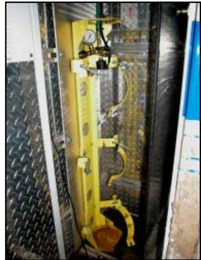
Figure 4. View of oxygen cylinder bracket

The forward exterior compartment on the left aspect housed an H-size oxygen cylinder that measured 110.5 cm (43.5") in height and 17.8 cm (7.0") in diameter. The H-cylinder was secured with a steel cylinder bottle bracket ( Figure 4 ) mounted to the forward aspect of the left front exterior cabinet. The bracket was configured with three heavy-duty steel semi-circular clasps, which were secured to the bracket on the each side by 7.9 mm (5/16") diameter bolts that measured 10.2 cm (4.0") in length and wing nuts. The clasps measured 25.4 cm (10.0") in width, 4.4 cm (1.8") in height, and the semi-circular diameter measured 17.8 cm (7.0"). The three clasps were located 13.3 cm (5.5"), 50.8 cm (20.0"), and 88.9 cm (35.0") above the bottom of the bracket, respectively. The volume of oxygen at the time of the crash was not known.