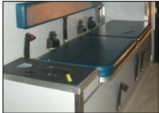
Figure 19. View of manual restraints on the squad bench seat

The patient compartment seating areas were configured with manual lap belts with ALR's and sewn latch plates. Tags sewn on the webbing indicated that the date of manufacture was July 1995. The retractor and buckle assemblies were vertically mounted on the wall behind each seating position on the squad bench seat and "CPR" seat. The lower anchor bolts for the retractor and buckle assemblies were mounted with a 90 degree steel mounting bracket to the right wall and the base of the seats and approximately 13.3 cm (5.3") below the height of the seat cushions. The buckle assemblies were mounted with plastic sleeves that measured 17.8 cm (7.0") in height above the anchor bolts. The buckles and webbing extended 6.4 cm (2.5") above the top aspect of the sleeves.