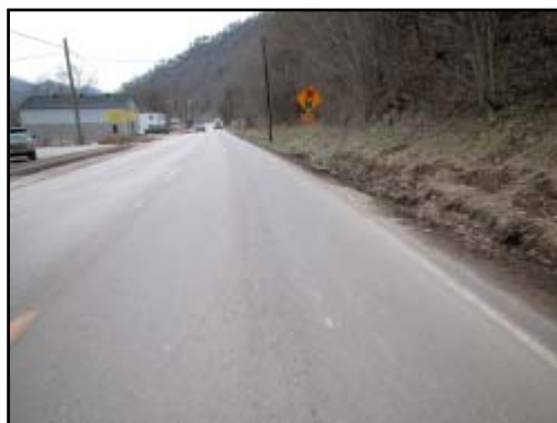
Figure 3. Area of final rest for the ambulance

The front wheels of the ambulance furrowed in the hillside and the ditch for approximately 5 m (16'). The furrowing of the wheels and CW yaw caused the ambulance to tip over onto its left side and slide a short distance to final rest on the north roadside ( Figure 3 ). Contact with the road surface was limited to the left side aspect of the ambulance cab and patient compartment.