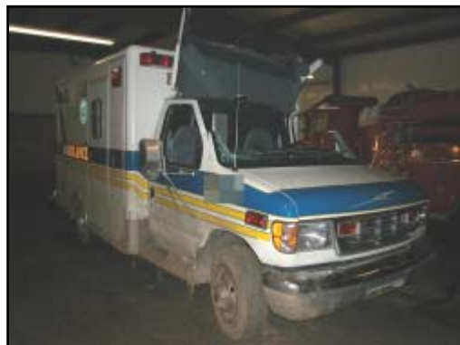
Figure 14. Right side view of the ambulance

Large amounts of dirt were also present on the right front wheel, the right side running board, and the lower aspect of the right side of the patient compartment ( Figure 14 ). The right front wheel cover was deformed on the center aspect. The rear aspect of the right front fender was deformed slightly at the bottom aspect. The lower diamond plate trim piece aft of the right rear wheel was separated.