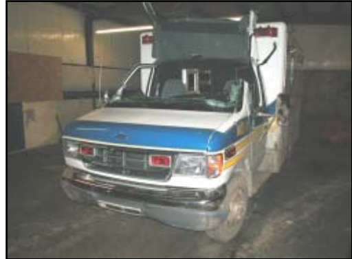
Figure 1. Damaged 1997 Ford E-350/Horton Ambulance

NHTSA's Special Crash Investigation Division was alerted to the crash through an Emergency Medical Service web site. The news link was e-mailed to the General Dynamics SCI team. The SCI team initiated telephone follow-up with the investigating police agency and the ambulance service. Cooperation was established with both agencies and an on-site investigation was initiated. This investigation was conducted by SCI in conjunction with the Center for Disease Control's (CDC) National Institute of Occupational Safety and Health (NIOSH).