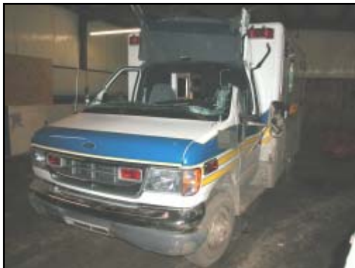
Figure 10. Front left view of damaged ambulance

Large amounts of dirt were present on the left front wheel, left side running board, and the left side aspect of the patient compartment. The left front wheel sustained abrasions. The left outside mirror was abraded and rotated counterclockwise (CCW). The forward mount on the top aspect and both bottom mounts for the outside mirror were separated from the exterior door panel. The left front door panel sustained minor induced damage as a result of the lateral mirror frame displacement caused by the left side rollover ( Figure 11 ). Induced damage also resulted from rescue efforts as the left A-pillar and the door window frame was cut.