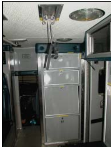
Figure 17. View of deformed IV bag holder, fractured aerosol can bracket, and deformed cabinetry

The hinged plastic cover of the sharps/waste cabinet forward of the squad bench seat was fractured on the inboard aspect. The fracture measured 10.2 cm (4.0") in length and was oriented at a 45 degree angle. It began below the spring-hinged flap and extended toward the front inboard corner.