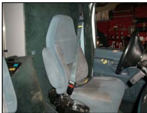
Figure 18. View of drivers safety belt and buckle pretensioner

The front seat positions in the 1997 Ford E-350/Horton ambulance were configured with manual 3-point lap and shoulder belts with sliding latch plates. Both manual restraints were configured with adjustable D-rings that were in the full-down positions and had 8.9 cm (3.5") of vertical travel. There was no loading evidence on the driver's latch plate plastic, or D-ring. However, the safety belt webbing exhibited stretching over a total distance of 91.4 cm (36.0"), which began 31.8 cm (12.5") above the outboard plastic sleeve. An area of multiple small abrasions was located 49.5 cm (19.5") from the outboard sleeve and extended 17.8 cm (7.0") along the face of the webbing. Both frontal manual restraints were also equipped with buckle pretensioners located on the inboard aspects of the seats. The pretensioners did not fire as a result of the crash. The driver's seat belt is shown in Figure 18 .