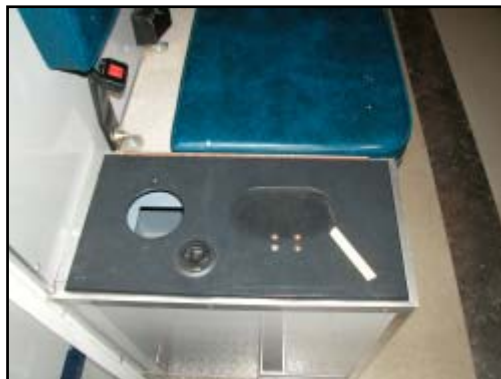
Figure 8. Sharps/waste cabinet

A sharps/waste cabinet ( Figure 8 ) was located forward of the leading edge of the squad bench seat that measured 27.3 cm (10.5") in length, 53.3 cm (21.0") in width, and 23.5 cm (9.3") in depth. The cabinet cover was configured with a plastic pull-type latch on the forward aspect and was hinged at the rear aspect, adjacent to the forward edge of the squad bench seat. The inboard aspect was configured with a horizontally oriented spring-hinged plastic flap that measured 8.9 x 16.5 cm (3.5 x 6.5") and outboard aspect with a circular hole that measured 8.9 cm (3.5") in diameter. The outboard aspect of the cabinet was used for disposal of used medical items and the used sharps container was under the inboard aspect under the spring-hinged flap.