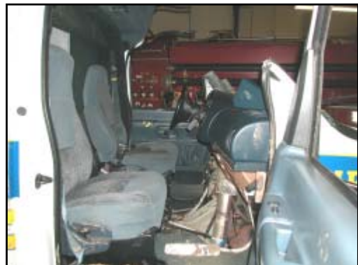
Figure 15. Interior view across the cab of the ambulance

Interior damage to the cab of the 1997 Ford E-350/Horton ambulance as a result of the crash was minor ( Figure 15 ). Two lacerations were present on the upper interior surface of the left front door armrest that measured 1.9 cm (0.8”) and 1.3 cm (0.5”). The interior door damage may have been attributed to extrication efforts, as they were not consistent with occupant contact. The interior trim piece on the left B-pillar was separated. At the time of the vehicle inspection, the plastic trim panel under the front right passenger’s air bag cover flap was removed, the center console which contained the emergency radio and warning device switches was removed, and the center engine shroud was removed. The removal of these components was performed post-crash.