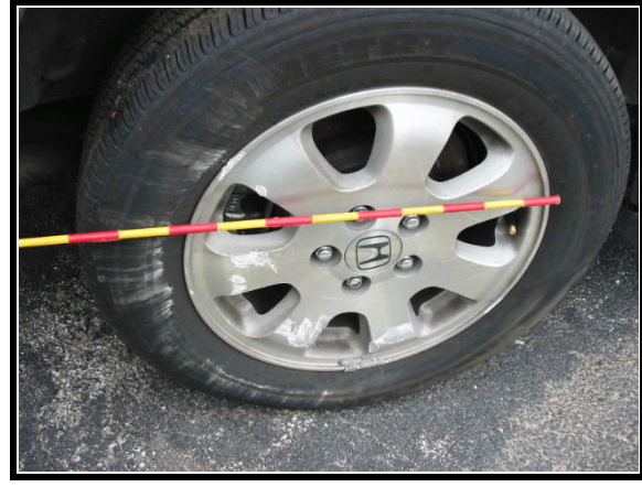
Figure 7. Damage to right rear wheel

The Odyssey was configured with manual 3-point lap and shoulder belts for both front positions, both second row positions, and the third row