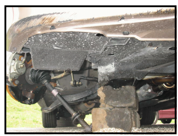
Figure 5 . Front right bumper corner, fascia damage