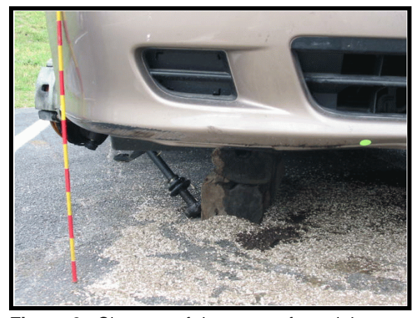
Figure 6 . Close up of damage to front right bumper fascia