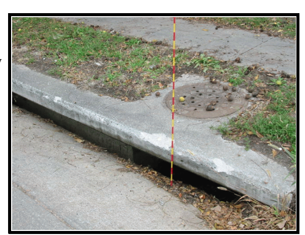
Figure 3. Area of curb impact