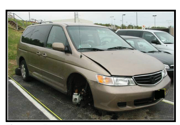
Figure 4. Front right, case vehicle