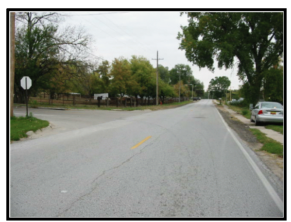
Figure 1. Approach to area of impact (east)

This single vehicle crash occurred in October, 2003 at 1615 hours in the state of Nebraska. The crash occurred just outside of a "T" intersection. The western leg of the intersection is a two lane, two way roadway. The concrete roadway was flat and dry. The speed limit is 48 km/h (30 mph). The northern leg of the intersection is a three-lane, two way roadway. The roadway consists of a northbound travel lane, a southbound travel lane, and a southbound left turn lane. At the eastern road edge there is a storm drain that is in line with the concrete curb.