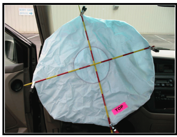
Figure 8. Driver's air bag

The driver and front right passenger air bags deployed during the curb impact. The driver's air bag module was an "H" design and located in the center hub of the steering wheel rim. The top flap measured 16.0 cm (6.3 in) x 12.0 cm (4.7 in) high. The bottom flap measured 16.0 cm (6.3 in) wide x 9.0 cm (3.5 in) high. There was no contact evidence on the cover flaps. The