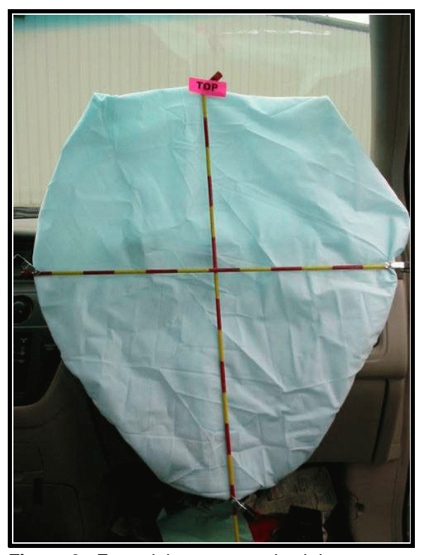
Figure 9. Front right passenger's air bag

diameter of the air bag measured 50.0 cm (19.6 in) in its deflated state (Fig. 8). There were circular vent ports located at the 10 and 2 o'clock positions on the back of the air bag, and two internal tethers. There were color transfers to the bottom left of the air bag face.