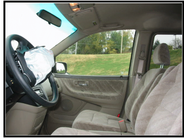
Figure 13 . Side view showing front right seat occupant position