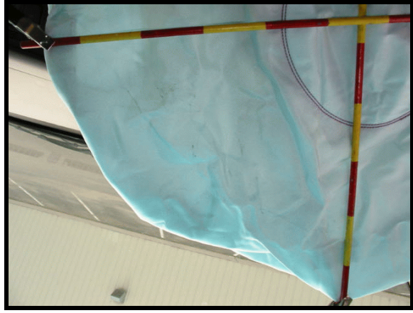
Figure 12 . Bottom left of face of driver's air bag (image rotated)

The unrestrained 15-year-old male front right passenger was seated, forward facing, in the fabric covered bucket seat. The seat had been adjusted to the middle seat track position. The seat back was essentially upright. As the case vehicle approached the intersection the driver began a sharp left hand turn. The left hand turn pitched this occupant to right somewhat—causing him to possibly load the right side door. At impact with the curb the front right passenger's air bag deployed. This occupant likely engaged the deployed air bag but there were no resulting contacts or injuries.