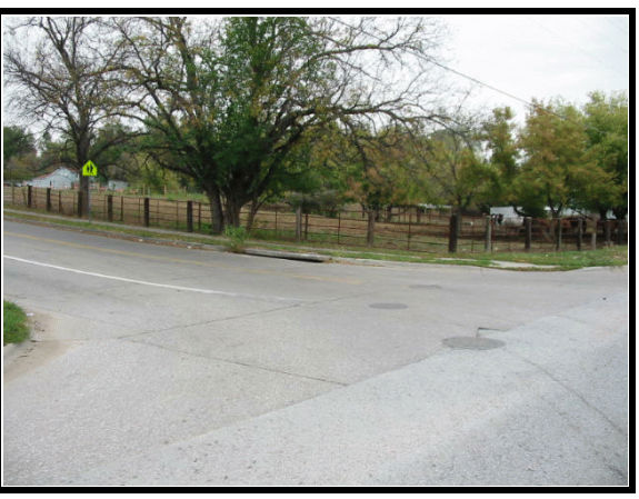
Figure 2 . Left hand turn, approach to area of impact (east to north)

Neither occupant was injured in this crash. Police indicate that the vehicle sustained $2000 in damages. The vehicle was towed from the scene to the owner's residence due to damage. The body shop removed and replaced the air bag modules and the EDR. All the removed components were provided to the NASS team.