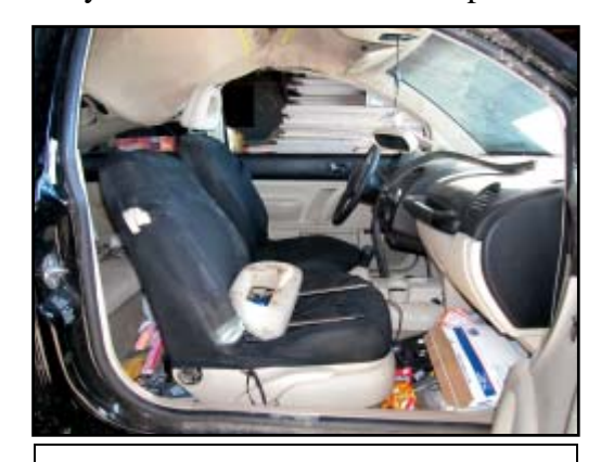
Figure 10. View of front right seat and separated front right head restraint