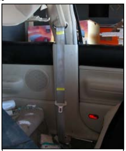
Figure 13. View of post-crash driver's seat belt

The 1998 Volkswagen Beetle was configured with manual 3point lap and shoulder belts with sliding latch plates and fixed D-ring anchors for each outboard seating position. The rear seat was not configured with a center seat position, and was not equipped with a manual restraint. The lap portions of the front seat restraints were anchored to steel bars mounted longitudinally along the inboard lower sill areas. The bars measured 27.9 cm (11.0") in length and 1.0 cm (0.4") in diameter. The driver's seat belt was configured with an Emergency Locking Retractor (ELR) and the remaining seat belts were configured with switchable ELR/Automatic Locking Retractors (ALR). Retractor pretensioners were present for the driver and front right passenger seat belts, but it could not be determined if they fired as a result of the rollover. The driver's seat belt was found in the stowed position at the time of the vehicle inspection, and was not utilized by the driver in the crash (Figure 13). In its stowed