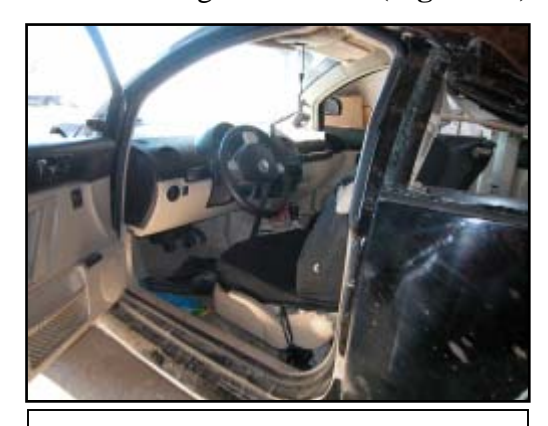
Figure 9. View of deformed steering wheel rim and knee bolster

The interior damage to the 1998 Volkswagen Beetle was attributed to passenger compartment intrusion and occupant contact. Both side doors were operational. The rear hatch was displaced and jammed. The windshield laminate exhibited a minor fracture on the right aspect. The left door glazing, right door glazing, left rear glazing, and backlight glazing disintegrated from impact forces. The bottom half of the steering wheel rim was deformed forward 2.5 cm (1.0") from occupant contact and there were no identifiable contacts to the knee bolster ( Figure 9 ). The rear view mirror assembly was separated from the roof and hanging by the wiring harness. The driver's head restraint was deformed slightly CW, but exhibited no contact evidence. The front right head restraint was completely separated from the seat back. Heavy body fluid transfers (blood) were present on the head restraint fabric, and it appeared to have pulled vertically out of the seat back during the rollover ( Figure 10 ). Two heavy lateral dirt transfers were present above