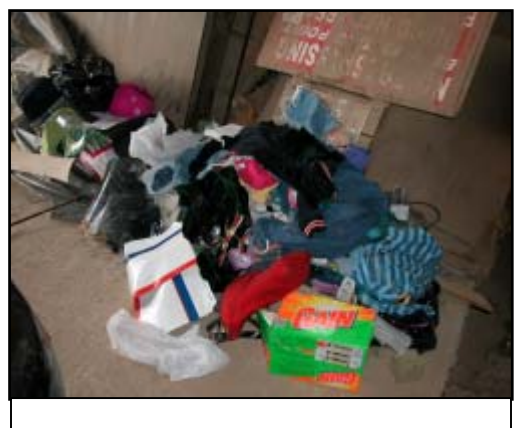
Figure 6. Additional cargo items found in the vehicle