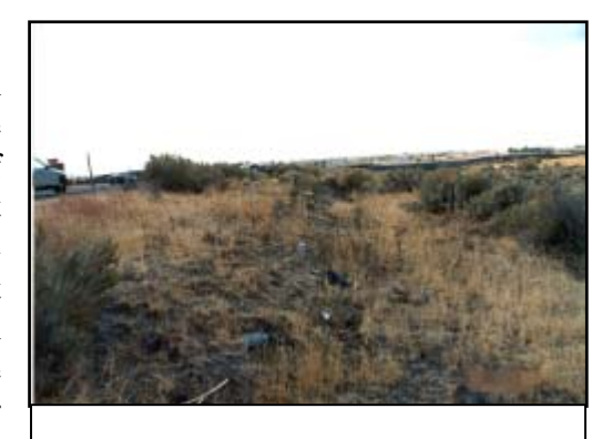
Figure 3. Southbound view of the rollover trajectory

The crash was not discovered for approximately eight hours. A passing motorist detected the vehicle's reflection behind the sagebrush and determined that a crash had occurred. The passing motorist telephoned the police and reported the crash. Police found the female driver of the Volkswagen south of the vehicle's final rest position. She was found face-down and was