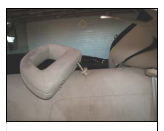
Figure 11. Damaged rear left head restraint

The rollover event resulted in several intruded components. Lateral intrusions included the left front door, the left roof side rail, the left rear side panel, and the left C-pillar. Vertical intrusions included the roof, left roof side rail, the left C-pillar, and the backlight header.