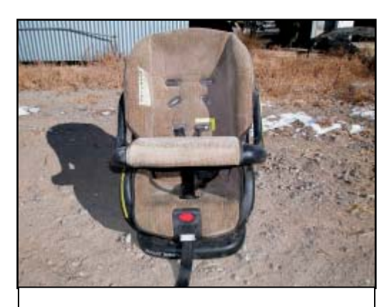
Figure 15. Cosco Regal Ride CSS

The Cosco Regal Ride ( Figure 15 ) was a convertible CSS with a tray shield installed forward-facing in the rear right position of the Volkswagen Beetle. A locking clip was not required due to the use of the ALR, and the locking clip was found attached to the rear aspect of the CSS. The CSS manufacture date was June 2002 and the CSS was not listed on the NHTSA recall list. The 1998 Volkswagen Beetle was not equipped with lower anchors, but was configured with tether anchors on the rear outboard positions. Although the CSS was originally configured with a tether strap, it was not present on the CSS at the time of the inspection. The harness system was routed through the lowest harness