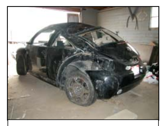
Figure 7. Damaged 1998 Volkswagen Beetle