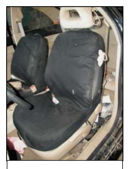
Figure 5. View of driver's aftermarket seat cover

The 1998 Volkswagen Beetle sustained moderate damage as a result of the rollover ( Figure 7 ). The front bumper fascia and both head lamp assemblies were separated from the vehicle. The left mirror was separated. Heavy abrasions from ground contact were present on the upper left A-pillar, left roof side rail, upper left B-pillar, and upper left C-pillar. Minor diagonal abrasions were present on the left front fender, left door, and left rear quarter panel. The left rear fender was fractured and separated. Grass was deposited in the left front door area and the left rear window frame. The left front and left rear alloy wheels were abraded. The left front wheel was turned inward