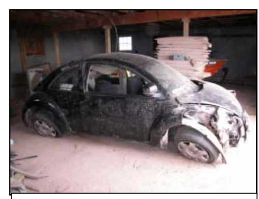
Figure 8. Right side view of damaged Volkswagen Beetle

approximately 30 degrees and the left rear wheel was displaced slightly rearward. The left C-pillar and left rear aspect of the roof were crushed vertically with a lateral component due to the rollover. The maximum roof crush was located at the left C-pillar area. The roof exhibited lateral abrasions. The rear hatch was displaced. The right roof side rail and right C-pillar sustained moderate abrasions. The top aspect of the right door was displaced outward which created a gap between the top aspect of the door frame and the roof side rail that measured 17.8 cm (7.0"). The right front fender was fractured and separated. The right sill sustained lateral crush that measured 10.2 cm (4.0") and was located 78.7 cm (31.0") rear of the right A-pillar.