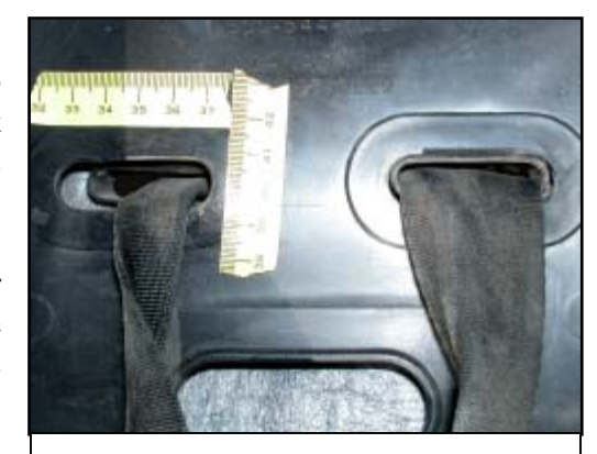
Figure 21. Close up of displaced left plastic sleeve and harness straps

There was no loading evidence on the right harness strap, however minor stretching of the left harness strap was present above the harness retainer clip as a result of the child's loading to the harness system. Plastic sleeves were secured in each harness slot by plastic tabs on the rear upper and rear lower aspects of the sleeves. Due to the loading of the left harness strap, the lower left plastic sleeve was displaced forward from the harness slot 1.3 cm (0.5"). Figure 21 depicts the displaced left plastic sleeve.