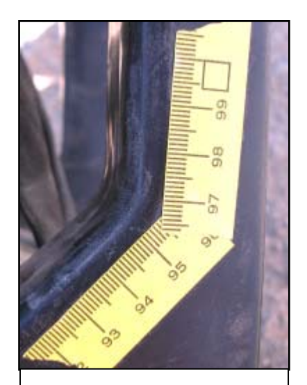
Figure 20. Close-up of left side seat belt scuff