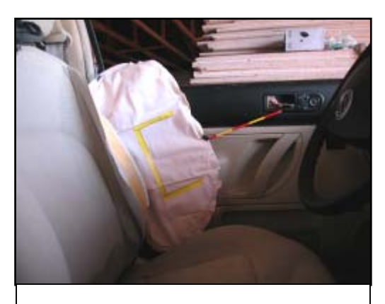
Figure 23. Area of abrasion on the driver's side impact air bag

The side impact air bags measured 55.9 cm (22.0") in height and 33.0 cm (13.0") in width and extended vertically from the seat cushion to the top of the seat back. The air bags were not tethered and were vented back through the module. The inboard aspect of the driver's side impact air bag exhibited an area of light abrasion that measured 19.7 cm (7.8") in height and 10.2 cm (4.0") in width ( Figures 23 and 24 ). The abrasion was a result of engagement against the outboard aspect of the interior seat back due to the impeded deployment caused by the seat cover.