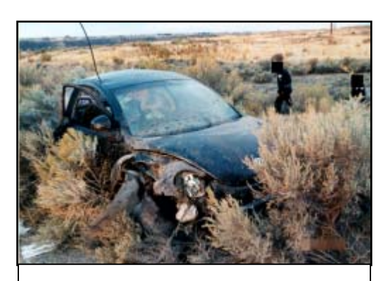
Figure 1. On-scene photograph of the 1998 Volkswagen Beetle at rest

This on-site investigation focused on the performance of a forward-facing convertible child safety seat (CSS) that was installed in a 1998 Volkswagen Beetle. The Beetle was occupied by a 24-year-old female driver and a 14-month-old female child passenger. The driver was unrestrained and the child was restrained in a forward-facing convertible CSS in the rear right position. The driver was operating the vehicle during nighttime hours under the influence of alcohol and failed to negotiate a left curve. The vehicle departed the right roadside and the driver overcorrected by steering left. The Beetle initiated a counterclockwise yaw and rolled over two complete turns. The unrestrained driver was ejected