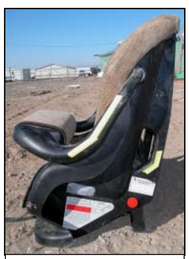
Figure 19. View of left side damage to the CSS