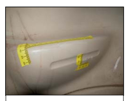
Figure 12. View of abrasion and laceration on right rear armrest