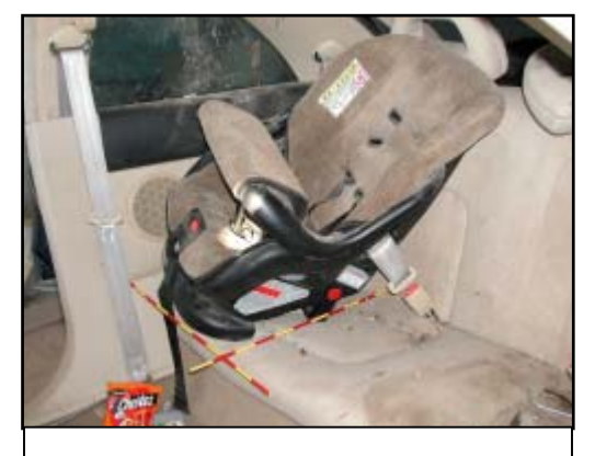
Figure 17. Post-crash position of the CSS

The CSS was found in the rear right seating position and installed forward-facing with the manual 3-point lap and shoulder belt ( Figure 17 ). The vehicle seat belt was in the locked mode and was routed through the forward-facing belt path. At the time of the vehicle inspection, the CSS had not been moved since the time of the crash. The CSS was found leaning to the left toward the center of the vehicle at a 20 degree angle from vertical and rotated slightly CW within the vehicle seat belt. The right front aspect of the CSS was resting directly against the right rear interior panel. Although the vehicle seat belt was buckled, the CSS was able to move greater than 2.5 cm (1.0") side-to-side and fore-and-aft. The kickstand was in the down