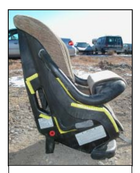
Figure 18. View of right side damage on the CSS

The Cosco convertible CSS sustained moderate damage as a result of the crash ( Figures 18 and 19 ). Abrasions on the left outboard aspect of the tray shield began 11.4 cm (4.5") below the pivot point and extended 17.8 cm (7.0") forward along the left arm of the tray shield. A heavy abrasion from loading against the vehicle seat belt webbing was present on the left outboard aspect of the forward-facing belt path that measured 7.6 cm (3.0") in width along the contour of the belt path and 0.6 cm (0.3") in length ( Figure 20 ). The right outboard aspect of the belt path was moderately abraded on the top aspect from loading against the shoulder belt and on the bottom aspect from loading against the lap belt. The shoulder belt abrasion measured 3.8 cm (1.5") in width and the lap belt abrasion measured 5.1 cm (2.0") in width. A large "V"-shaped abrasion was located below and forward of the forward-facing belt path on the right side of the CSS as a result of engagement against the plastic right rear side panel of the Volkswagen Beetle. The abrasion measured 7.6 cm (3.0") in height and 7.0 cm (2.8") in width. Contact with the plastic right side panel of the vehicle interior also resulted in scuffs on the right outboard aspect of the tray shield that measured 20.3 cm (8.0") along the tray shield arm and scuffs on the right front side plane of the CSS that measured 19.1 cm (7.5") in length.