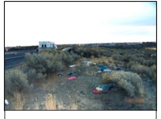
Figure 4. Miscellaneous contents ejected from the vehicle