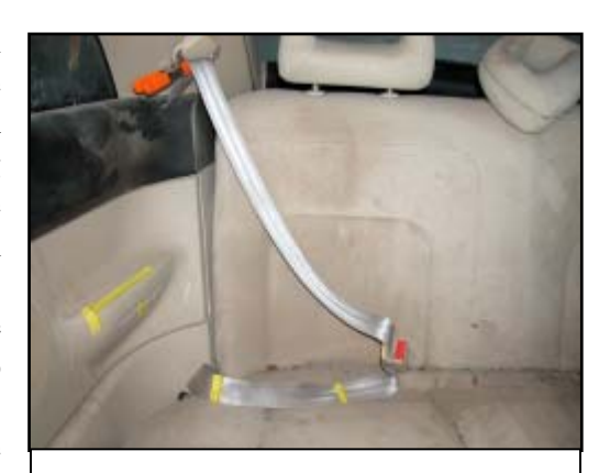
Figure 14. View of rear right seat belt

The rear right seat belt ( Figure 14 ) was found buckled and routed through the forward-facing belt path of the CSS during the vehicle inspection. In the buckled position, the length of the shoulder belt webbing measured 62.2 cm (24.5") between the D-ring and the latch plate. The lap belt portion measured 58.4 cm (23.0") between the latch plate and outboard anchor. The retractor was found to be in the locked mode. The Volkswagen's rear right latch plate showed no abrasions indicative of historical usage. The plastic housing on the latch plate was abraded due to the loading of the webbing during the rollover. Stretching of the webbing began at the stop button and extended 21.6 cm (8.5") upward. A black linear transfer that