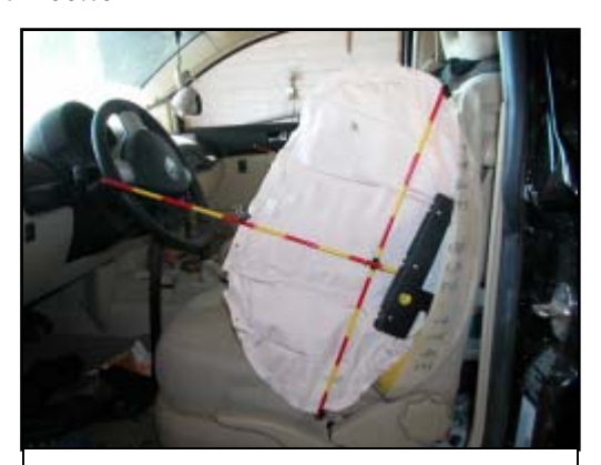
Figure 22. Deployed driver's side impact air bag

The side impact air bags deployed forward from the respective seat backs through a vertical tear seam on the forward aspect of the seat backs. The tear seam measured 57.2 cm (22.5") in height. The side impact air bag was housed in a plastic module surrounded by Styrofoam filler within the seat back. The interior