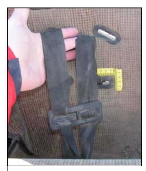
Figure 16. View of harness straps and harness retainer clip

The left harness strap was permanently routed through the retainer clip and the right harness strap was inserted from the front aspect versus the rear aspect (Figure 16). Since the right harness strap was routed through the retainer clip from the front, it was not held in position by the plastic locking tab on the retainer clip. The left harness strap had two complete twists in the webbing between the rear harness bracket and the retainer clip. It had two additional complete twists between the retainer clip and the latch plate. The right harness strap had one complete twist between the rear harness bracket and the retainer clip and one complete twist between the retainer clip and the latch plate. It was not known how tight the harness straps were in relation to the child passenger, however, the harness adjustment webbing on the front aspect of the CSS was extended 35.6 cm (14.0"). The latch plate showed abrasions indicative of regular usage.