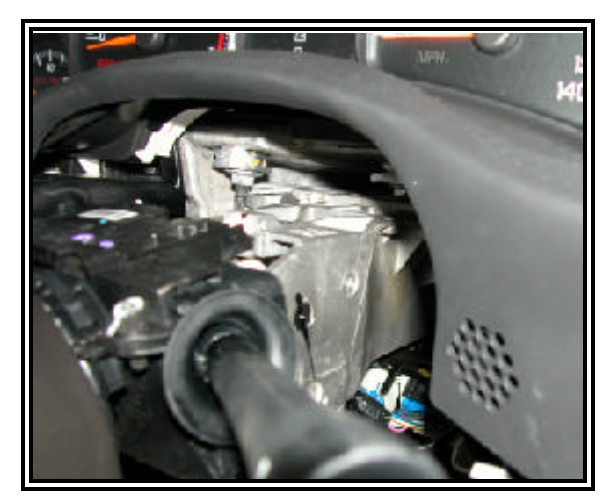
Figure 9: View of the shear capsule separation.

The exterior panel to the driver's knee bolster was found on the rear seat. It may have been separated during the crash sequence. However, there was no evidence of direct contact or deformation to the plastic bolster panel or to the bolster's metal backer.