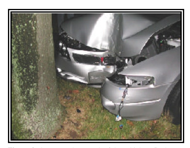
Figure 2: On-scene photograph of the vehicle at final rest.

The crash occurred with the center and left aspects of the Pontiac's front plane impacting a 46 cm (18 in) diameter oak tree. The force of the crash deformed the vehicle's bumper reinforcement rearward into the engine compartment. The maximum crush measured 71.9 cm (28.3 in) and was located 13 cm (5 in) left of the vehicle's centerline. The slight offset of the impact force caused the vehicle to rotate less than 5 degrees counterclockwise during its rebound to final rest. The Pontiac came to rest approximately at the point of impact. Figure 2 is an on-scene police photograph of the vehicle at final rest. The total delta V calculated by the Barrier algorithm of the WINSMASH model was 37 km/h (23 mph). Figure 3 , page 3, is a schematic of the crash generated by the police investigation.