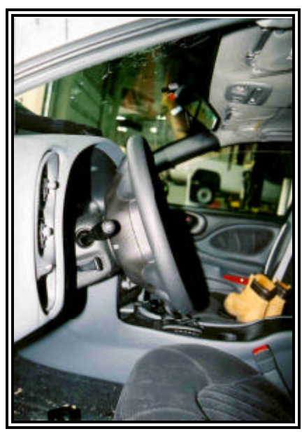
Figure 8 : Left lateral view of the steering wheel rim.