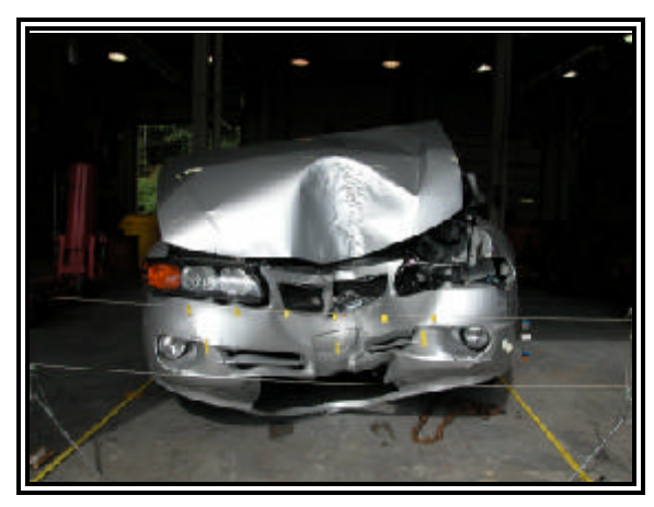
Figure 4: Pontiac front view.

The 2003 Pontiac Bonneville, Figure 4 , was identified by the Vehicle Identification Number (VIN): 1G2HX52KX34 (production sequence deleted). The vehicle's date of manufacture was 08/02. The odometer had recorded 2,660 km (1,653 miles). The Pontiac was owned by a rental car agency and was being operated under a rental agreement at the time of the crash. The SE model, 4-door sedan was equipped with a 3.8 liter, V6 engine linked to a four-speed automatic transmission. The vehicle was also equipped ABS power brakes, power steering and an interior package to include power windows and locks and a 6-way adjustable driver seat. The manual restraint