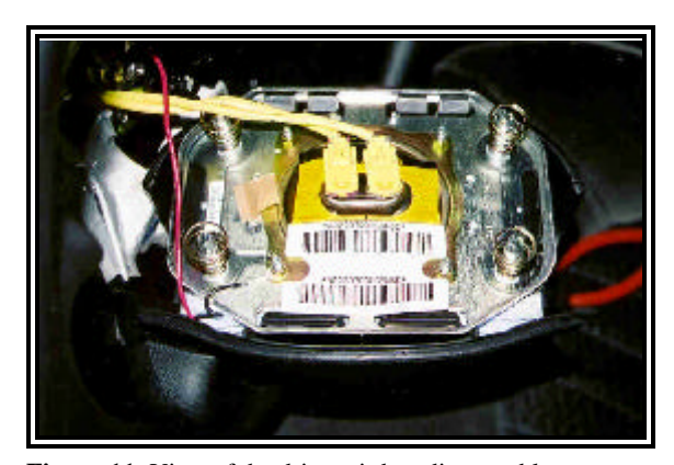
Figure 11: View of the driver air bag disassembly.