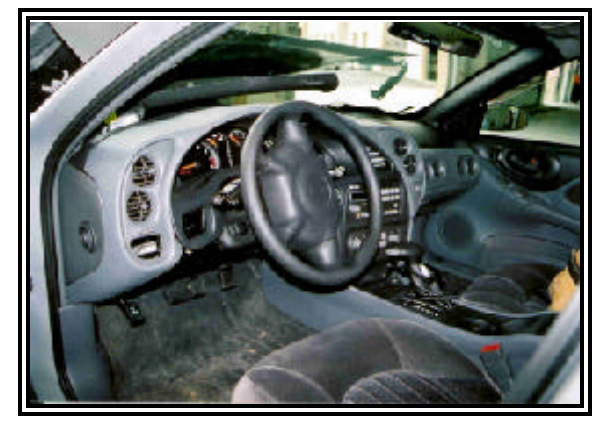
Figure 6: Left interior view.

The left upper aspect of the windshield exhibited a fracture pattern consistent with a head contact. The center of the fracture was located 20.3 cm (8.0 in) below the windshield header and (4.8 in) inboard (right) of the left A-pillar. Several strands of black hair were noted within the fracture. A skin oil smear was located directly above the fracture site. The gross overall dimensions of the smear measured 6.4 cm x 30.5 cm (2.5 in x 12.0 in). The trim panel covering the left A-pillar was displaced from its designed position from probable left hand contact. The contact pattern measured 15 cm (6 in) in length and began on the trim panel's upper aspect. There was no deformation to the sheet metal underlying the left A-pillar trim.