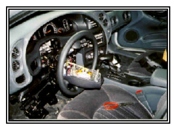
Figure 10: Non-deployed driver air bag.

The driver air bag module was attached to the center hub of the steering wheel. The front right passenger air bag was a top-mount design located in the right aspect of the instrument panel. During the SCI inspection, the driver air bag module was disassembled from the steering wheel hub, Figures 10 and 11 . All the mechanical and electrical connections on the back side of the module appeared to be intact. There were no obvious assembly problems. The following nomenclature identified the driver air bag module: AB2237Q3UCNSD.