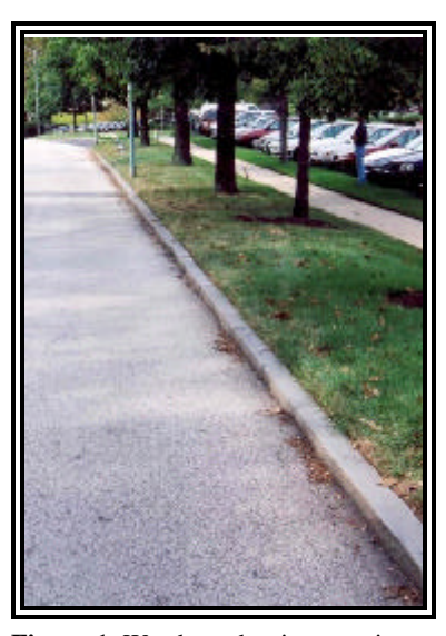
Figure 1: Westbound trajectory view.

This crash occurred during the nighttime hours in September 2002. At the time of the crash, it was dark and the area of the crash was illuminated by overhead street lights. It was raining and the road surface was wet. Figure 1 is a trajectory view approaching the crash scene. The crash occurred off the right shoulder of a five lane east/west asphalt road in an urban commercial setting. The traffic way was bordered by 15 cm (6 in) barrier curbs and grass shoulders. A row of deciduous trees was planted parallel to the road and was located approximately 2.1 m (7.0 ft) outboard of the curb. This subject roadway intersected a north/south arterial road approximately 66 m (217 ft) east of the point of impact. The speed limit in the area of the crash was 40 km/h (25 mph).