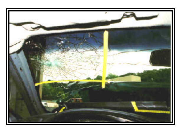
Figure 7: Windshield and left A-pillar contact.

The 4-spoke tilt steering wheel was adjusted to the full up position. The steering wheel was rotated approximately 90 degrees clockwise. There was no steering wheel rim deformation, Figure 8 . During the crash sequence, the unrestrained driver loaded the plane of the rim and completely separated the steering column from the shear capsules. The column had dropped down and was not attached to the instrument panel, Figure 9 . The horizontal distance from the top sector of the steering wheel rim to the brow of the instrument panel measured 5 cm (2 in).