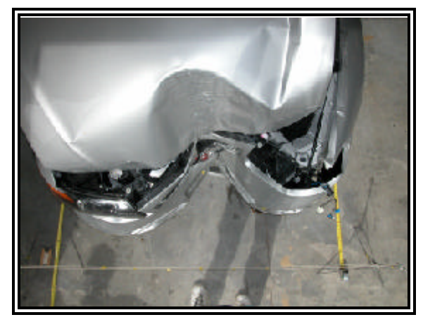
Figure 5 : Overhead view of the frontal damage.

48.3 cm (19.0 in) left of center. The combined width of the direct and induced damage extended across the vehicle's entire 137 cm (54 in) frontal end width. The impact deformed and collapsed the bumper reinforcement bar rearward into the engine compartment. The maximum crush measured 71.9 cm (28.3 in) and was located 13 cm (5 in) left of the vehicle's centerline. The residual crush profile was as follows: C1 = 5.0 cm (2.0 in), C2 = 22.0 cm (8.7 in), C3 = 62.0 cm (24.4 in), C4 = 47.0 cm (18.5 in), C5 = 21.0 cm (8.3 in), C6 = 1 cm (2.5 in). The longitudinal length of the direct contact on the hood measured 46 cm (18 in). The impact force shifted the left and right fenders rearward into their respective A-