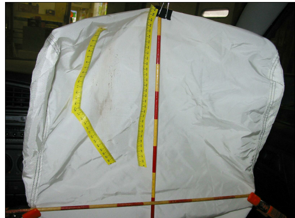
Figure 10: Front surface of case vehicle's deployed front right passenger air bag showing vertically oriented contact area approximately midline within left upper quadrant (case photo #48)