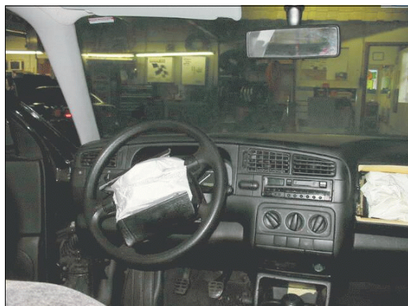
Figure 7: Case vehicle’s driver seating area showing deployed driver air bag and no apparent evidence of occupant contact to steering wheel, instrument panel, or greenhouse areas (case photo #30)

Vehicle Interior: Inspection of the case vehicle’s interior ( Figures 7 and 8 ) revealed that there was no evidence of occupant contact on the interior surfaces of the case vehicle. Furthermore, there was no evidence of intrusion to the case vehicle’s interior, no evidence of compression to the energy absorbing shear capsules in the steering column, and no deformation to the steering wheel rim.