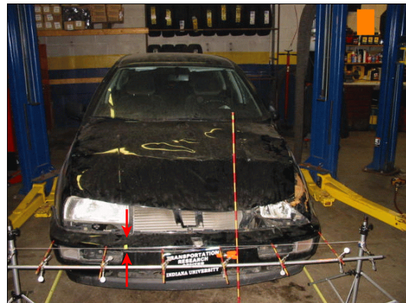
Figure 3: Elevated view of case vehicle's frontal damage with contour gauge present at bumper level; Note: yellow tape (arrows) indicates width of direct damage on bumper (case photo #07)

Post-Crash: According to the case vehicle's driver, the case vehicle came to rest at impact (Figure 2 above). Based on the available information, the case vehicle and the Honda both moved slightly forward before coming to rest in the inside eastbound lane, heading east.