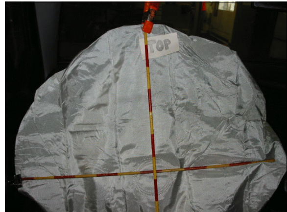
Figure 9: Case vehicle's deployed driver air bag showing no apparent evidence of occupant contact (case photo #44)

The front right passenger's air bag was located in the middle of the instrument panel. An inspection of the front right air bag module's cover flaps and the air bag's fabric revealed that the cover flaps opened at the designated tear points, and there was no evidence of damage during the deployment to the air bag or the cover flaps. The front right passenger's air bag was designed without any tethers. The front right air bag had no vent ports. The deployed front right air bag was rectangular with a height of approximately 72 centimeters (28.3 inches) and a width of approximately 45 centimeters (17.7 inches). An inspection of the front right passenger's air bag fabric revealed obvious contact evidence on the front surface. Specifically, on the front surface there was large vertically oriented skin transfer measuring 8 x 21 centimeters (3.1 x 8.3 inches) near the middle of the left upper quadrant ( Figure 10 ). The transfer was located 7 centimeters (2.8 inches) to the right