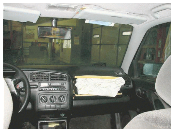
Figure 8: Case vehicle’s front right passenger seating area showing deployed front right passenger air bag and no apparent occupant contact evidence to mid and right instrument panels or greenhouse areas (case photo #32)

Damage Classification: Based on the vehicle inspection, the CDC for the case vehicle was determined to be: 12-FDEW-1 (0 degrees) . The WinSMASH reconstruction program, missing vehicle algorithm, was used on the case vehicle's highest severity impact. The Total, Longitudinal, and Lateral Delta Vs are, respectively: 17.0 km.p.h. (10.6 m.p.h.), -17.0 km.p.h. (-10.6 m.p.h.), and 0.0 km.p.h. (0.0 m.p.h.). The case vehicle was towed due to damage.