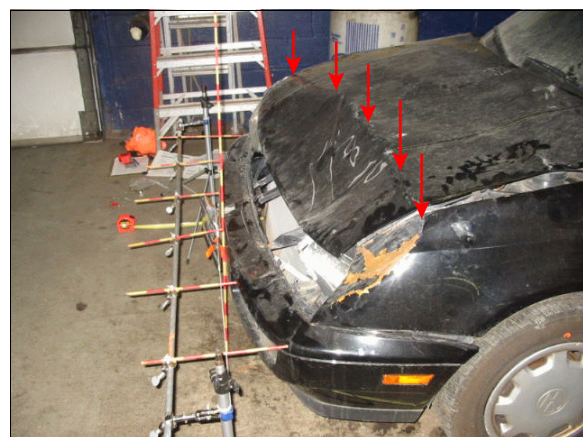
Figure 4: Case vehicle's frontal damage viewed along reference line from left with contour gauge present at bumper level; Note: ridge line (arrows) on hood shows above bumper deformation (case photo #09)

Inspection of the vehicle's interior revealed adjustable front bucket seats with adjustable head restraints; a non-adjustable back bench seat with adjustable head restraints for the back outboard seating positions; continuous loop, three-point, lap-and-shoulder, safety belt systems at the front and back outboard positions; and a two-point, lap belt system at the back center position. The front seat belt systems were equipped with manually operated, upper anchorage adjusters for the "D"-rings. The driver's upper anchorage adjuster was located in the middle position, but the front right passenger's adjuster was located in the down-most position. The vehicle was equipped with knee bolsters for both the driver and front right passenger, neither of which showed evidence of