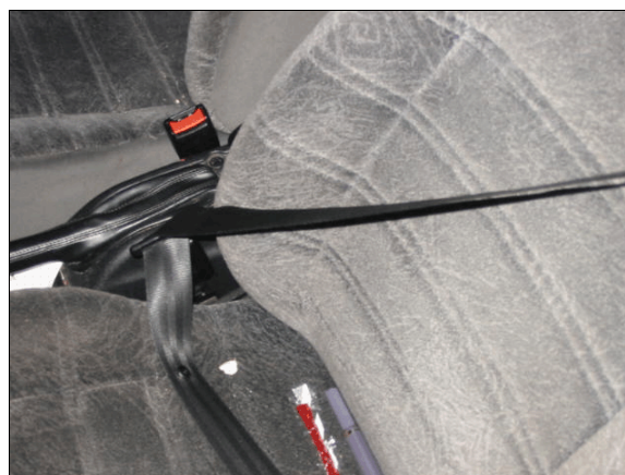
Figure 12: Case vehicle's driver safety belt showing slight waving in the lap portion of the belt indicating probable restraint use (case photo #33)

Based on this contractor's vehicle inspection, the case vehicle's driver was most likely restrained by her available, active, three-point, lap-and-shoulder, safety belt system. Furthermore, there were no reports of belt pattern bruising and/or abrasions to the driver's body, but the inspection of the driver's seat belt webbing, "D"-ring, and latch plate showed trace evidence of loading (i.e., slight waving on the belt's webbing— Figure 12 ).