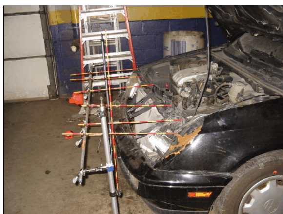
Figure 5: Case vehicle’s frontal damage viewed along reference line from left with contour gauge positioned above bumper at upper radiator support brackets (case photo #12)

Exterior Damage: The case vehicle’s contact with the Honda involved the entire front with the damage distributed all the way across. Direct damage began at the front left bumper corner and extended 108 centimeters (42.5 inches) inward along the front bumper ( Figure 3 above). Crush measurements were taken at the bumper level ( Figure 4 above) and at the top of the radiator support ( Figure 5 ), and values were averaged where appropriate. Residual maximum crush along the bumper was measured as 2 centimeters (0.8 inches) at all six “C” locations. Above the bumper (i.e., along the radiator support) the residual maximum crush was measured as 21 centimeters (8.3 inches) at C 3 . The average residual maximum crush at C 3 was 12 centimeters (4.7 inches). The table below shows the case vehicle’s crush profile ( Figure 6 ).