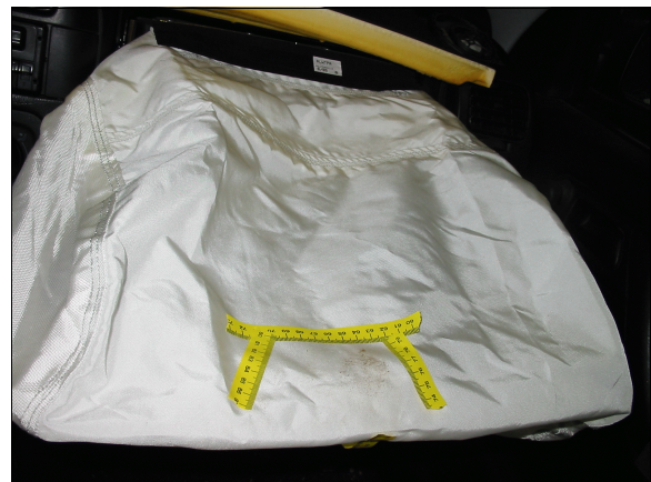
Figure 11: Top surface of case vehicle's deployed front right passenger air bag showing occupant contact evidence near 6 o'clock position (case photo #50a)