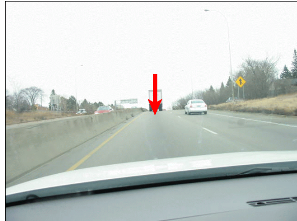
Figure 1: Case vehicle's eastward travel path in inside eastbound lane; Note: arrow indicates approximate impact location (case photo #03)

Pre-Crash: The case vehicle was traveling east in the inside through lane of the eastern roadway and intended to continue straight ahead. The Honda was also traveling east in the inside through lane and, according to the Police Crash Report, had come to a stop just prior to the crash, intending to