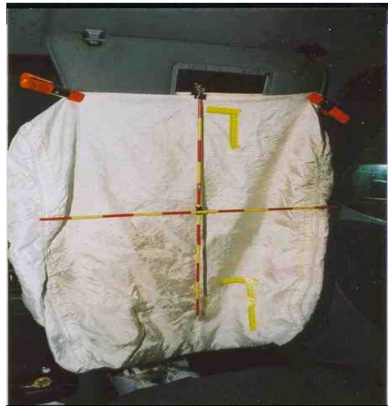
Figure 7 - Passenger's air bag.