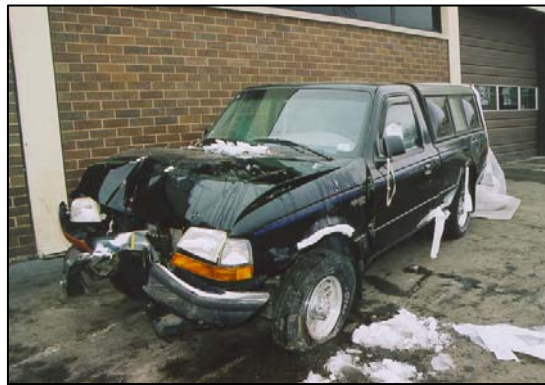
Figure 4 - Damaged 1998 Ford Ranger Pickup.

The 1998 Ford Ranger XLT sustained moderate frontal damage as a result of the impact with the signpost concrete support base ( Figures 4 ). The direct contact damage began 58.0 cm (22.8 in) inboard of the front right bumper corner and extended left 17.0 cm (6.7 in). The impact deformed the entire front end width resulting in a combined direct and induced damage length (Field L) of 129 cm (50.8 in). Six crush measurements were documented at the level of the bumper: C1 = 0 cm, C2 = 4 cm (1.6 in), C3 = 17 cm (6.7 in), C4 = 41 cm (16.1 in), C5 = 17 cm (6.7 in), C6 = 4 cm (1.6 in). The Collision Deformation Classification (CDC) for this impact was 12-FCEN-2 with a principal direction