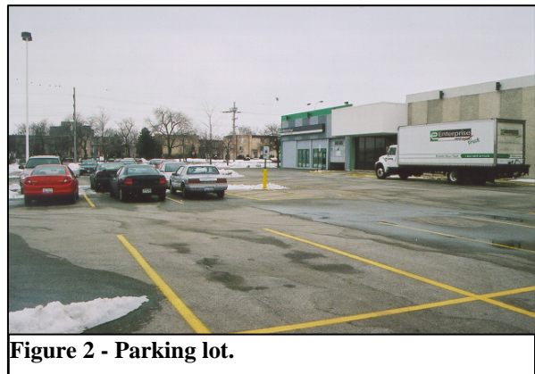
Figure 2 - Parking lot.

The 48 year old female driver of the 1998 Ford Ranger XLT pickup truck completed her shift at a nearby fast-food restaurant and was giving a co-worker a ride home, operating the vehicle in a southwesterly direction (diagonally) across the large parking area ( Figure 2 ). As the vehicle approached the south exit of the parking lot, the driver failed to observe the signpost concrete support base. The police reported no tire marks present at the scene indicative of possible driver avoidance maneuvers.