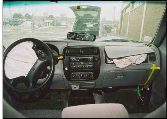
Figure 5 - Overall view of the instrument panel.

Interior damage to the Ford Ranger was moderate and was attributed to occupant contact. Scuff marks were documented on the left knee bolster along with a large indentation to the right knee bolster. Deep scratch marks were identified on the (column mounted) transmission selector lever. The rear view mirror was fractured and separated from the windshield. Abrasions and scrub marks were documented on the right sun visor (vanity mirror undamaged). Blood spattering was noted on the headliner adjacent to the left windshield header and right backlight header. Additional blood spattering was noted on the right B-pillar and backlight. No steering wheel rim deformation or column compression was identified; however, the steering mechanism was separated. No component intrusions were found in the vehicle. Figure 5 is an overall view of the instrument panel.