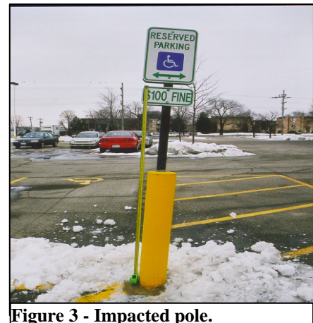
Figure 3 - Impacted pole.

The front right area of the Ranger impacted the signpost concrete support base ( Figure 3 ) which resulted in moderate damage. Impact speeds and velocity changes were computed utilizing the WinSMASH reconstruction program. The trajectory algorithm calculated a speed at impact of 38.1 km/h (23.7 mph), as the damage algorithm computed a barrier equivalent velocity change of 29.2 km/h (18.1 mph) with a matching negative longitudinal component. Impact resulted in deployment of the Ford's redesigned frontal air bag system. The