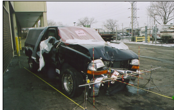
Figure 1 - Overall view of 1998 Ford Ranger pickup.

This on-site investigation focused on the injury mechanisms that caused the death of a 48 year old restrained female driver of a 1998 Ford Ranger XLT pickup truck ( Figure 1 ). The Ford Ranger pickup truck was equipped with redesigned frontal air bags for the driver and front right passenger positions which deployed as a result of a frontal collision with a concrete base supporting a signpost. The driver of the Ford had Klippel-Feil Syndrome, a rare degenerative disease of the cervical vertebrae that produced a natural fusion of her neck. The driver lived a normal life despite her condition. She was