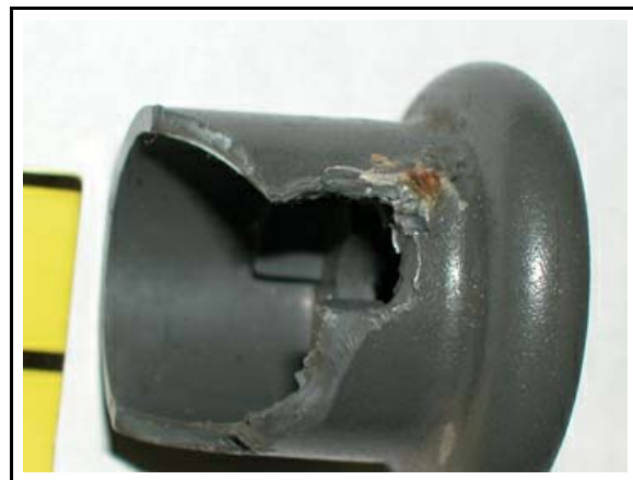
Figure 14. Front right seat belt anchorage adjustment knob