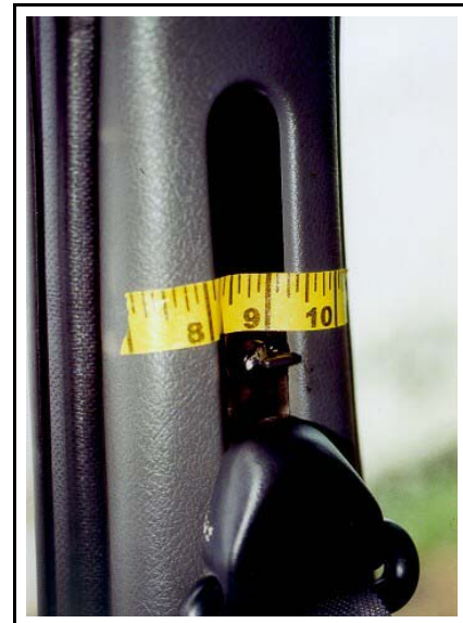
Figure 13. Front right seat belt anchorage adjustment