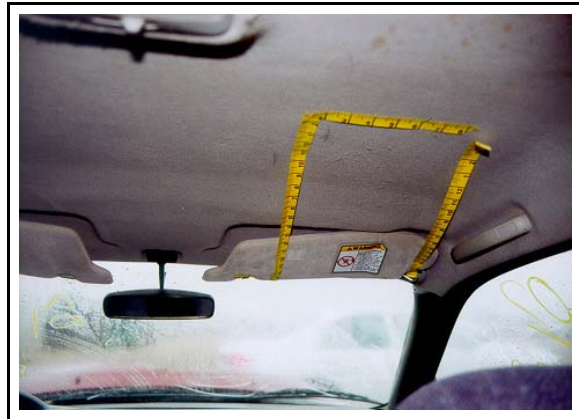
Figure 12. Front right header occupant contact

engaged the front right passenger's air bag and was thrown rearwards into the front right "B" pillar where the right side of his forehead struck the seat belt upper anchorage adjustment knob/steel shaft which was in the full down position. The knob was broken off, cracked and smeared with blood and other unknown matter. The 3-year-old child sustained an exposed depressed skull fracture (round puncture wound) with intracranial contents noted, and a laceration (7.0 cm/2.8 in by 7.0 cm/2.8 in) on his right forehead above his right eye from contacting the anchorage adjustment knob. There was an abrasion to right shoulder/upper arm 8.0 cm by 3.0 cm (3.1 in by 1.2 in). The emergency room medical records noted an apparent bony drop-off between the C5-C6 posterior neck, and the medical examiner's report indicated a possible cervical neck fracture. No x-rays were performed at the hospital and the medical examiner only conducted an external examination of the body. The driver indicated that the 3-year-old child came to rest on the rear left floor area behind the driver. The driver removed him from the vehicle and they were both transported to a local hospital by a passing vehicle. The driver indicated that the 3-year-old child was not breathing and unconscious. He was seen in the emergency room at 2008 hours with no pulse and not breathing. He was pronounced dead in the emergency room at 2035 hours of the same day.