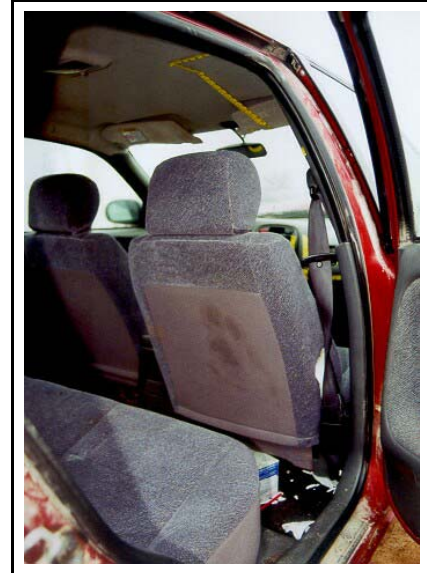
Figure 4. Front right seat back

This contractor's inspection of the front right seat found the seat back operational and not damaged. The back of the seat back was soiled but there was no evidence of loading or damage.