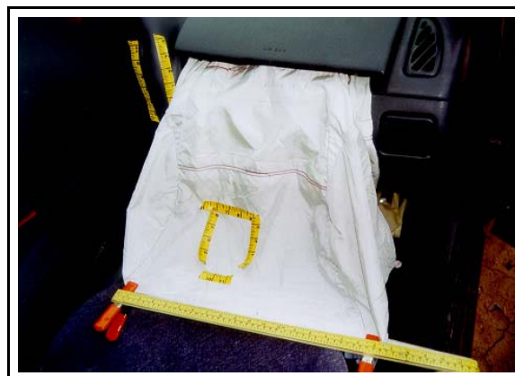
Figure 11. Front right air bag top skin transfer