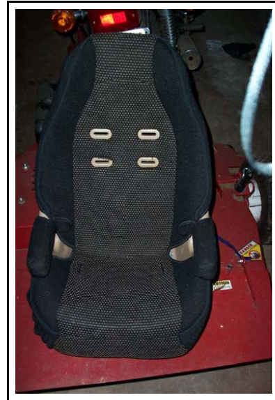
Figure 9. On scene view of child seat

The driver indicated that the 3-year-old child was seated in a forward facing child seat that was being used as belt position booster seat. The child seat was not inspected by this contractor. Photographs were obtained from the insurance adjuster and the child seat was identified as a Cosco Vision High Back Booster child safety seat, Model #02-409-PEP that was manufactured on 12/20/2000. The child seat was in a forward facing position with the child seat harness removed. The manufacturer recommends usage of the child safety seat as a belt-positioning booster for children weighing between 13.6-36.3 kg (30-80 lbs) and a height of 129.5 cm (51.0 in). The 3-year-old child was at the recommended weight but far below the recommended height. The front right seat was equipped with a 3-point lap and shoulder safety seat belt with a sliding latch plate and a switchable retractor. The vehicle's safety belt had indications of historical usage, but there was no evidence of loading as a result of this crash. According to the driver, the 3-year-old child had the ability and history of unbuckling the safety belt.