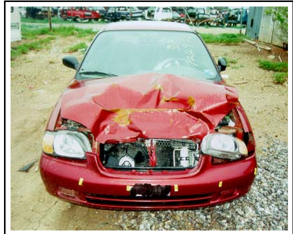
Figure 2. Exterior damage to case vehicle

The case vehicle was traveling westbound at a driver reported 80 km/h (50 mph). This contractor calculated the minimum pre-braking travel speed as 91 km/h (56 mph). As it crested a hill a 68 kg (150 lb) 1 doe ran out in front of the vehicle. The driver braked and the case vehicle deposited 9 meters (30 ft) of pre-impact skid marks. The driver disputes that she braked or deposited skid marks. She indicated she never had time to react.