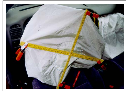
Figure 6. Driver's air bag

The front right passenger's air bag was a mid-mount design located in the right third of the instrument panel. The deflated air bag measured 50.0 cm (19.7 in) wide by 54.0 cm (21.3 in) high. There were five horizontal folds, no tethers, and no vent ports. The air bag had a maximum excursion of 46.0 cm (18.1 in). The module consisted of single module cover flap and measured 41.0 cm (16.1 in) wide by 27 cm (10.6 in) high. There were two occupant contacts that appeared to be skin transfers located on the top aspect of the air bag just left of center, and to the face of the air bag located at the right edge near the stitching. The skin transfers were from the 3-year-old child. There was also module cover scuffing on the top and right edge of the air bag.