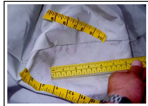
Figure 7. Driver's air bag-lipstick transfer