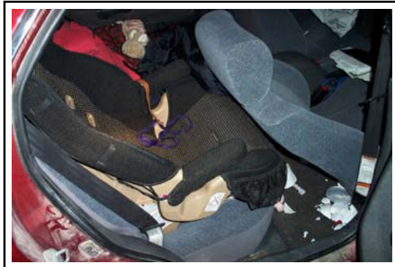
Figure 10. On scene view of rear right seat and child seat

The 3-year-old child sustained an abrasion, air bag burn, on both sides of his face, neck and left shoulder. The air bag lifted him up to some extent and his body contacted the right sun visor and roof header above the sun visor. The sun visor was damaged and there was a visible depression to the roof header. The 3-year-old child