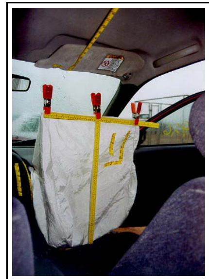
Figure 8. Front right air bag with skin transfer