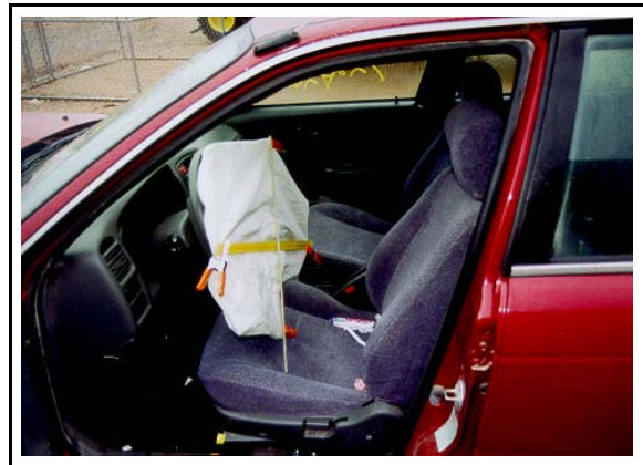
Figure 3. Driver's seat

The front seating positions in the 2000 Suzuki Esteem were configured with fabric covered bucket seats with adjustable head restraints that were adjusted to the full down position. The front left seat was adjusted to four notches rearward of forward most position. The front right seat was adjusted to the rear most track position. Both seat backs were slightly reclined with the front left seat back adjusted at 22 degrees from vertical and the front right seat back at 18 degrees from vertical. The three rear seating positions were configured as a fabric covered bench seat with folding backs, no head restraints and non-adjustable seat.