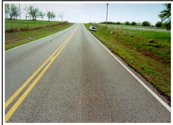
Figure 1. Direction of travel towards impact area (west)

This single vehicle crash versus an animal occurred in March, 2002 at 1945 hours in the state of Oklahoma. The crash occurred on an east/west two lane rural road. At the area of impact, the undulating two lane asphalt roadway is straight, undivided, with a positive 1.7% grade. The roadway is bordered on both sides by depressed grassy areas. The weather was dry and clear. It was dark at the time of the crash and the roadway was not lit. There are no traffic controls present and the speed limit is 89 km/h (55 mph). A nearby resident reported to a local newspaper that there are numerous deer in the area and that numerous crashes have occurred as the deer run onto the road.