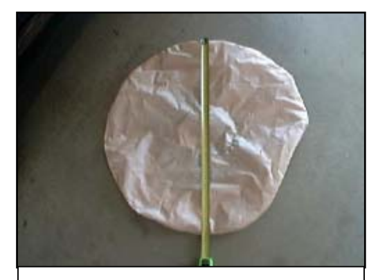
Figure 9. Driver's air bag cut out of module.

The 2002 Lexus SC430 was equipped with an AOPS that consisted of dual-stage frontal air bags for the driver and front right passenger positions. The EDR data did not indicated if the deployment was a single or dual stage deployment. The repair facility had cut the front left air bag out of the module ( Figure 9 ) and the NASS researcher inspected the air bag in this condition. The front left air bag deployed from the center of the steering wheel hub and measured 65.0 cm (25.6") in diameter. The front left air bag module had a triangular cover flap configuration with a horizontal tear seam that was measured by the NASS