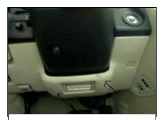
Figure 7. Occupant contacts to the lower left instrument panel.

The 2002 Lexus SC430 was equipped with manual 3-point lap and shoulder belts for all four seating positions. The front safety belts equipped retractor-mounted with pretensioners, which fired as a result of the crash (Figure 8). The driver's safety belt was configured with a sliding latch plate and a beltsensitive Emergency Locking Retractor (ELR). The EDR indicated that both front safety belts were buckled. However, no occupant was present in the front right seat. The lack of occupant loading and the deployment of the safety belt pretensioners in the stowed position