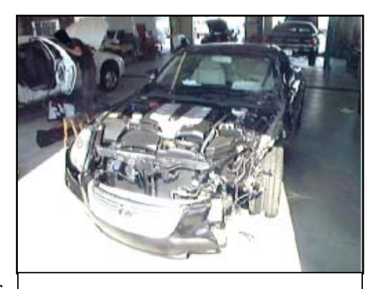
Figure 4. Damage altered by repairs.

The 2002 Lexus SC430 sustained moderate frontal damage as a result of the impact with the 2002 Dodge Ram (Figure 4). The damage to the Lexus had been altered by the repairs prior to the NASS inspection, therefore no damage measurements were obtained. The front left bumper fascia, frame rail, hood, and fender engaged the rear of the Dodge; however, these components were removed and were not inspected. The front of the Lexus underrode the rear of the Dodge resulting in damage to the left A-pillar. The underride damaged consisted of crushing at the base of the A-pillar extending upward approximately half the length of the A-