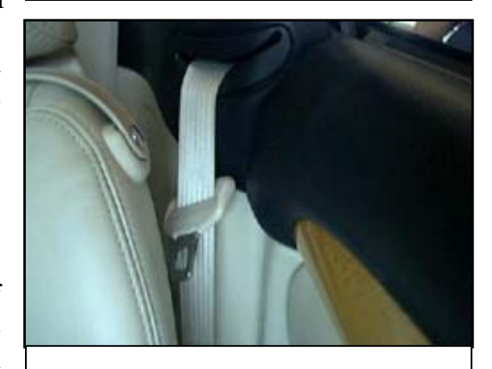
Figure 8. Fired front left safety belt pretensioner.