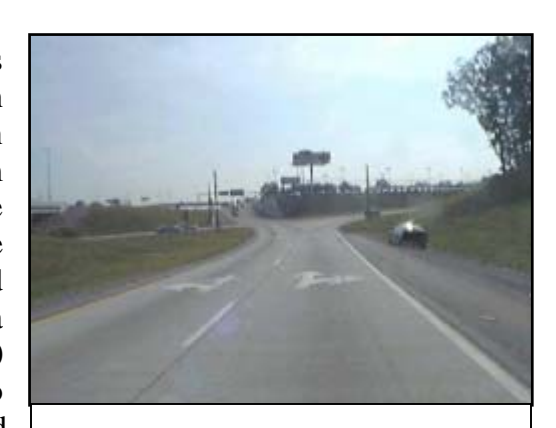
Figure 2. Eastbound approach to intersection.

The 40-year-old male driver of the 2002 Lexus SC430 was operating the vehicle eastbound on the off-ramp approaching the intersection ( Figure 2 ). The driver of the 2002 Dodge Ram was stopped at the intersection. Although the driver of the Lexus braked prior to impact, there was no pre-impact physical evidence was noted at the crash site. The EDR pre-crash data indicated that the Lexus was traveling at 126.0 km/h (78.3 mph) five seconds prior to Algorithm Enable (AE) and the Lexus had slowed to 85.9 km/h (53.4 mph) 0.9 seconds prior to AE. The NASS scene schematic is included as Figure 11 of this report.