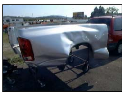
Figure 6. Damaged bed.