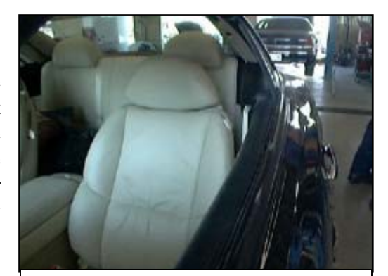
Figure 10. Location of side impact air bag.

The 40-year-old male driver of the 2002 Lexus SC430 was seated in a presumed upright posture and was unrestrained. He was probably slightly out of position forward at impact due to pre-crash braking and elongated crash pulse prior to air bag deployment. The seat track was adjusted to a mid-to-rear position. At impact, the front left air bag deployed and the driver's safety belt pretensioner actuated. The unrestrained driver initiated a forward trajectory and was contacted by the expanding air bag that resulted in the facial abrasions, neck abrasions, and neck contusion. The driver rebounded into the seat back, which resulted in a back contusion. The frontal air bag deployment prevented the driver from possible contact with the steering assembly and windshield. The driver was transported by ambulance to a hospital where he was treated and released.