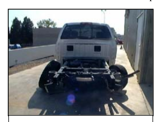
Figure 5. Rear of Dodge under repair.

The 2002 Dodge Ram was under repair at the time of the inspection ( Figure 5 ). The cargo bed and other rear components had been removed from the frame for repairs ( Figure 6 ). No crush measurements were obtained by the NASS researcher. The vehicle did exhibit longitudinal displacement of the bed and rear axle. As a result of the longitudinal displacement, the front of the bed contacted the rear right of the cab. The bed appeared to have underride damage from the impact with the Lexus. The Collision Deformation Classification for this impact was 06-BREE5.