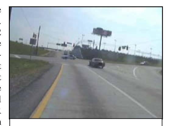
Figure 3. Area of impact.

The front left area of the Lexus impacted the rear right area of the stopped Dodge ( Figure 3 ). The resultant directions of force were within 12 o'clock for the Lexus and 6 o'clock for the struck Dodge. The Lexus subsequently underrode the rear of the Dodge resulting in contact to the A-pillar of the Lexus. The impact resulted in moderate frontal damage to the Lexus and was sufficient to deploy the frontal air bags and safety belt pretensioners. The EDR data indicated that the front safety belts were in use at the time of impact. The EDR recorded a maximum velocity change of 19.5 km/h (12.1 mph) Due to both vehicles being under repair.