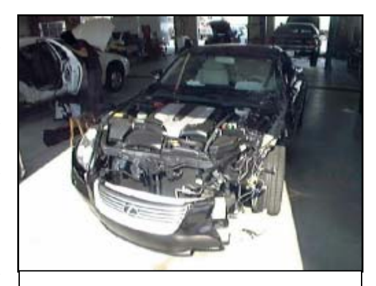
Figure 1. Lexus SC430

This remote investigation focused on the performance of the Advanced Occupant Protection System (AOPS) in a 2002 Lexus SC430. The AOPS features included dual stage frontal air bags and retractor mounted front safety belt pretensioners. The Lexus was also equipped with seat back mounted side impact air bags. The Lexus was also equipped with an Electronic Data Recorder (EDR) that was downloaded by Toyota. The output data is included in this summary report as Attachment A . The Lexus was occupied by an unrestrained 40-year-old male driver. The Lexus ( Figure 1 ) was involved in a moderate severity front-to-