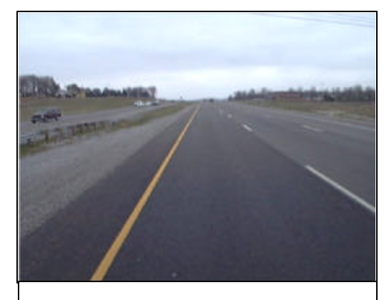
Figure 2. Southbound approach for the Jeep Grand Cherokee

The 25-year-old female driver was fatally injured as a result of the ejection and was found on the inboard shoulder 37 m (121') north of the final rest position of the Jeep Cherokee. She was pronounced dead at the scene. Bystanders removed the child from the CSS prior to the arrival of rescue personnel. Rescue personnel further reported that the CSS was not removed from the vehicle due to the instability of the vehicle at final rest. The 19-month-old child sustained minor injuries and was transported by ambulance to a regional trauma center and admitted for treatment. He was released the following day.