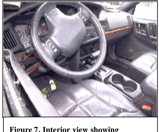
Figure 7. Interior view showing occupant contact damage

Interior damage to the 1998 Jeep Grand Cherokee was severe and was attributed to passenger compartment intrusion. Integrity was lost through the windshield, sunroof, side windows, and the backlight. The left front door, left rear door, and rear hatch were jammed shut. The windshield laminate was fractured and out of place. The glazing in the left side doors disintegrated from impact forces. The left and right side rear glazing and the backlight glazing also disintegrated from There was no steering impact forces. wheel deformation. Multiple contacts were identified from the driver (Figure 7). The left A-pillar was scuffed from contact with the driver's right shoulder, the steering wheel rim was scuffed from contact with the driver's