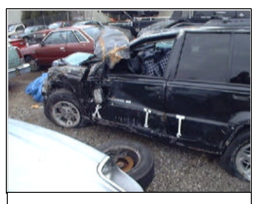
Figure 5. View of left side damage

The 1998 Jeep Grand Cherokee sustained severe damage as a result of the rollover. The entire roof was crushed vertically and the luggage rack was fractured. Lateral abrasions were present on the roof. The left side plane sustained vertical abrasions along the lower aspects of the doors and the left front fender was deformed inward and abraded (Figure 5). The left side lower body cladding was separated. Heavy abrasions were present on the upper aspect of the left A-pillar and on the forward aspect of the left roof side rail. The left front door was deformed inward. The front left corner of the bumper was abraded and fractured, and the front left headlamp was separated. The hood was buckled rearward. The right side sustained heavy abrasions along the entire length of the roof side rail (Figure 6). The right rear wheel was separated, and the lower rear aspect of the right rear quarter panel was separated. The right side alloy wheels were abraded. The right side body cladding was separated. The left wheelbase was reduced by 11.0 cm (4.3") and the right wheelbase was reduced by 12.0 cm (4.7"). The Collision Deformation Classification (CDC) for the rollover was 00-TDDO-3.