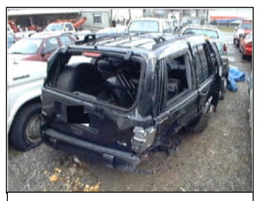
Figure 6. View of right side damage