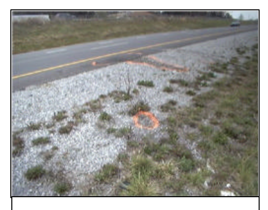
Figure 4. Final rest position of the Jeep Grand Cherokee