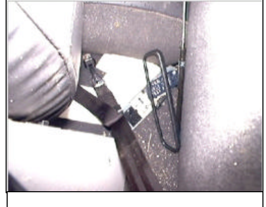
Figure 9. View of tether anchored to the cargo hook

The 19-month-old child was restrained in the CSS with the five-point harness system. The shoulder harness straps were routed through the bottom slots. It was not