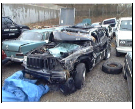
Figure 1. Damaged 1998 Jeep Grand Cherokee

This remote investigation focused on the performance of a forward-facing child safety seat (CSS) that was installed in the rear center position of a 1998 Jeep Cherokee. The Jeep Cherokee sustained severe damage as a result of a high-speed rollover crash while traveling on a divided highway ( Figure 1 ). The 25year-old female driver was unrestrained and was ejected from the vehicle during the rollover event. The vehicle rolled over the driver which resulted in a right frontal open vault skull fracture, multiple bilateral rib fractures, left hand fractures, left thumb amputation, left lower leg fractures, a liver avulsion and laceration, and an avulsion of the intestine. The driver expired at the scene. The 19-month-old male child passenger was