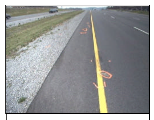
Figure 3. View of rollover trajectory onto the median