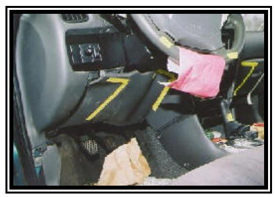
Figure 9. Indentations to the driver knee bolster.

The unrestrained 78 year old male driver of the 1996 Geo Metro LSI was seated in an upright posture with his hands placed at the 10 o'clock and 2 o'clock sectors on the steering wheel rim. The seat track was adjusted to a mid-to-forward position with the seat back angled 18 degrees off vertical. The passenger stated the driver was not belted, further evidenced by the lack of loading evidence to the front left restraint and contact points within the vehicle.