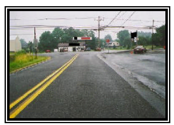
Figure 1. Northbound approach for the 1990 Chevrolet Corvette.

The 78 year old male driver of the 1996 Geo Metro was operating the vehicle eastbound ( Figure 2 ) at a (passenger) reported speed of 48 km/h (30 mph) when he crested the hill and observed the Chevrolet cross his path of travel. Upon recognition of the impending harmful event, the Geo driver braked in avoidance, and remained in the eastbound lane prior to the collision.