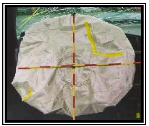
Figure 7. 1996 Geo Metro LSI deployed driver air bag.

The front right passenger air bag deployed from the right mid-instrument panel area with a single cover flap design hinged at the top aspect. The cover flap was rectangular in shape and measured 34.5 cm (13.6 in) in width and 15.5 cm (6.1 in) in height. No contact evidence was identified on the exterior surface of the module cover flap. Heavy concentrations of food spattering (attributed to the food trays in the passenger's lap and coolers stowed in the rear seat) were noted across the lower portion of the air bag face along with blood spattering to the upper left quadrant. The passenger air bag measured 47.0 cm (18.5 in) in width and 65.5 cm (25.8 in) in height in its deflated state ( Figure 8 ). No vent ports or internal tether straps were present. Rearward air bag excursion measured 50.0 cm (19.7 in) from the aft portion of the right instrument panel.