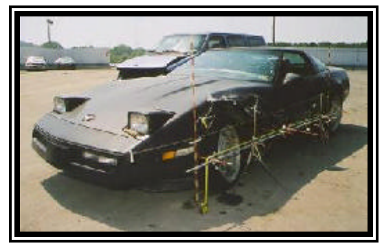
Figure 4. Left front side surface damage to the 1990 Chevrolet Corvette.

cm (7.9 in), C6= 9.0 cm (3.5 in). The Collision Deformation Classification (CDC) for this impact to the Geo was 01-FYEW-3 with a principal direction of force of (+)20 degrees. The hood was deformed up and rearward from engagement against the side surface of the Chevrolet. The left fender was displaced rearward which restricted/deflated the left front wheel/tire. Induced contact damage produced buckling to the roof area at the left A-pillar and B-pillar. The left lower windshield was fractured from exterior impact forces and the left upper windshield from driver contact. Reduction in the left side wheelbase measured 22.5 cm (8.9 in) as reduction in the right side wheelbase measured 2.0 cm (0.8 in). The left front window was rolled completely down and was undamaged. A blood drip pattern was noted on the left exterior door panel.