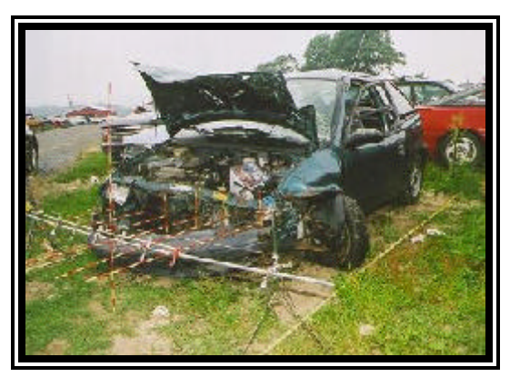
Figure 3. Front left damage to the 1996 Geo Metro LSI.

The 1996 Geo Metro LSI sustained moderate frontal damage as a result of the impact with the Chevrolet Corvette ( Figure 3 ). The direct contact damage began at the front left bumper corner and extended 93.0 cm (36.6 in) inboard. The impact deformed the entire front end width resulting in a combined direct and induced damage length (Field L) of 103.0 cm (40.6 in). Six crush measurements were documented at the level of the reinforcement bar ( bumper fascia separation ): C1= 48.0 cm (18.9 in), C2= 49.0 cm (19.3 in), C3= 50.5 cm (19.9 in), C4= 44.5 cm (17.5 in), C5= 20.0