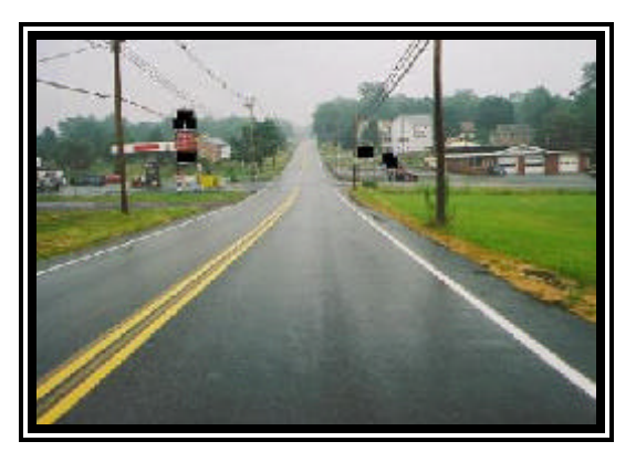
Figure 2. Eastbound approach for the 1996 Geo Metro LSI.