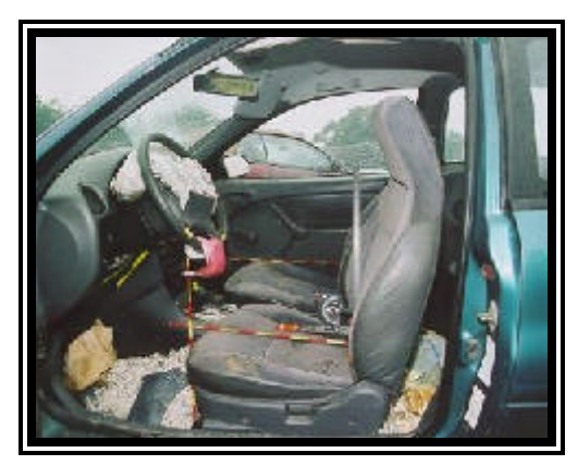
Figure 5. Interior view of the 1996 Geo Metro LSI.

Interior damage to the Geo was moderate and was attributed to occupant contact and component intrusions (Figure 5). Indentations and scuff marks were documented on the left knee bolster. Deformation to the lower portion of the steering wheel rim measured 1.0 cm (0.4 in). No sheer capsule movement was identified. A small spider-web fracture pattern was noted on the upper left windshield, and attributed to the driver's left hand. The floor-mounted transmission lever was deformed forward. A heavy concentration of food was found to be splattered across the roof and front occupant space from ice coolers stowed in the rear seating area pre-crash. This cargo shift