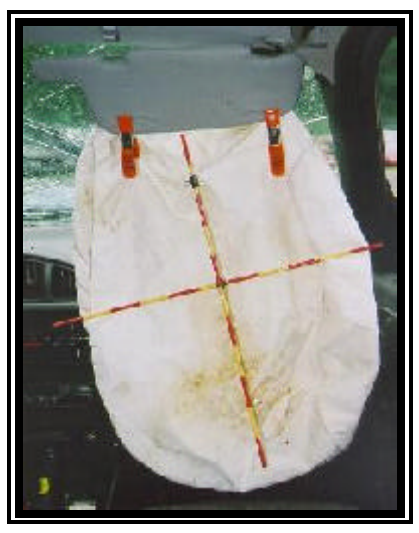
Figure 8. 1996 Geo Metro LSI deployed passenger air bag.