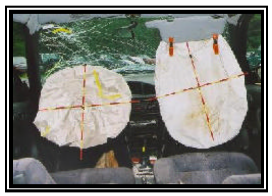
Figure 6. 1996 Geo Metro LSI deployed frontal air bag system.

The 1996 Geo Metro was equipped with frontal air bags for the driver and front right passenger positions which deployed as a result of the crash ( Figure 6 ). The driver air bag was identified by the following part number: PE5114100-01 with a bar coded lot number of: TBS6135B0113. The air bag was housed in the center of the steering wheel with a horizontally oriented flap tear seam (H-configuration). The flaps were nearly symmetrical in shape as the upper flap measured 15.4 cm (6.1 in) in width and 6.0 cm (2.4 in) in height while the lower flap measured 15.4 cm (6.1 in) in width and 7.8