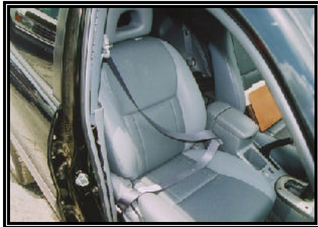
Figure 6: Buckled right front restraint.