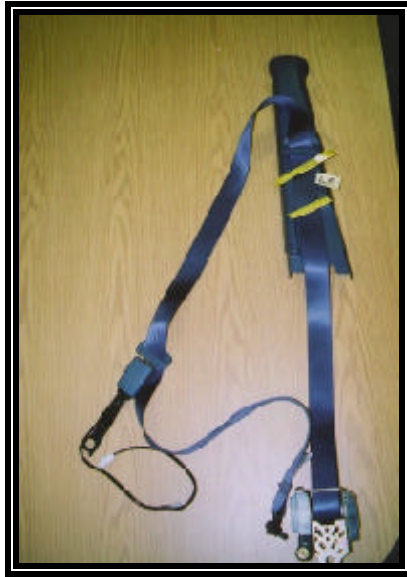
Figure 7: Left front restraint.