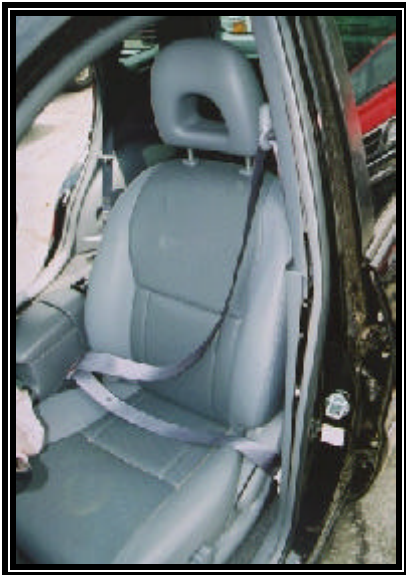
Figure 5: Buckled left front restraint.

All the evidence identified during the course of the SCI inspection indicated the driver and front right passenger were properly restrained at the time of the crash and the restraint system operated as designed. It should be noted that no complaint of restraint failure was ever registered with the police officer during the on-scene investigation.