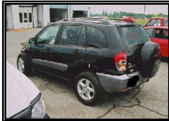
Figure 4: Left rear side slap damage.

Minor exterior damage consistent with a secondary side slap was identified on the left rear corner of the vehicle, Figure 4 . The width of the direct contact measured 66 cm (26 in). The damage began 5 cm (2 in) aft of the left rear axle and extended to the left rear corner. The residual crush profile was as follows: C1=3.8 cm (1.5 in), C2=3.8 cm (1.5 in), C3=1.3 cm (0.5 in), C4=0. The CDC of this impact was 09-LBEW-1