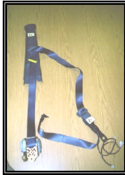
Figure 8: Right front restraint.