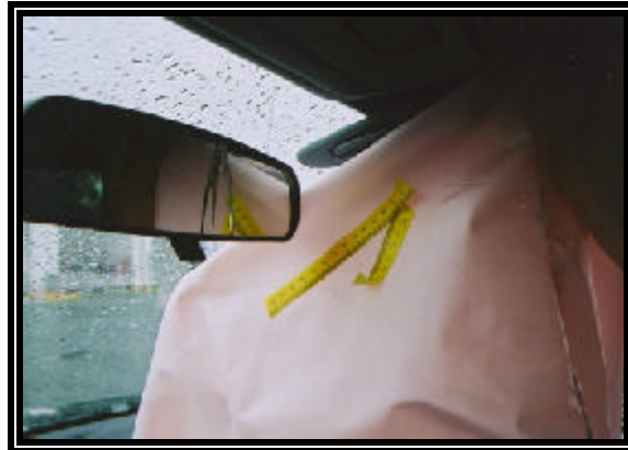
Figure 10: Contact between the center mirror and passenger air bag.

the module as a result of the above-threshold impact. The face of the bag measured 46 cm x 46 cm (18 in x 18 in) and extended 58 cm (23 in) from the module in its deflated state. It was not tethered and was vented by two 6.4 cm (2.5 in) diameter ports on the side panels of the air bag. There was no contact evidence on the face of the air bag. A 2.5 cm (1.0 in) vinyl transfer was identified on the center aspect of the inboard side panel. The transfer was located 15 cm (6 in) forward of the face of the bag and 8 cm (3 in) below the bag's top surface. During the crash sequence, the right passenger deflected the normal deployment path of the front right air bag into contact with the center mirror. The contact fractured the mirror and resulted in the vinyl transfer, Figure 10 .