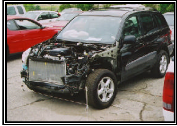
Figure 3: Left front view of the Toyota.

Minor exterior damage consistent with a secondary side slap was identified on the left rear corner of the vehicle, Figure 4 . The width of the direct contact measured 66 cm (26 in). The damage began 5 cm (2 in) aft of the left rear axle and extended to the left rear corner. The residual crush profile was as follows: C1=3.8 cm (1.5 in), C2=3.8 cm (1.5 in), C3=1.3 cm (0.5 in), C4=0. The CDC of this impact was 09-LBEW-1