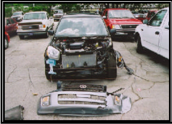
Figure 2: Front view of the Toyota Rav4.