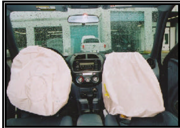
Figure 9: Interior view of the deployed air bags.

The 2001 Toyota Rav4 was equipped with a Supplemental Restraint System (SRS) that consisted of redesigned driver and front right passenger air bags. The frontal air bags had deployed as a result of the above-threshold crash, Figure 9 . The driver air bag module was configured in the typical manner in the center hub of the steering wheel. The asymmetrical module cover flaps opened as designed and were free of occupant contact. The driver air bag measured 66 cm (26 in) in its deflated state. The bag was tethered and was vented by two 3.8 cm (1.5 in) diameter ports located in the 11/1 o'clock sectors on the back side of the bag. The bag was identified by a manufacturer's label bearing the number: 011182H0668. A contact scuff measuring 3.8 cm x 10.2 cm (1.5 in x 4.0 in), width by height, was located in the 2 to 3 o'clock sector on the face of the bag. The scuff resulted from probable contact with the driver's upper extremities during the deployment sequence.