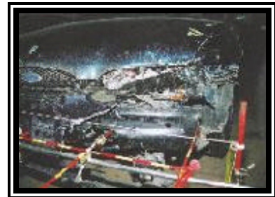
Figure 5. Close-up view of the damaged area.