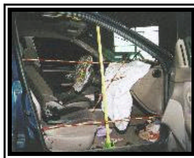
Figure 9. Interior view of the front right passenger space.

The unrestrained 5 year old male passenger of the 1996 Ford Contour GL was presumed to be seated in an upright posture with the seat track adjusted to the full rearward position ( Figure 9 ). The length of the seat cushion and short femur length of an average child this age probably necessitated a more comfortable forward position in the seat with the upper body more upright. Lack of restraint usage was determined by the trajectory of the child and contact points within the vehicle. In addition, there was no loading evidence on the belt system and the system yielded minimal routine usage indicators for the recorded mileage. He was wearing a blue winter parka which was later found to be stained with blood and cut by paramedics during post-crash treatment at the scene.