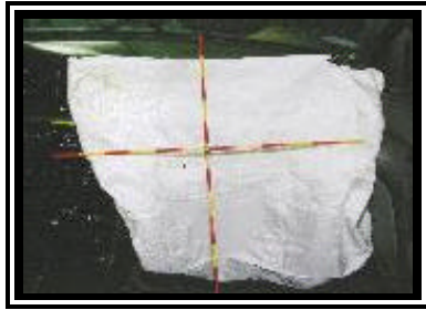
Figure 7. 1996 Ford Contour GL deployed passenger air bag.

air bag during the collision sequence produced two distinct scuff marks on the right mid-windshield area from the upper portion of the air bag. In addition, small abrasions were noted to the bottom portion of the air bag from intra-flap snagging during bag expansion. The bag was tethered by two internal straps sewn to the top seam and vented by one port located at the 10 o'clock sector on the inboard aspect of the air bag.