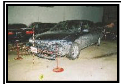
Figure 4. Frontal damage to the 1996 Ford Contour GL.

The Ford sustained minor frontal damage as a result of the impact with the guardrail ( Figure 4 ). The direct contact damage began at the front left bumper corner and extended 42.0 cm (16.5 in) inboard. The combined direct and induced damage length (Field L) measured 144.0 cm (56.7 in). Although no crush was identified at any of the six bumper level measurements, a secondary profile was obtained at the level of the mid-radiator [11.0 cm (4.3 in) above the level of the bumper] to capture the underride damage resulting in an averaged profile of: C1= 13.0 cm (5.1 in), C2= 7.0 cm (2.8 in), C3= 0 cm, C4= 0 cm, C5= 0 cm, C6= 0 cm. The left portion of the bumper fascia fractured and separated from the reinforcement bar during the collision sequence. The left headlamp assembly shattered with minimal hood displacement noted from the guardrail underride ( Figure 5 ). The left fender was deformed slightly rearward with 75.0 cm (29.5 in) of direct contact damage documented rearward along the side surface of the vehicle. The right front wheel was deflated (not restricted) with no notable rim damage from the barrier curb contact. A film of road salt was noted over the surface of the vehicle. The windshield was undamaged.