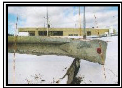
Figure 3. Impacted guardrail.