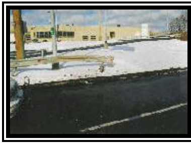
Figure 2. Northwest approach into the guardrail impact.