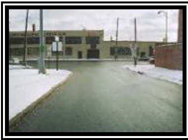
Figure 1. Eastbound approach for the 1996 Ford Contour GL.

The 25 year old female driver of the 1996 Ford Contour GL was transporting her children to school and day care. She was operating the vehicle eastbound on the inboard lane of an urban two lane (one-way) local street on approach to a 3-leg intersection ( Figure 1 ). She stopped at the signalized intersection and initiated a left turn to proceed northbound on the one-way connector. As the Ford entered the northbound lanes, the driver became distracted by the rear seated child occupants and continued a 125 degree constant radius turn towards the west pavement edge ( Figure 2 ).