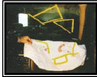
Figure 8. Air bag scuffs to the right windshield area and blood stains to the bottom portion of the passenger air bag.