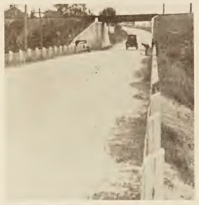
SURFACE TREATED TOPSOIL ROAD BETWEEN GREENVILLE AND ANDERSON, S. C., SECTION 4

The selection of materials to be used in the seal treatment will depend upon the purpose of treatment. If it is desired to enliven the surface and prevent raveling of an already heavy mat, a light application of a cold cut-back asphalt containing a readily volatile distillate is used with small-sized mineral aggregate. it is necessary to strengthen the old surface mat by adding appreciable thickness, a heavier bituminous material such as is used in original construction is applied hot with larger mineral cover. Whatever the purpose, it is highly important that the mineral cover be suited to the bituminous material selected.