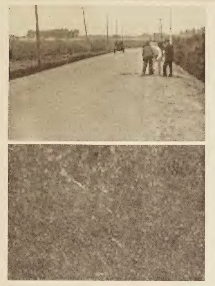
SECTION 4 BETWEEN GREENVILLE AND ANDERSON, S. C. SURFACE TREATED TOPSOIL ROAD RESEALED AND COV-ERED WITH LIMESTONE CHATS

mineral cover for a width of approximately 2 feet along the sides. This is accomplished by placing nozzles with larger openings on that portion of the spray bar which applies the material along the edges.