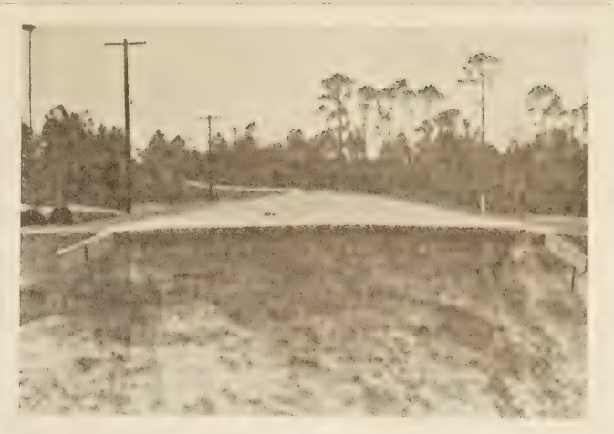
CROSS SECTION OF SURFACE TREATED SAND-CLAY ROAD (RESULT OF WASHOUT) SHOWING SUBSOIL AND WOODEN CURBS. SECTION 1 IN FLORIDA

Laboratory tests on available local material serve as a useful guide in original selection and in the correction of mixtures which have proven faulty. Preference should be given to materials having some pebbles retained on the 10-mesh sieve and passing a 1-inch screen.