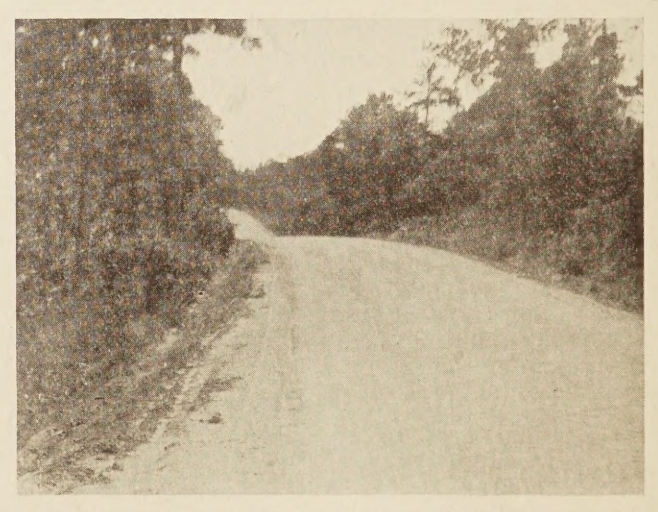
SHOULDER MATERIAL BLADED OVER WEAK PAVEMENT EDGE IN SOUTH CAROLINA

A seal coat was applied during August, 1928, consisting of cut-back asphalt meeting specification AC-2 and applied at the rate of 0.26 gallon per square yard and covered with 34-inch to 34-inch crushed granite at the rate of 25 pounds per square yard and rolled. The cost of the seal coat was $600 per mile and the cost of maintenance during 1928 including shoulder maintenance was $12.50 per mile per month. This highway carries an average traffic of 1,220 vehicles per day.