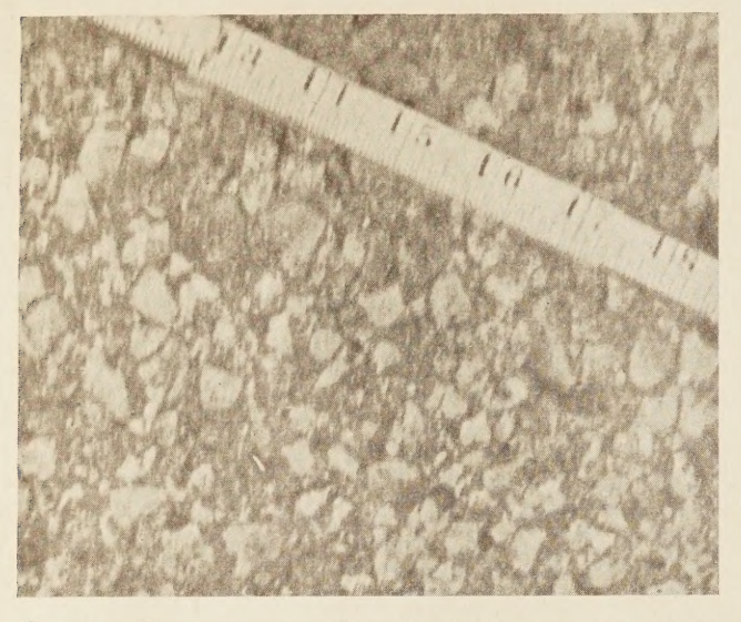
SURFACE TREATMENT ON SECTION 3 (FLORIDA ROUTE 1)

tion did not involve the use of a stabilizer course as did Florida sections 1 and 2. The reshaped topsoil surface, which had been allowed to compact under traffic for a period of 30 to 90 days, was swept with a rotary power broom in conjunction with hand brooms to remove all loose material. Tar priming material meeting State specification TC-1, grade 1, was then applied at a