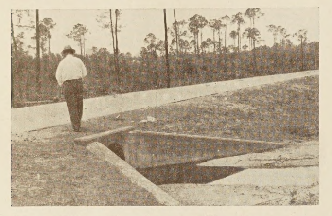
Surface Treated Sand-Clay Road With Cypress Curbs and Wide Sloping Shoulders on Section 1 in Florida

Section 2.—Sand-clay road; width, 20 feet; compacted depth at center, approximately 8 inches and 6 inches at sides; laminated red cypress planks 3 by 8 inches used as permanent curbs, at cost of $950 per mile installed; road maintained for approximately four months by blading, during which time it was subjected to a traffic of 1,030 vehicles per day.