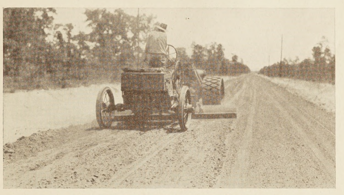
PREPARING A SAND-CLAY ROAD FOR SURFACE TREATMENT

The method of construction requires the application of surfacing material upon the prepared subgrade in sufficient quantity so that after compaction it will have the specified thickness. For natural sand-clay mixtures South Carolina requires that the material deposited each day shall, on that day, be twice plowed and harrowed, except when in the judgment of the engineer the material is too dry or too wet to be plowed and harrowed properly. Florida does not specify plow-