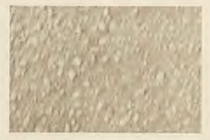
FRESHLY BLADED GRAVEL STABILIZER ON SAND-CLAY BASE. SECTION 1 IN FLORIDA

Careful preparation of the sand-clay or topsoil is essential to the construction of a satisfactory surface treatment wearing course. Any defects or irregularities in the surface of the base will be reflected in the surface treatment and later correction will be more difficult and expensive. The untreated base should have the desired smoothness and shape of the finished road and should be thoroughly compacted and well bonded. To obtain these conditions it is usually necessary to do a considerable amount of machine work shortly before surface treatment which may consist of scarifying, harrowing, blading, and dragging. During dry weather it may be necessary to sprinkle the road with water during these processes. Compaction of this type of road is effected by traffic and some regulating measure for causing traffic to distribute itself uniformly over the road surface is advisable. This may be accomplished by placing obstacles at suitable intervals to force traffic over desired lanes and varying these lanes as seems advisable.