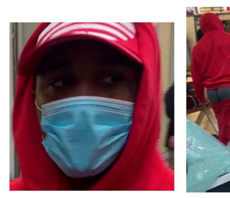
Still shots of SUSPECT 10 from videos

I saw that SUSPECT 10 had an "S" shaped mark (consistent with a tattoo) under the corner of his left eye.