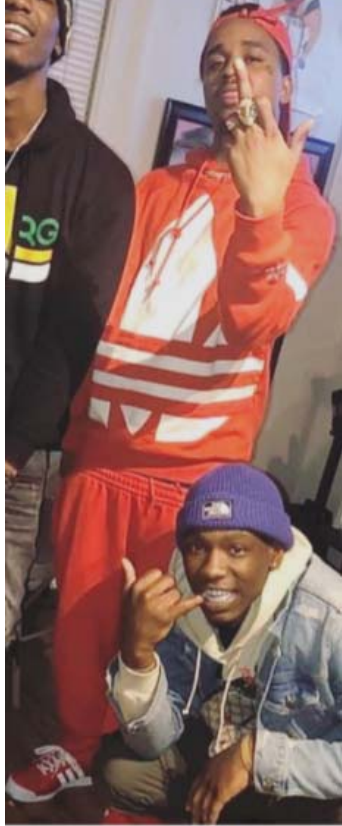
From Instagram Post

The rings worn by SUSPECT 10 and by MEANS in the Instagram photograph also appeared consistent. (Although they were worn on the right hand on May 30, 2020, and on the left hand in the Instagram photo.)