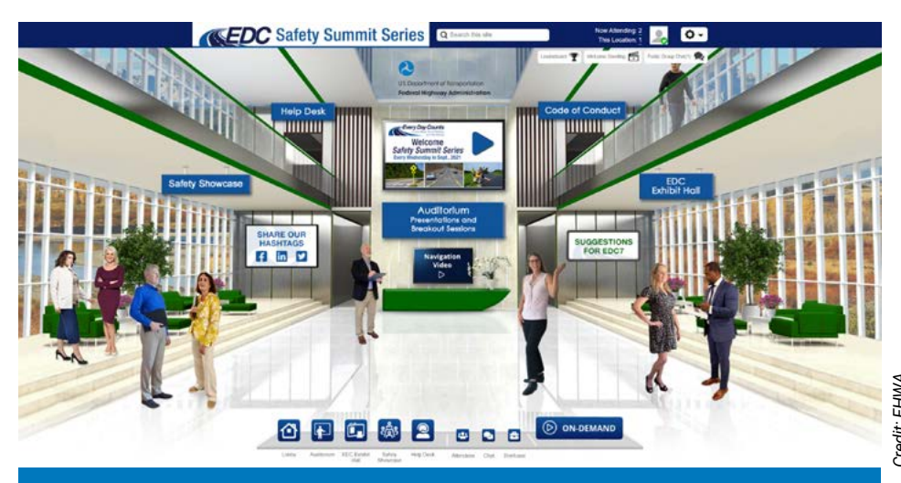
View any of the Safety Summit sessions on demand from the virtual conference platform website.

As communities desire "complete streets" and more livable spaces, agencies must better integrate pedestrian and bicycle facilities, as well as transit options. A road diet can be a great option for communities to convert an existing fourlane, undivided highway to a three-lane road with