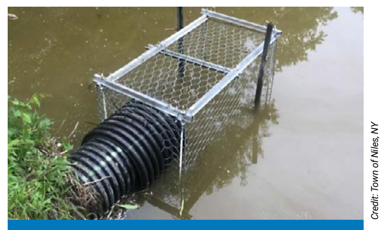
The beaver pipe cage keeps the animals from packing culverts with sticks and mud.

The California DOT (Caltrans) responder system helps incident responders, especially those in remote or rural areas where communication coverage is sparse, collect and transmit at-scene information quickly and efficiently. This communications tool allows details to be shared between responders, the traffic management