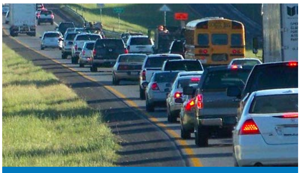
INDOT is using crowdsourced hard braking data to help identify and prioritize safety improvements.

By comparing 4.5 years of crash data at eight locations with just 1 month of hard braking data, the Purdue team found a correlation between hard braking and rear-end crashes, meaning this type of crowdsourced data is a good surrogate for safety analysis. INDOT also pays close attention to hard braking events