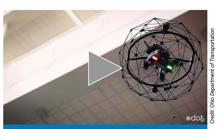
The Ohio DOT's UAS Center uses unmanned aerial systems to increase safety and efficiency in maintaining the State's roadways.

The Texas DOT (TxDOT) U.S. 175/S.M. Wright Freeway phase 1 project reconfigured an elevated highway that divided a neighborhood south of downtown Dallas and had several safety