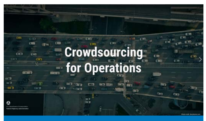
Launch the storyboard for more examples of States using crowdsourcing to improve operations.

"These examples from Indiana show the value agencies can derive from crowdsourced data," said Colyar. "And, as more vehicles become connected and more applications for crowdsourced data are discovered, crowdsourcing information will become invaluable for agencies of all sizes."