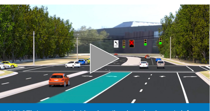
NCDOT's instructional video describes how the dynamic left turn intersection works.

tablets, and smartphones. The digital , shared concrete pour log allows staff and contractors to access up-to-date information instantly regardless of location, reducing the chances for confusion or incorrect information during a pour.