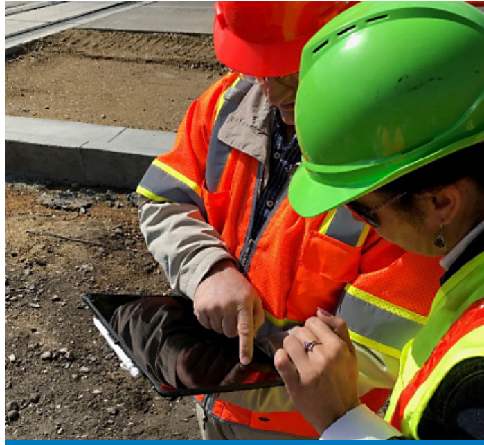
e-Construction technologies such as mobile devices and applications for field inspection improve real-time collaboration.

conventional paper plans. This further integrates and streamlines the design to construction workflow and produces more opportunity for collaboration to resolve issues before they get to the field. Institutionalizing these digital practices is making what was innovative now common practice.