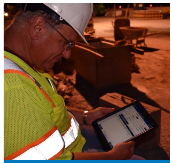
e-Ticketing data helps manage material deliveries, testing, and quantities as projects play out in real time.

e-Ticketing aggregation systems commonly benefit both DOTs and contractors by streamlining and simplifying materials payments. DOTs