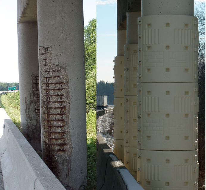
ODOT is employing a polyethylene product that wraps around concrete pier columns to prevent chloride penetration and corrosion.

ODOT has tried applying protective coatings on some piers but found that over time the coatings can peel or wear away. In 2013, ODOT began testing a new polyethylene product that wraps around concrete pier columns to prevent chloride penetration and corrosion. ODOT's observations so far are that the protected pier concrete has not experienced accelerated deterioration as compared to the unprotected concrete used as a control.