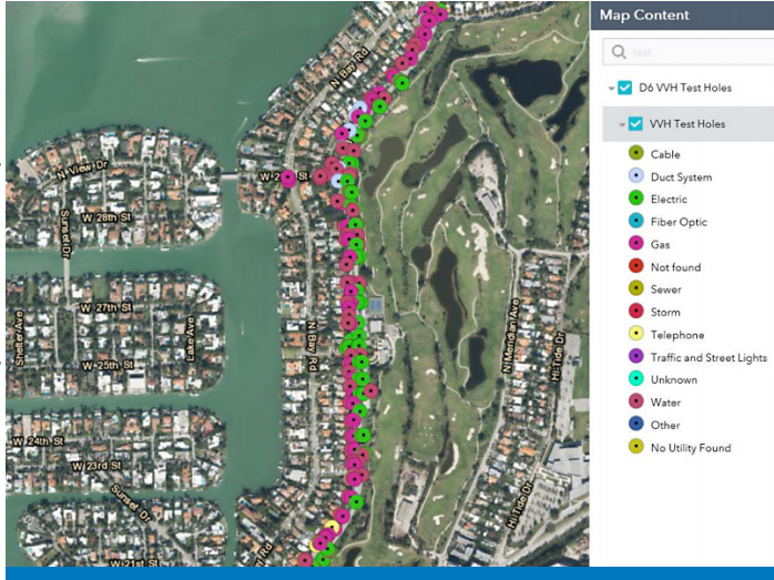
FDOT implemented an enterprise GIS solution for compiling information from test holes.

The Florida Department of Transportation (FDOT) estimates savings close to $223,000