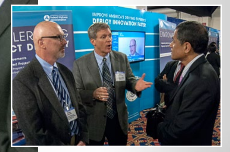
FHWA's Center for Accelerating Innovation displays at the TRB annual meeting drew visitors interested in learning how deploying innovation is improving the nation's highway system.