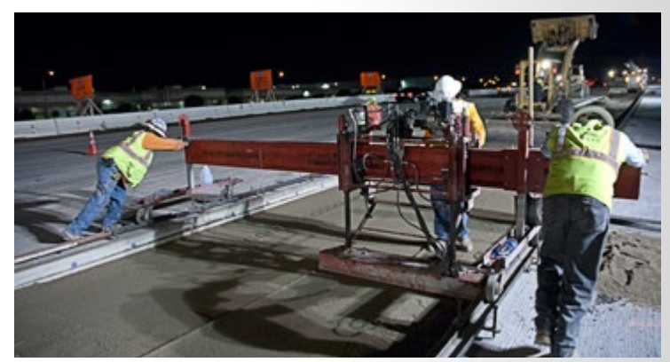
Crews prepare to install precast slabs on a California road rehabilitation project.

The project enhanced the road's smoothness. Its International Roughness Index measurement dropped from 225 inches per mile before construction to 66 after, still short of