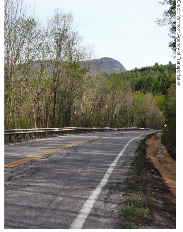
A Vermont highway resurfacing project will use warm-mix asphalt, which reduces fuel use and produces fewer fumes than hot-mix asphalt.

The Safety Edge, which many states are trying on paving projects to mitigate pavement edge drop-off, has been used in Vermont for some time. The Safety Edge is created by a paver attachment that forms a 30- to 35-degree taper from the top of the pavement to the graded shoulder. On roads where roadway departure crashes can occur, the Safety Edge can save lives because it enables drivers who drift off the edge to return to the roadway more easily.