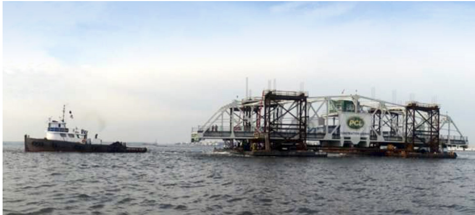
To limit bridge closure time on a South Carolina project, the new swing span was built off-site and moved to the bridge site on a barge.

The project increased the width of travel lanes from 10 to 14 feet (3 to 4.2 meters) and the sidewalk from 2.5 to 5.5 feet (0.7 to 1.6 meters), which is expected to enhance safety for motorcyclists, bicyclists and pedestrians in the future.