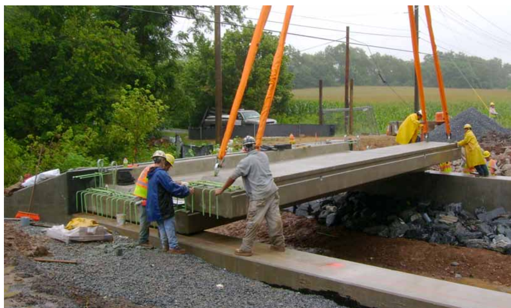
Precast slabs and other innovations helped the Maryland SHA cut construction time and enhance quality on a bridge replacement project.

To read the Maryland, Minnesota and other technical reports on Highways for LIFE demonstration projects, go to www.fhwa.dot.gov/hfl/summary/projects_summary.cfm .